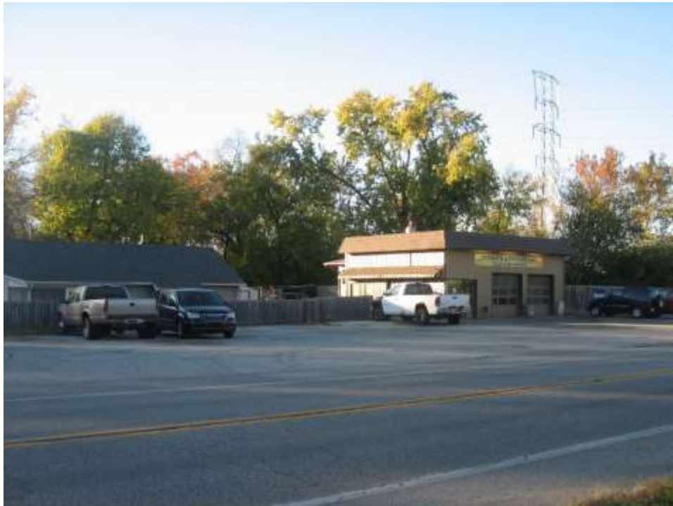
Photo of adjacent automotive repair to the north, looking northwest.