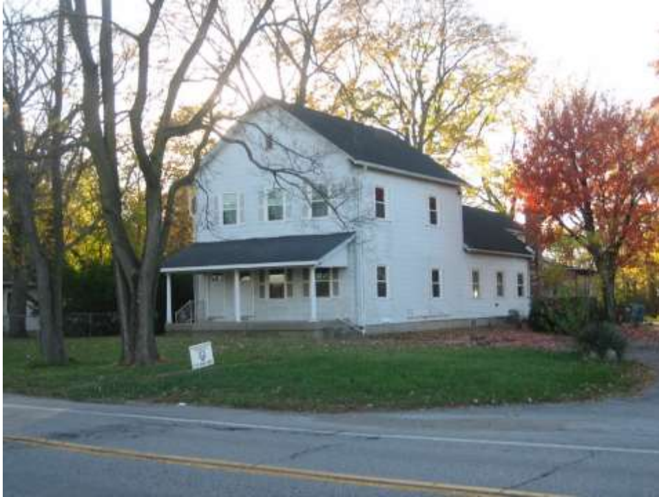
Photo of subject site, looking southwest.