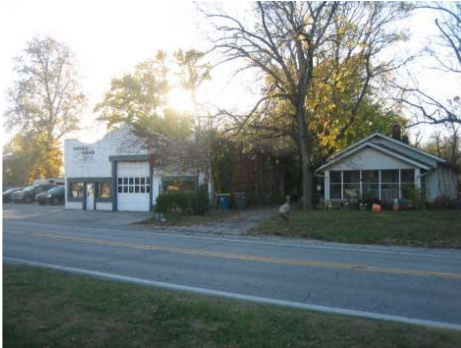
Photo of single family dwellign and automotive repair to the south, looking west.