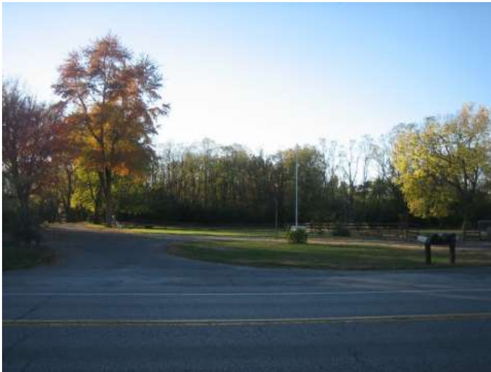
Photo of subject site side yard and pavement drive, looking west.