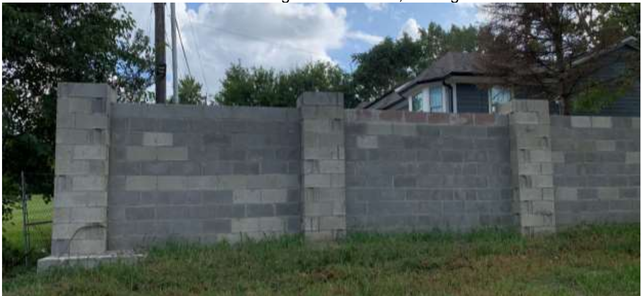
View of fence along Chelsea Road, looking south