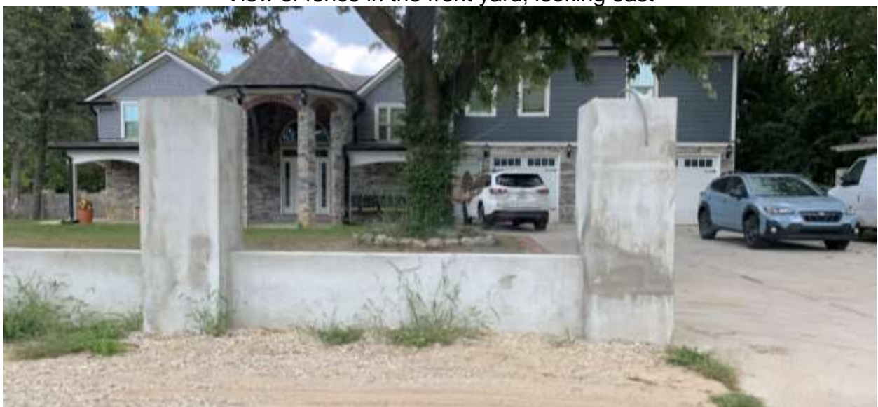
View of fence in the front yard, looking east