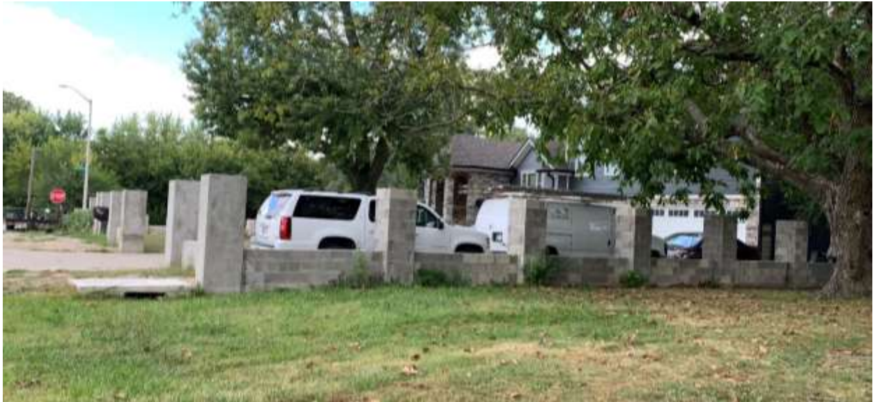
Subject site front and side yard fence viewed from Biltmore Avenue, looking north