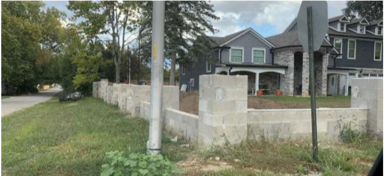
View of fence along Chelsea Road, looking east