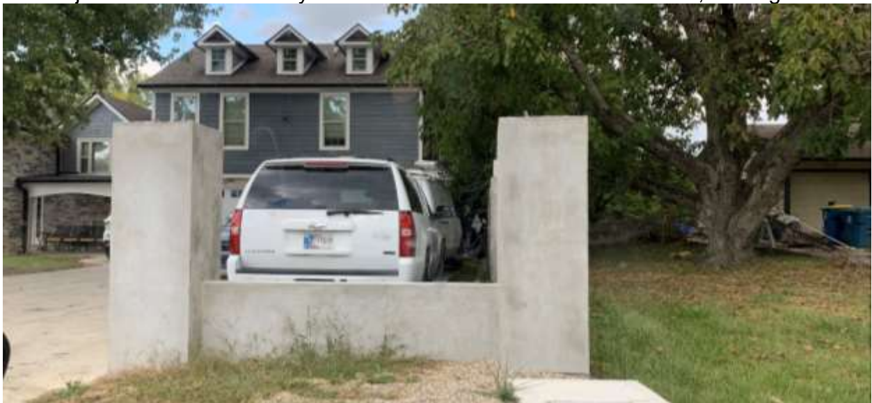
View of fence in the front yard, looking east