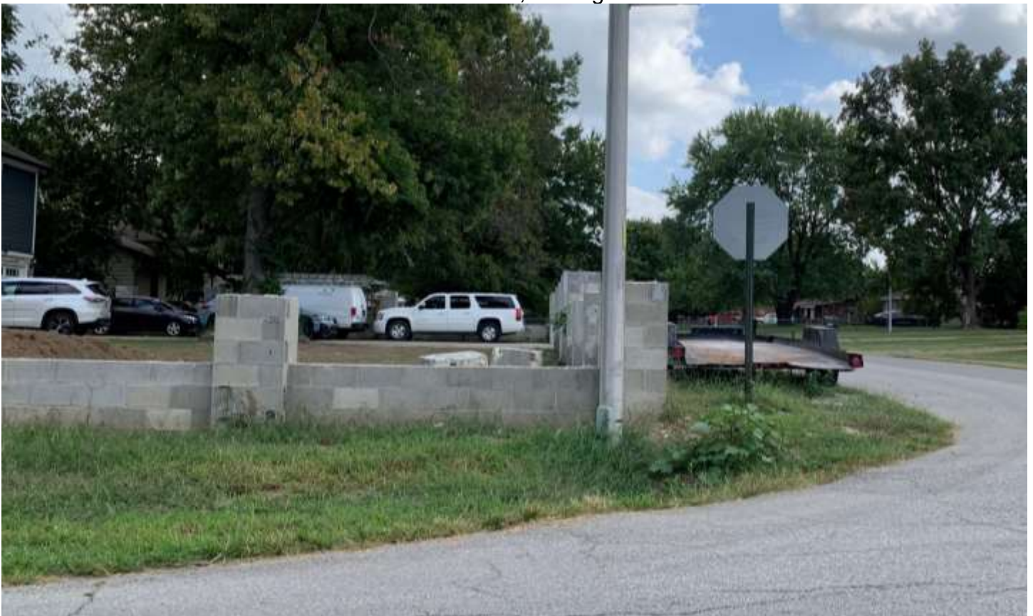
View of fence in the right-of-way and clear sight triangle at the intersection of Biltmore Avenue and Chelsea Road, looking south