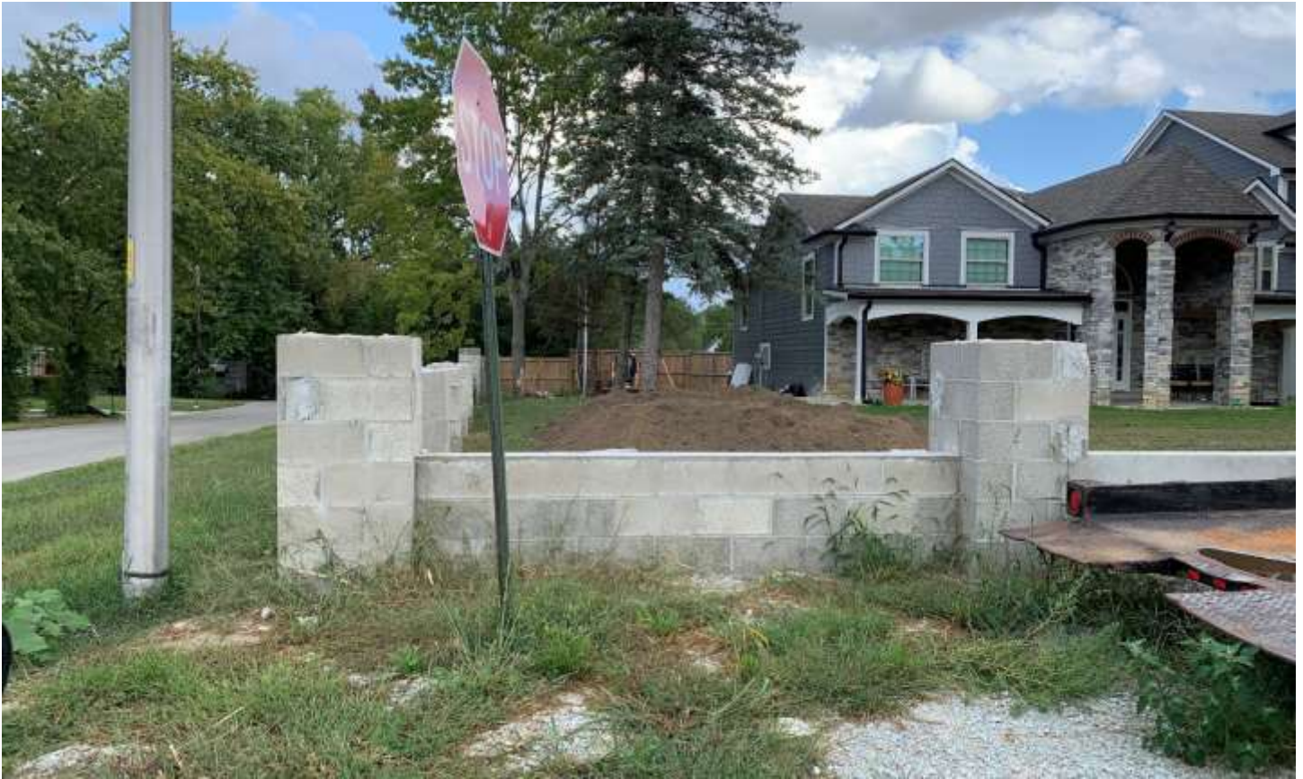
View of fence in the right-of-way and clear sight triangle at the intersection of Biltmore Avenue and Chelsea Road, looking east