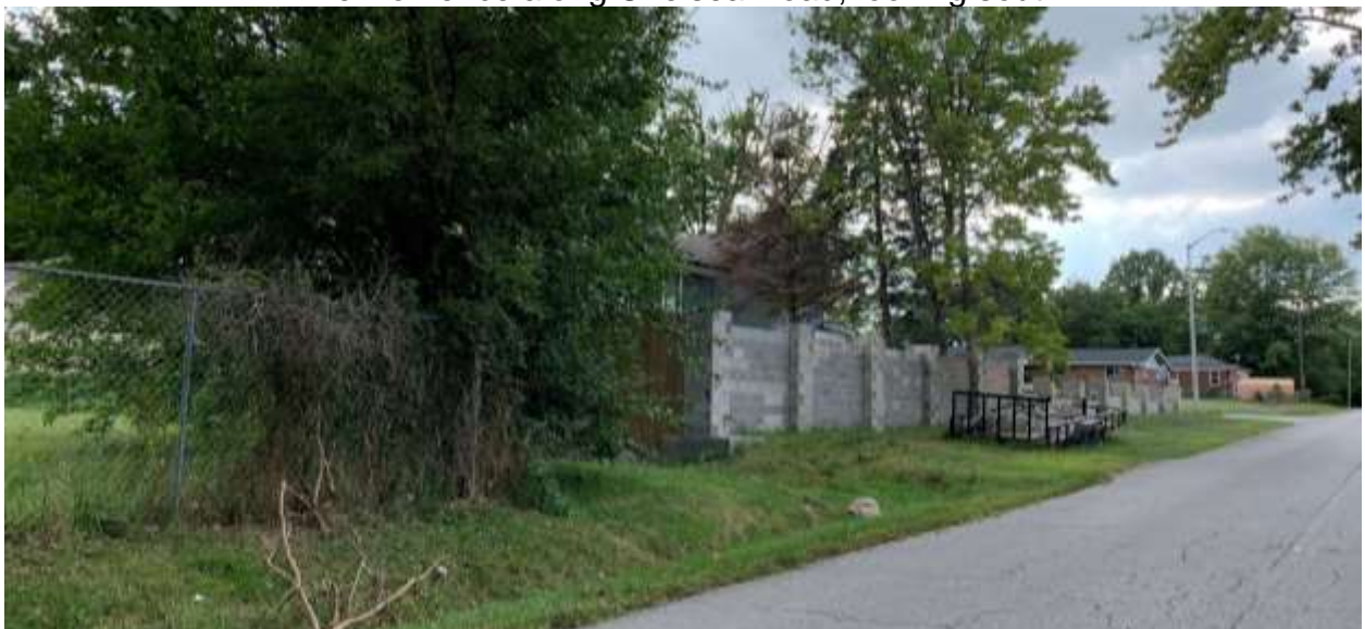
View of fence along Chelsea Road, looking southwest