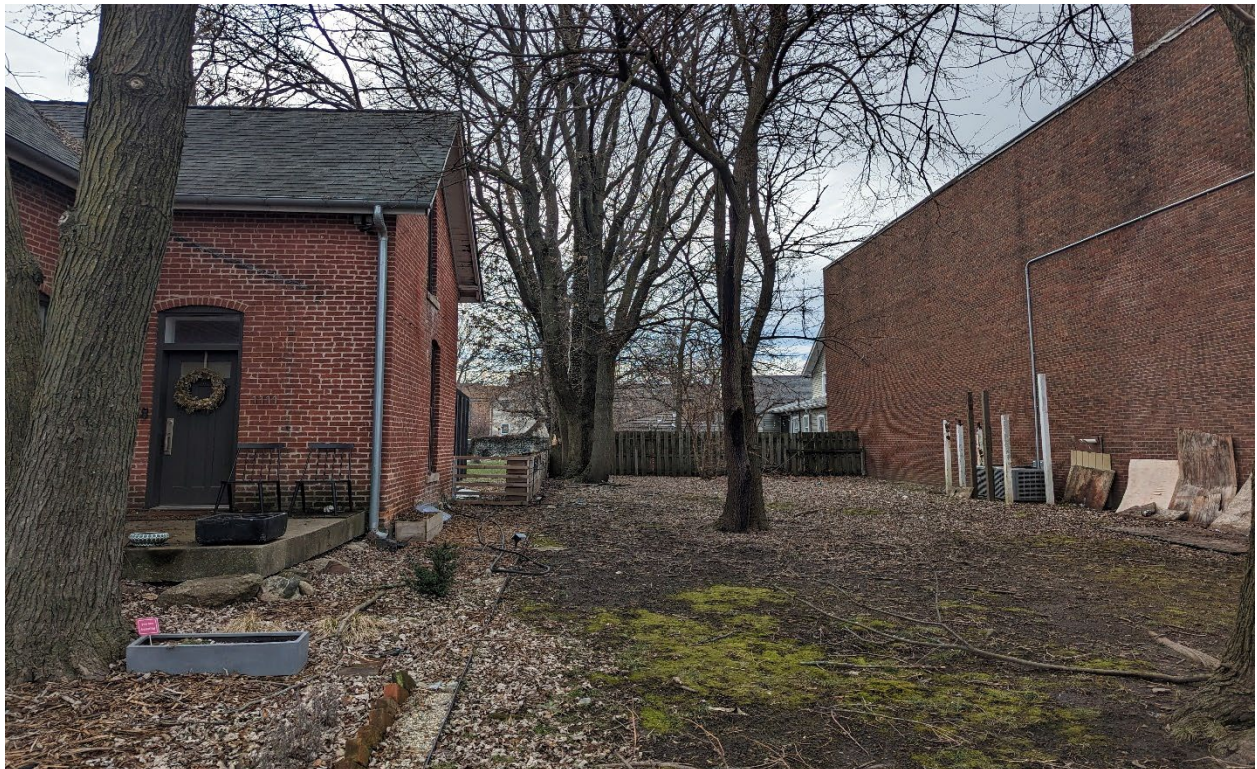
Photo Six: Undeveloped Portion of Subject Site and Existing Dwelling to the East