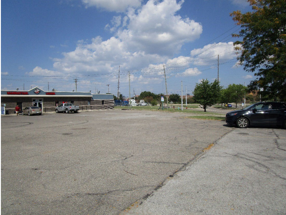
View of site looking northeast