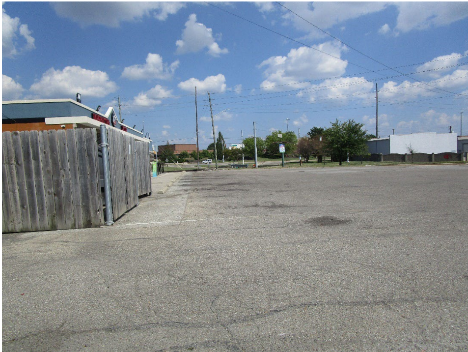
View of site looking east