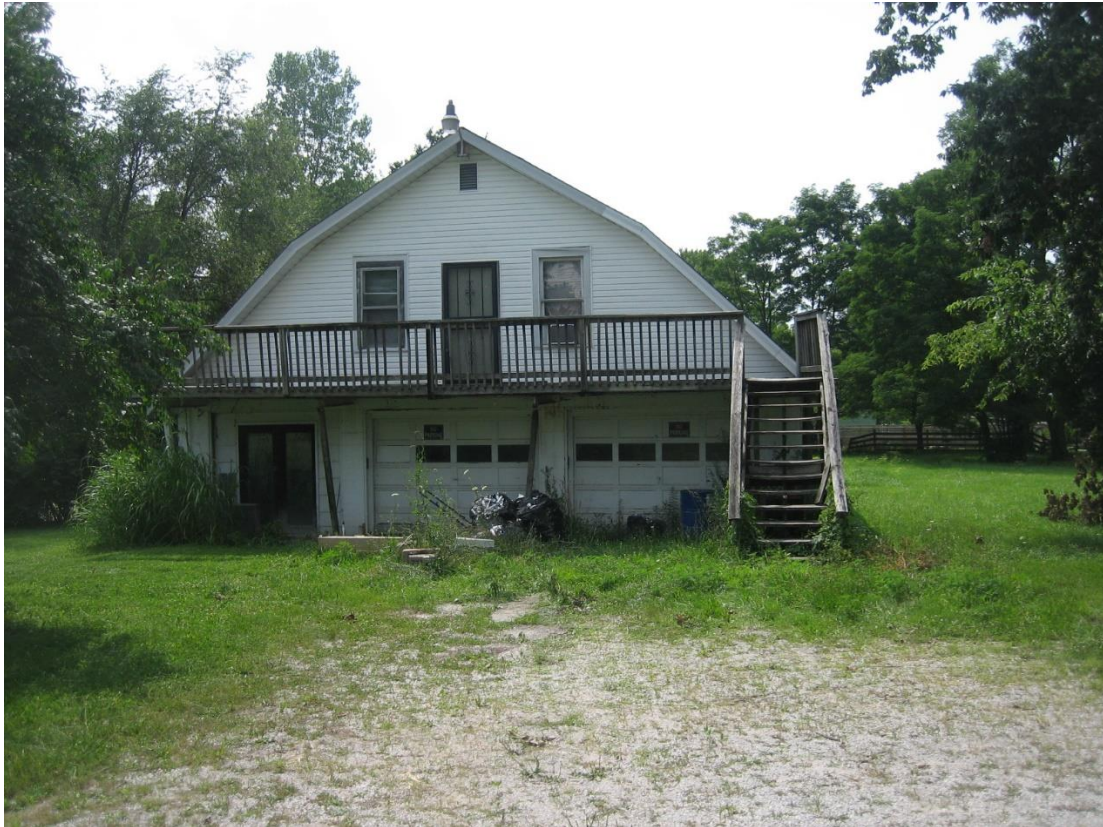
Photo of the subject site, second primary dwelling on parcel 1, looking west