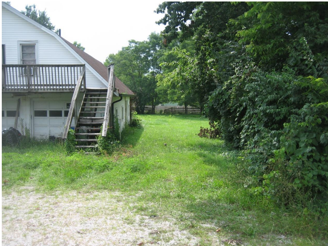
Photo of the subject site, second primary dwelling proposed zero foot north side setback on parcel 1, looking west