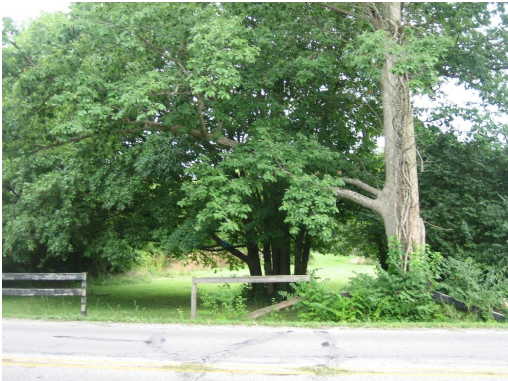
Photo of the subject site, south side yard on parcel 1, looking west