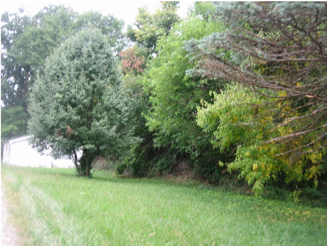
Photo of subejct site parcel two frontage, looking west.