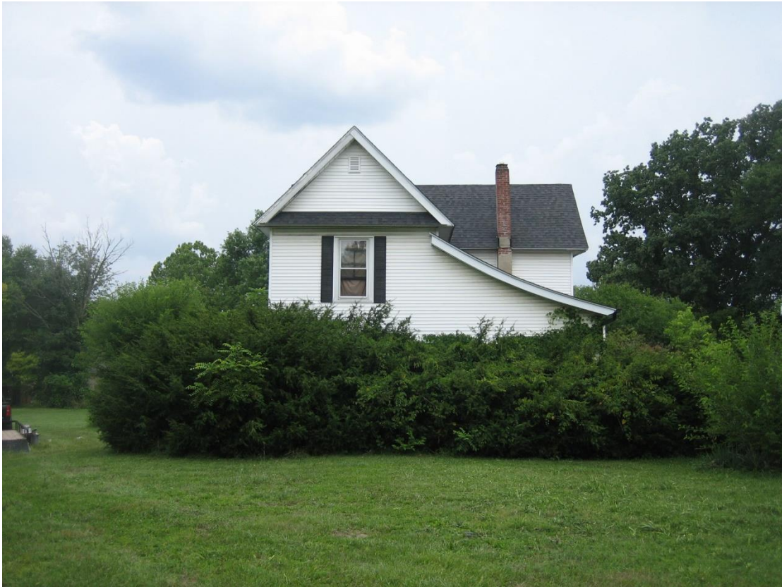
Photo of the subject site, primary dwelling on parcel 1, looking west