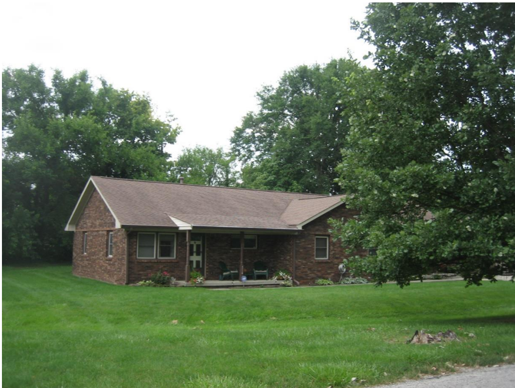
Photo of adjacent property to the north, looking south.