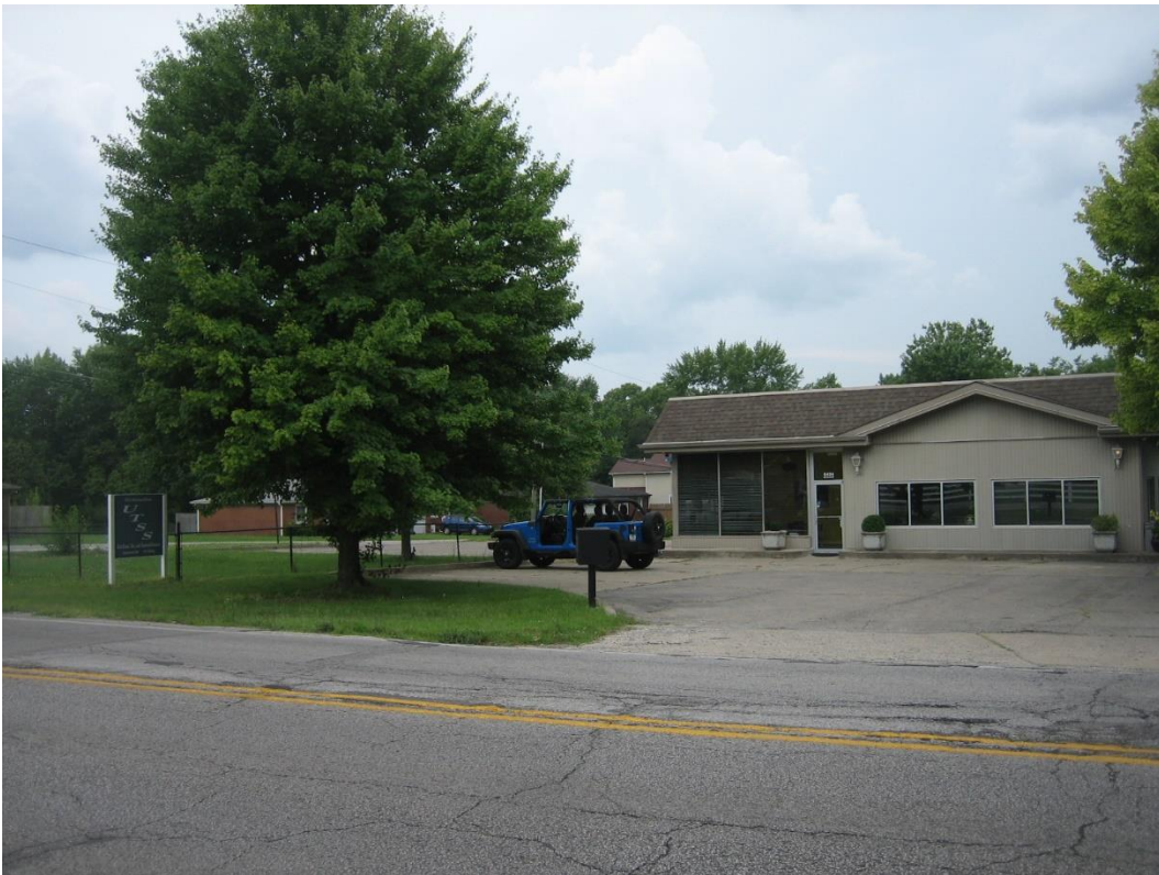
Photo of adjacent property to the south, looking west.