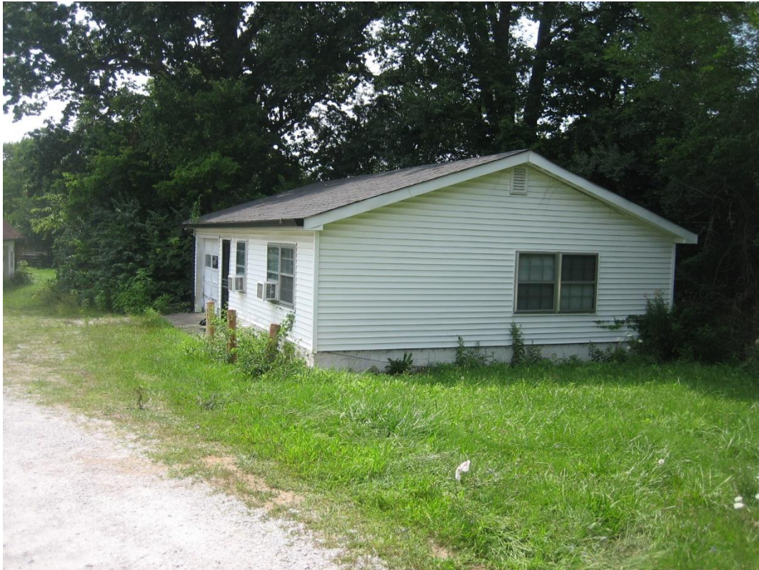
Photo of subejct site parcel two garage/Accessory dwelling, looking west.