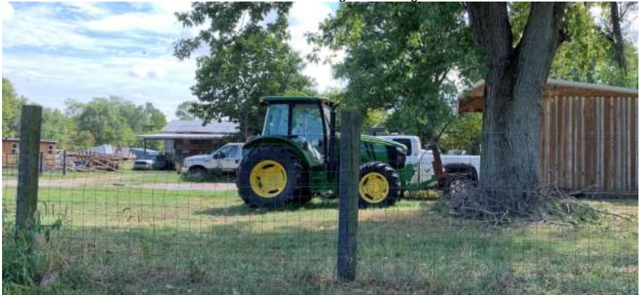
Site viewed from Newhart Street, looking south