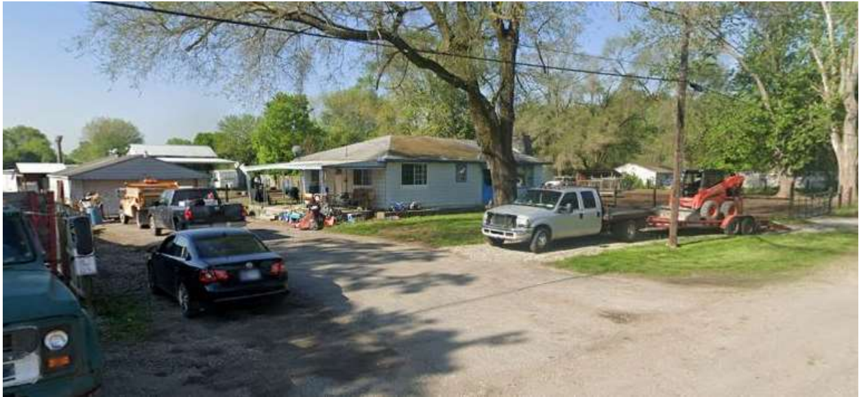
Subject site driveway Google Street View May 2019