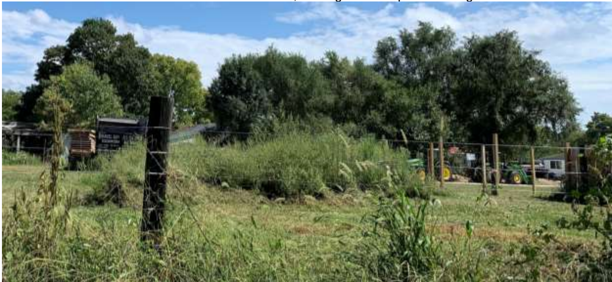
Site viewed from Sandhurst Drive, looking east. Proposed storage area.