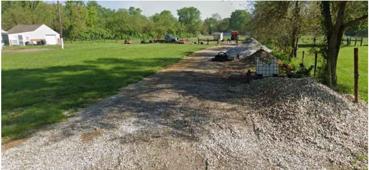
Site viewed from Newhart Street looking north Google Street View 2019