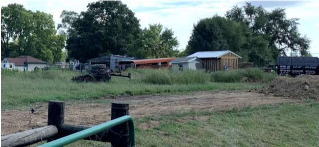
Site viewed from Sandhurst Drive, looking east. Proposed storage area.