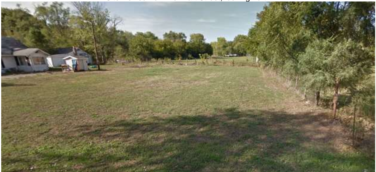
Site viewed from Newhart Street looking north Google Street View 2011