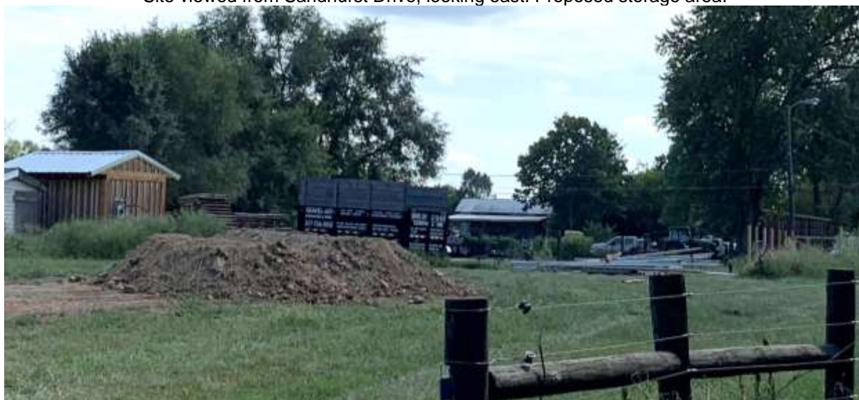
Site viewed from Sandhurst Drive, looking east. Proposed Storage Area