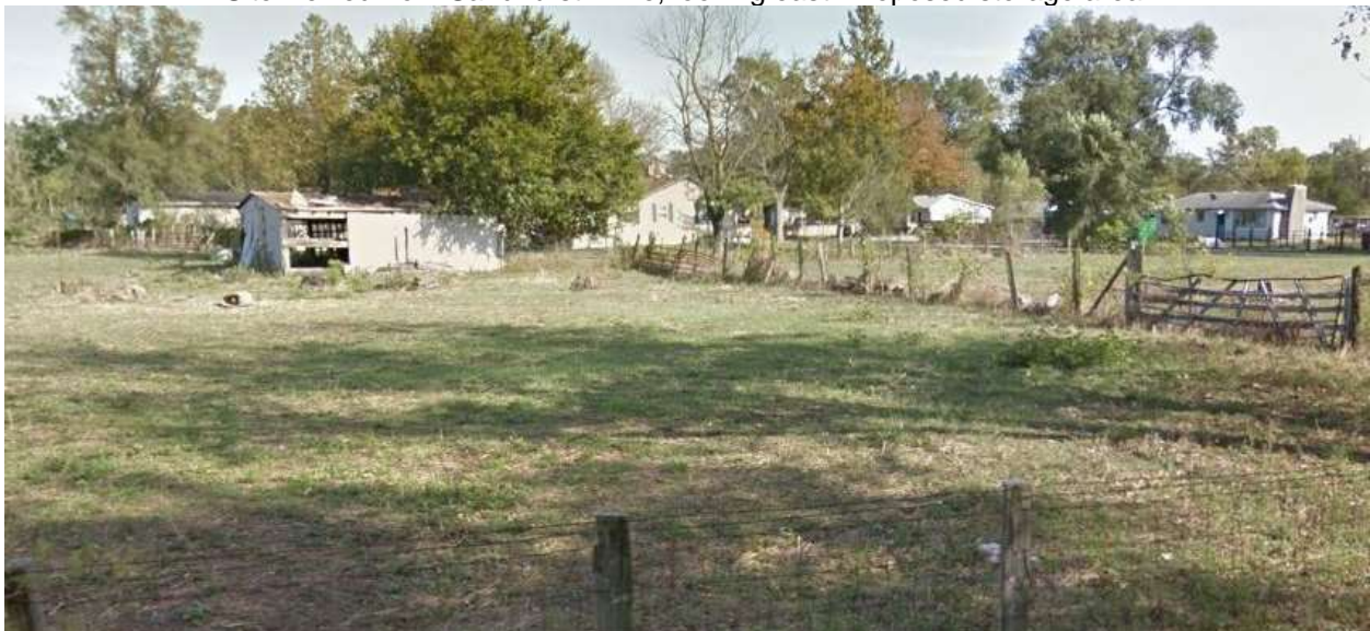
Site viewed from Sandhurst Drive, looking east, Google Street View from 2011