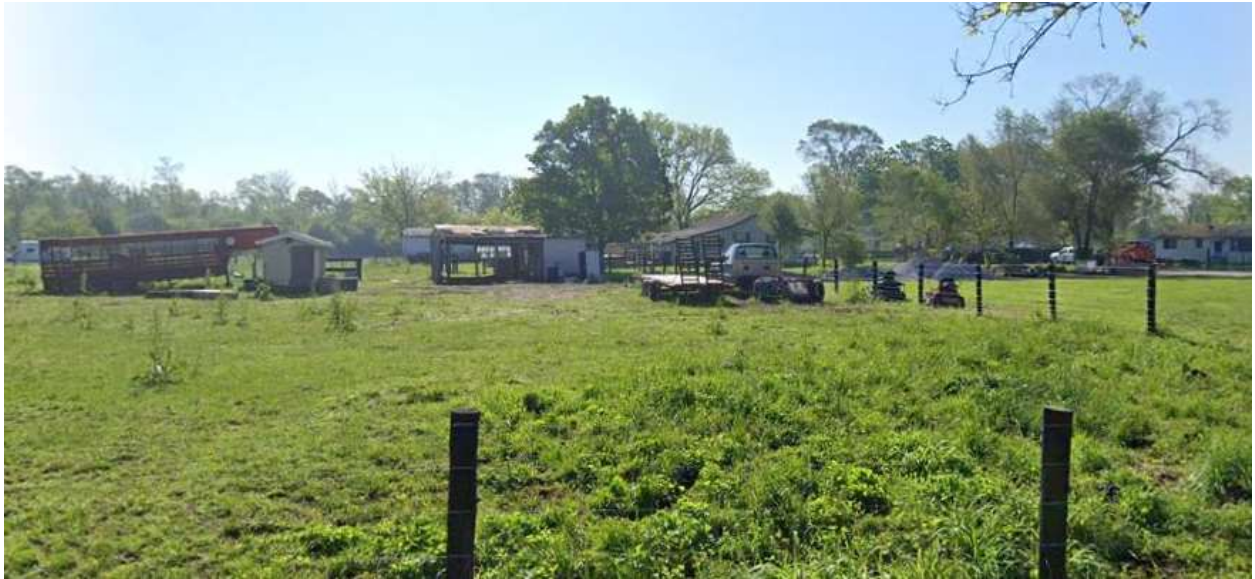
Site viewed from Sandhurst Drive, looking east