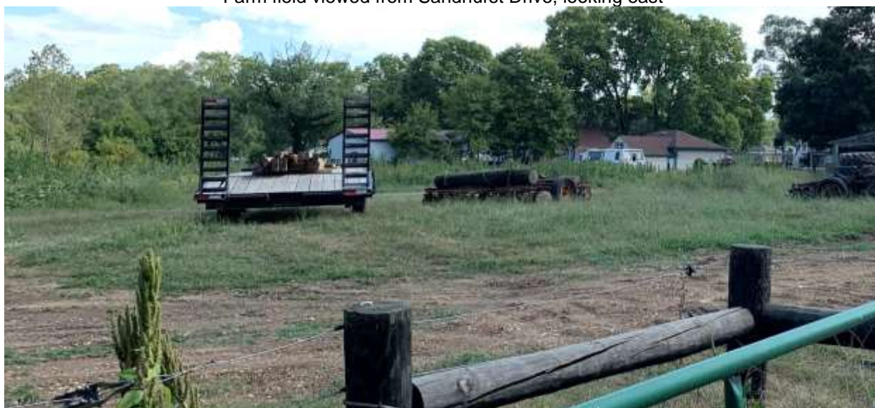
Site viewed from Sandhurst Drive, looking east. Proposed storage area.