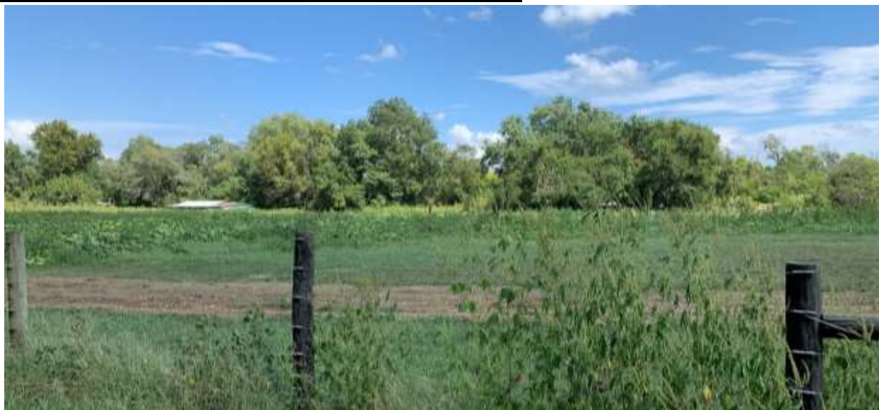
Farm field viewed from Sandhurst Drive, looking east