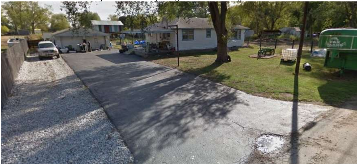
Subject site driveway Google Street View September 2011