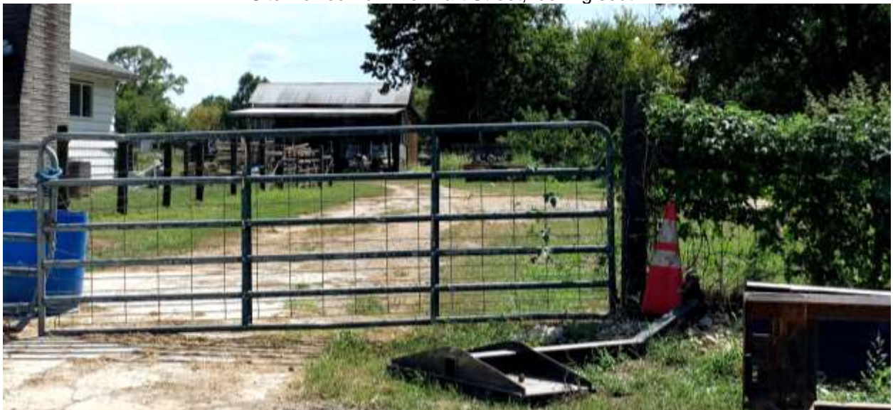
Site viewed from Newhart Street, looking south