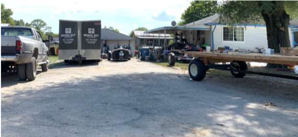
Site viewed from Newhart Street, looking south. Driveway trailer storage