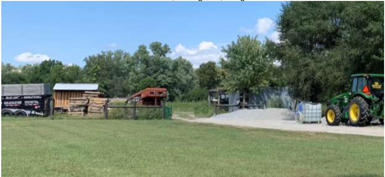
Site viewed from Newhart Street, looking north