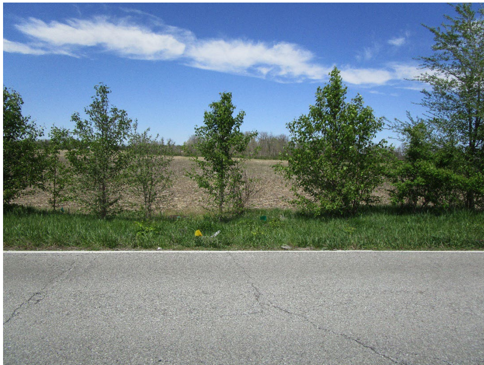
View of site looking north across Pentecost Road