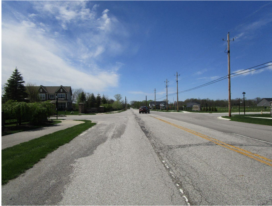
View looking west along Pentecost Road