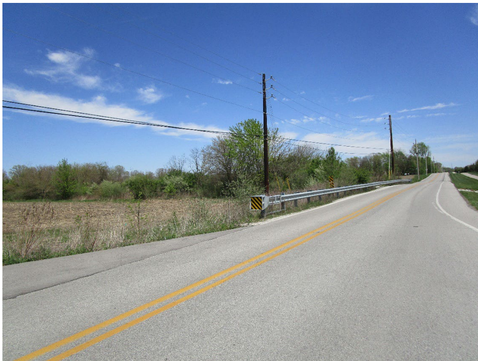
View of site looking northeast across Pentecost Road