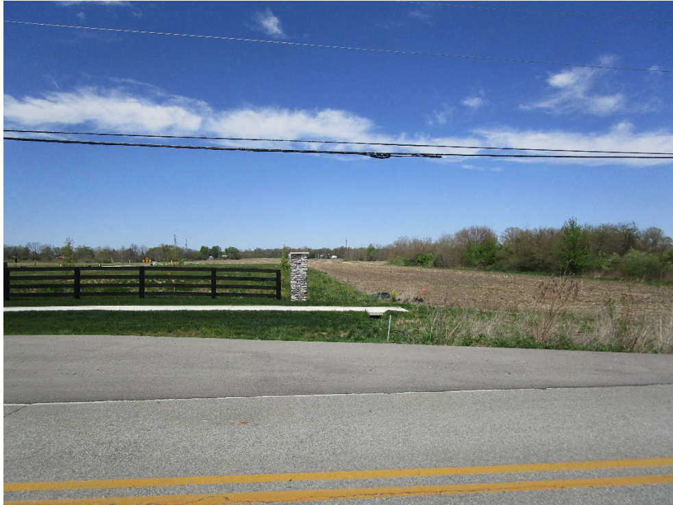
View of western boundary of site looking north across Pentecost Road