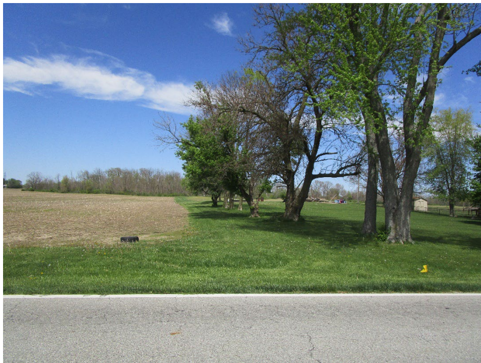
View of site looking north across Pentecost Road