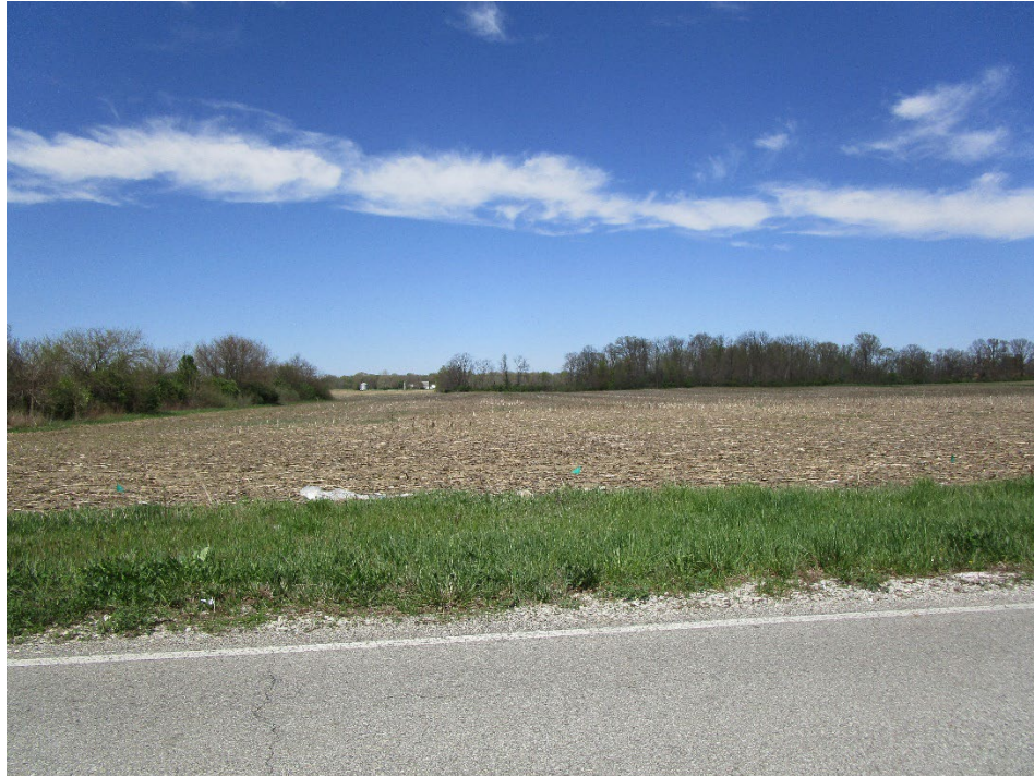
View of site looking north across Pentecost Road