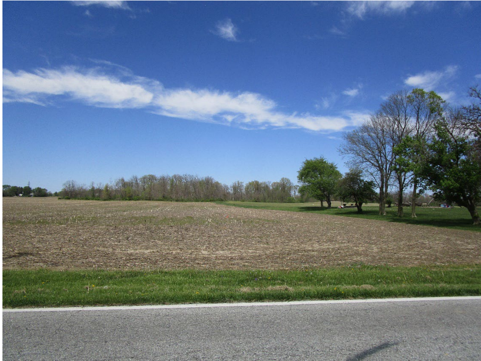
View of site looking north across Pentecost Road