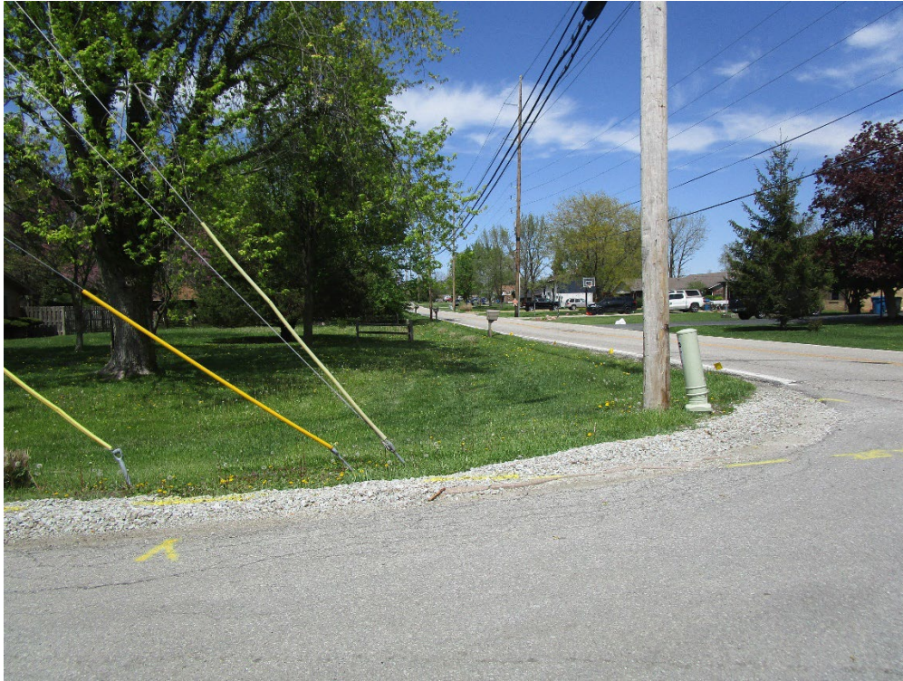
View looking northeast across intersection of Pentecost Road and Senour Road