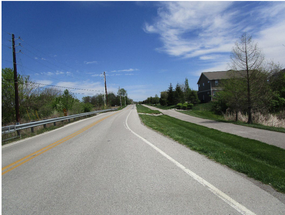
View looking east along Pentecost Road