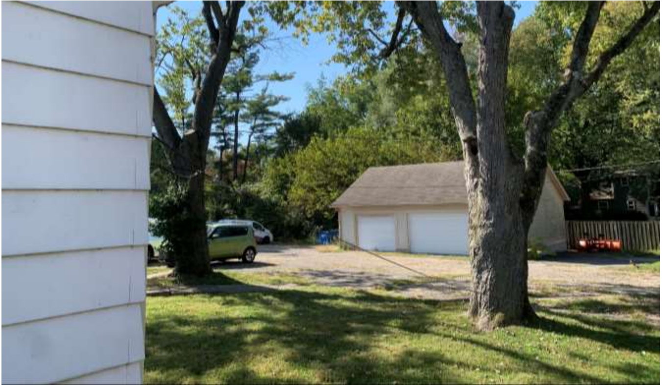
Photo of the rear yard of the subject site looking west.