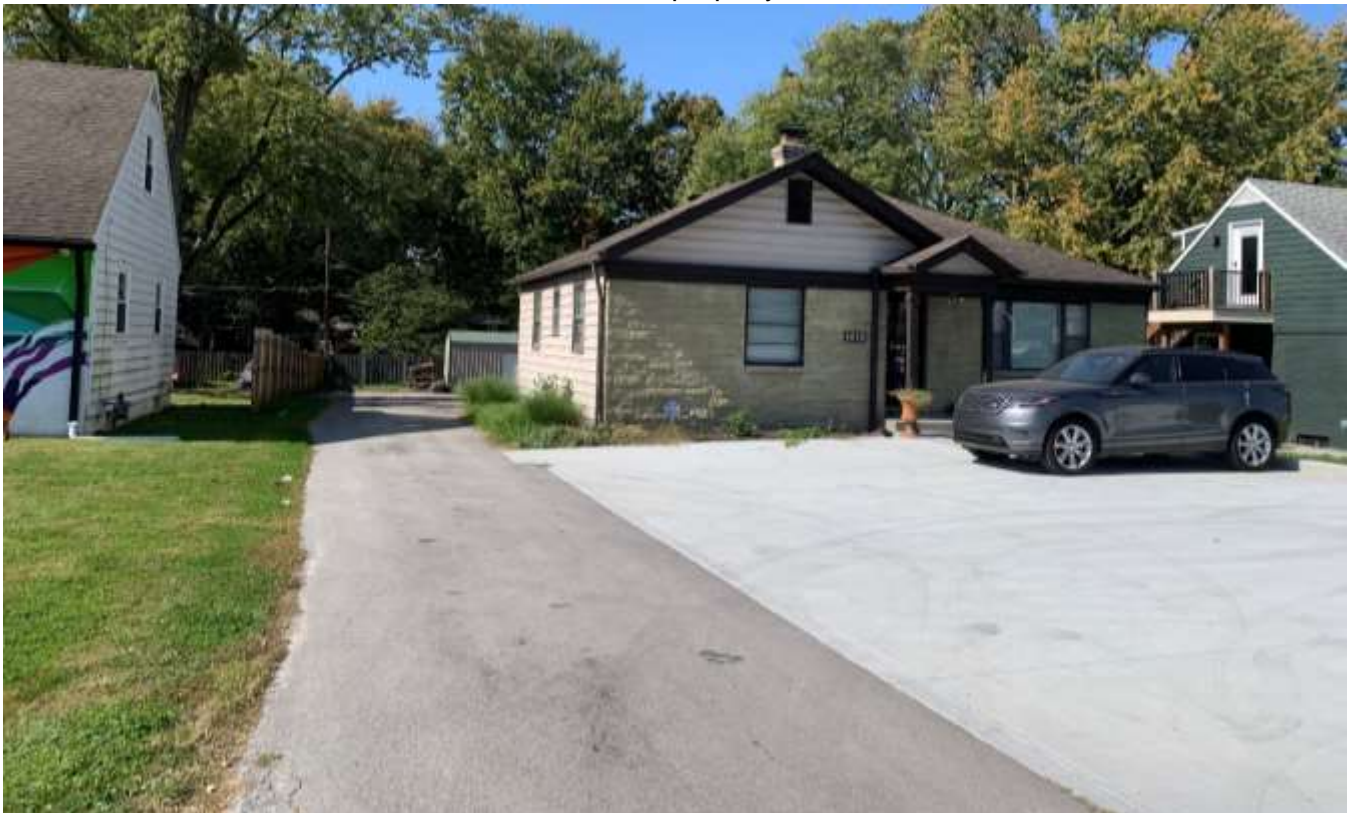
Photo of the residential property north of the site.