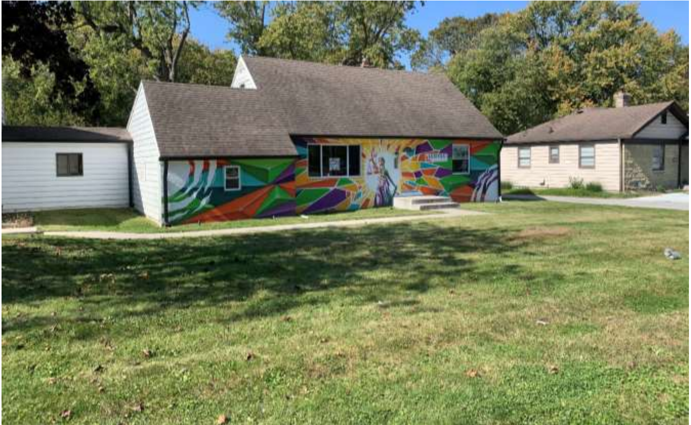
Photo of the subject site looking west onto the site.