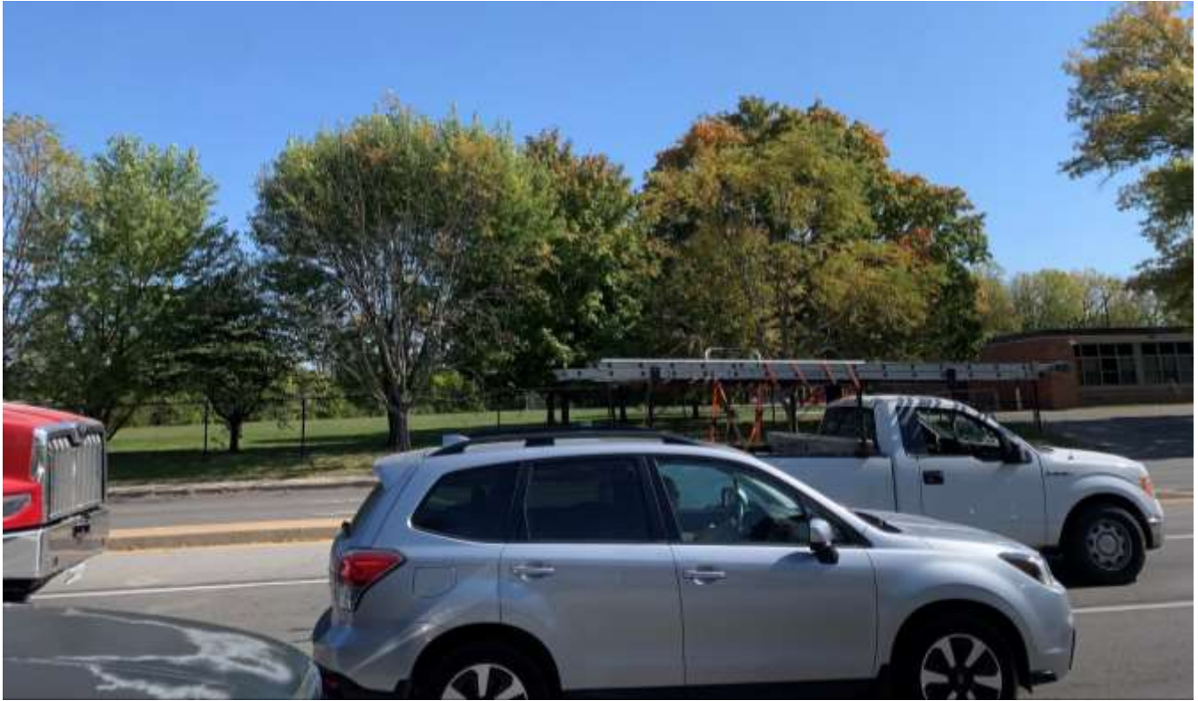
Photo of the school across Keystone Avenue to the east.