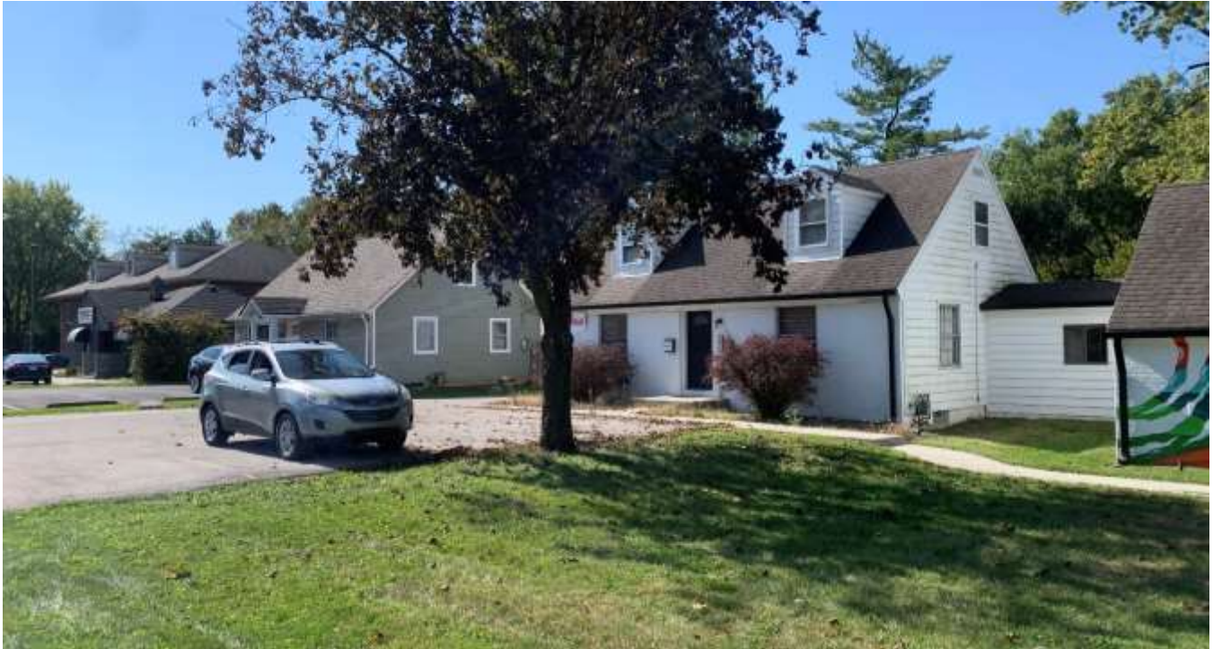
Photo of the commercial property south of the site.