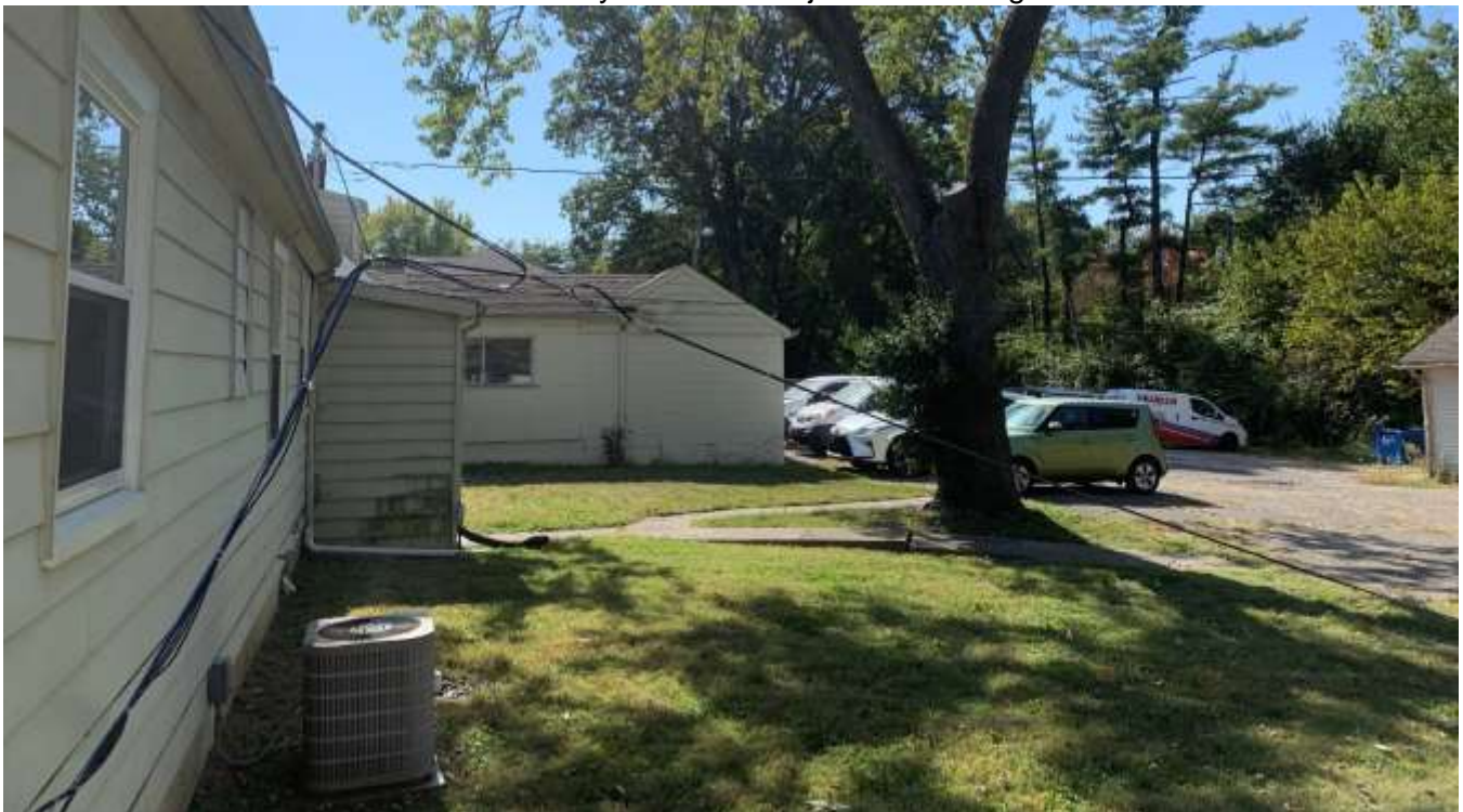
Photo of the rear yard of the subject site looking south.