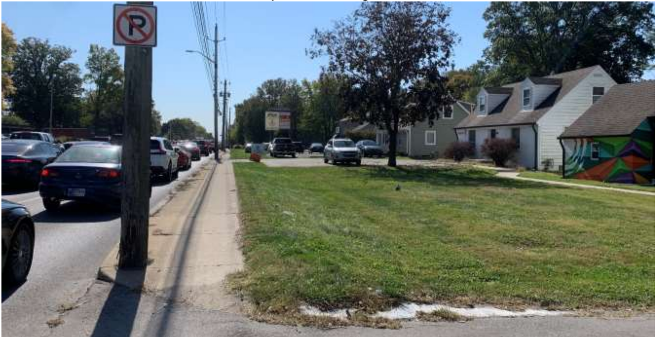
Photo of the site's street frontage along Kessler Avenue looking south.