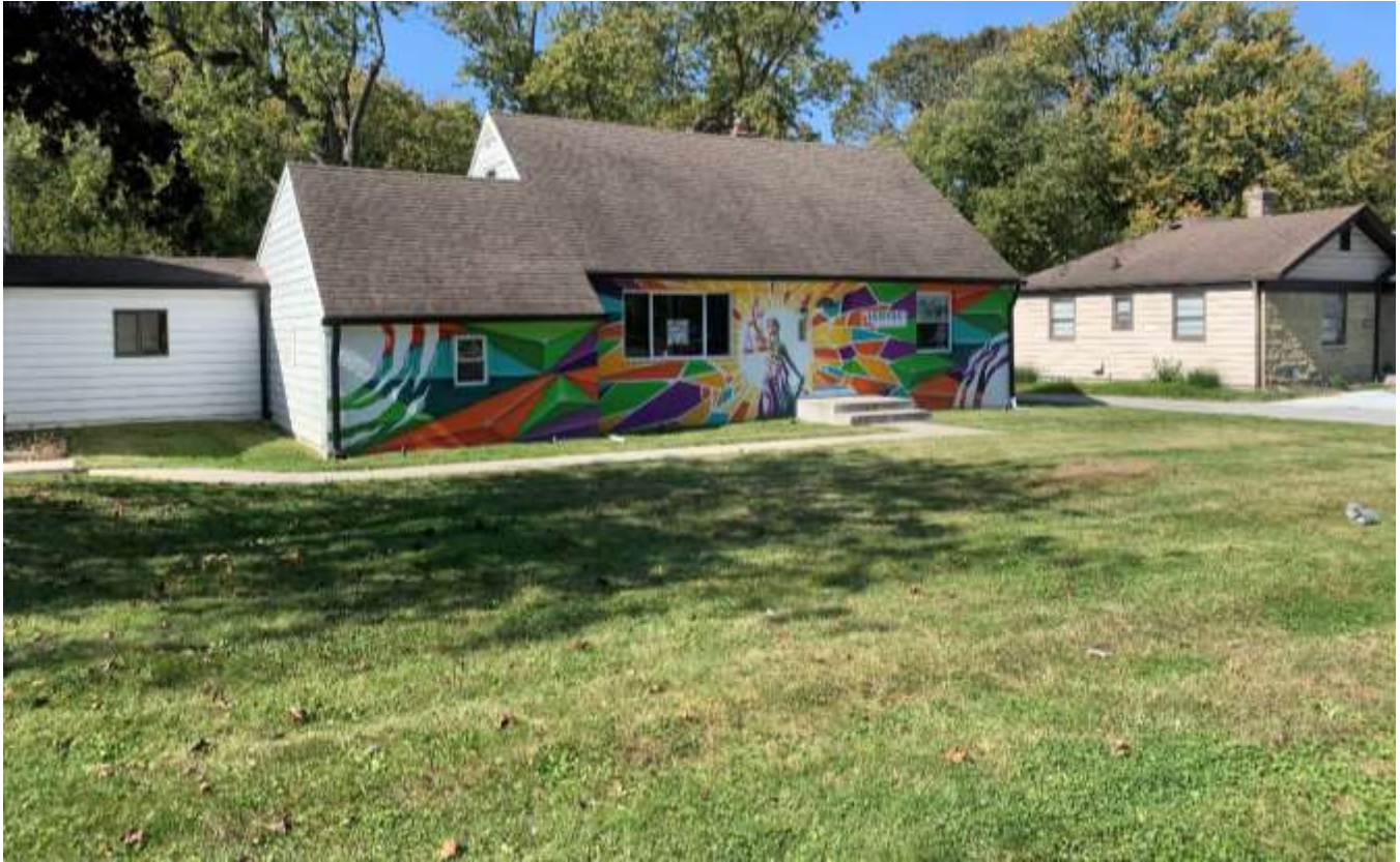
Photo of the subject site looking west onto the site.