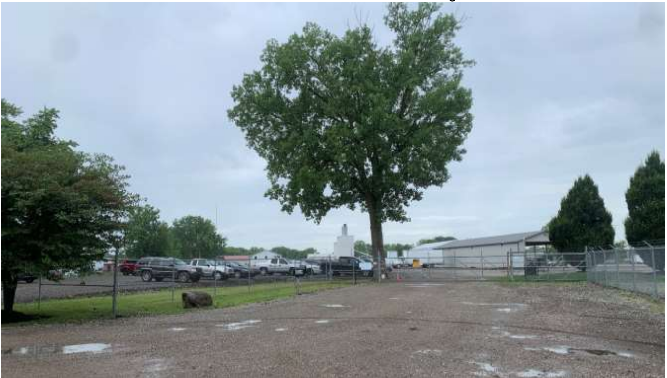
Photo of the concrete contractor business to the west.