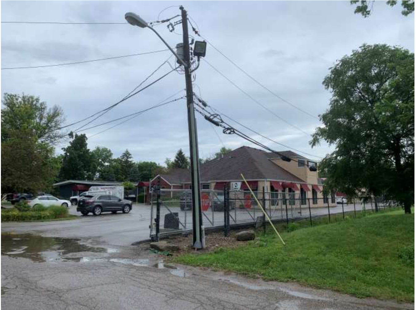
Photo of the drywall contractor business to the north.