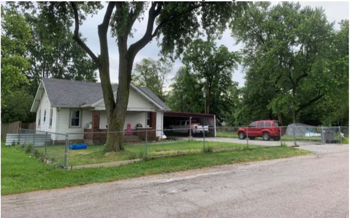
Photo of a single-family dwelling south of the site.