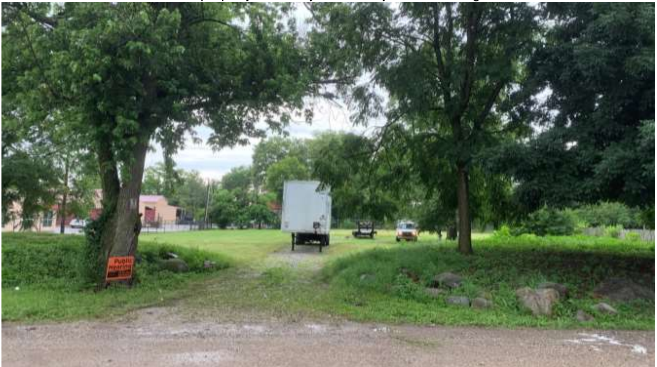
Photo of the subject site looking east.