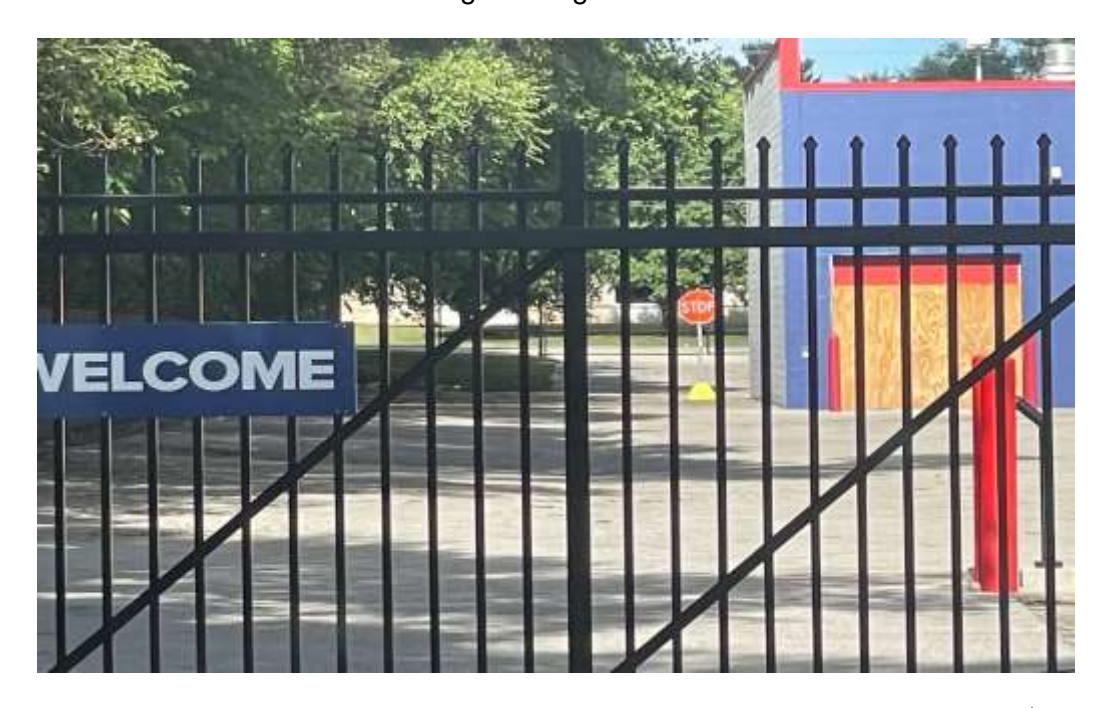
Photo Six: Existing Fence Within Front Yard of East Street in Background