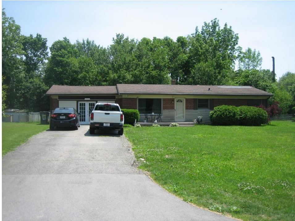
Subject site single family dwelling, looking south