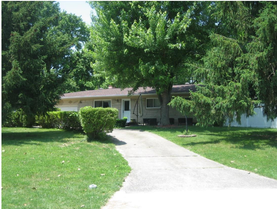
Adjacent single family dwelling to the north.