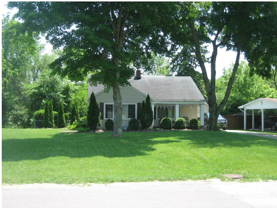
Adjacent single family dwelling to the west, looking south.