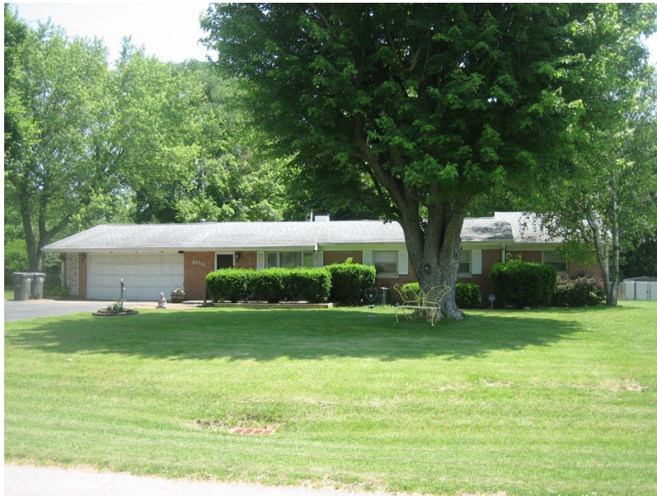
Adjacent single family dwellings to the east, looking south.