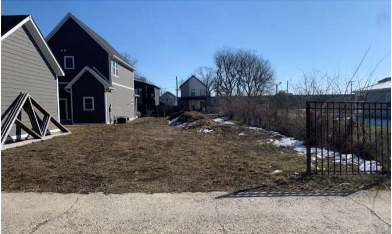
Photo of the subject site looking east from the alley.