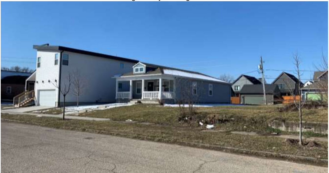
Photo of the single-family dwellings south of the site.