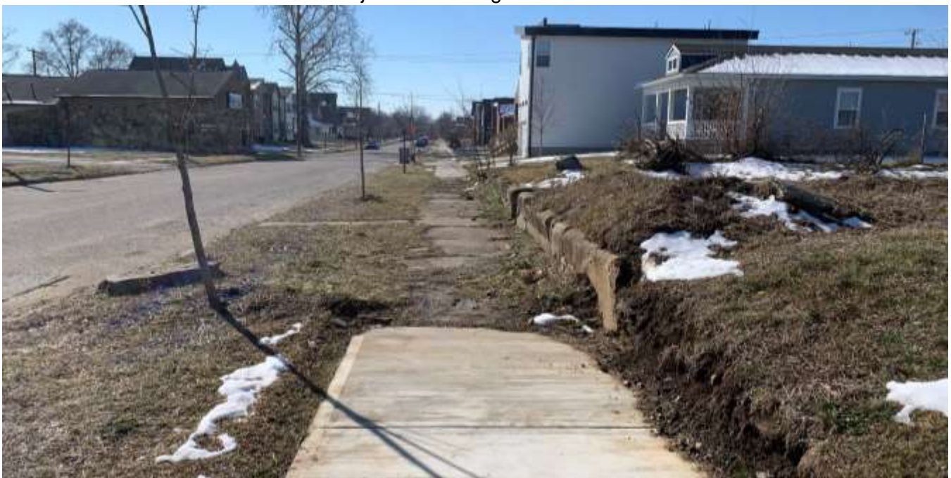
Photo of the sidewalk that would need to be repaired.