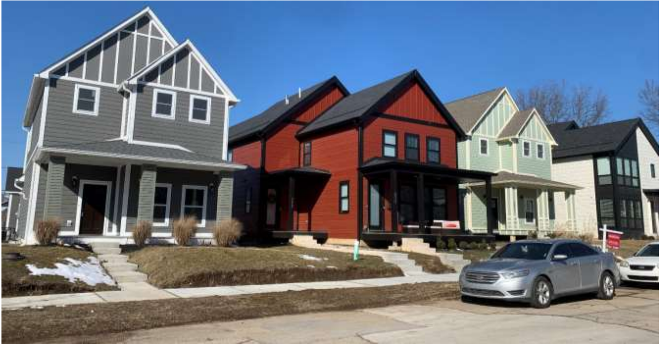
Photo of the single-family dwellings north of the site.