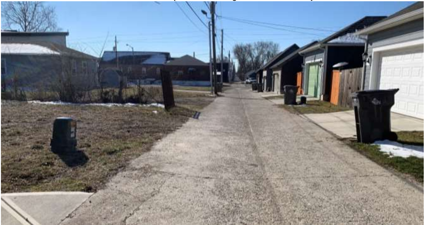
Photo looking south on the alley west of the site.