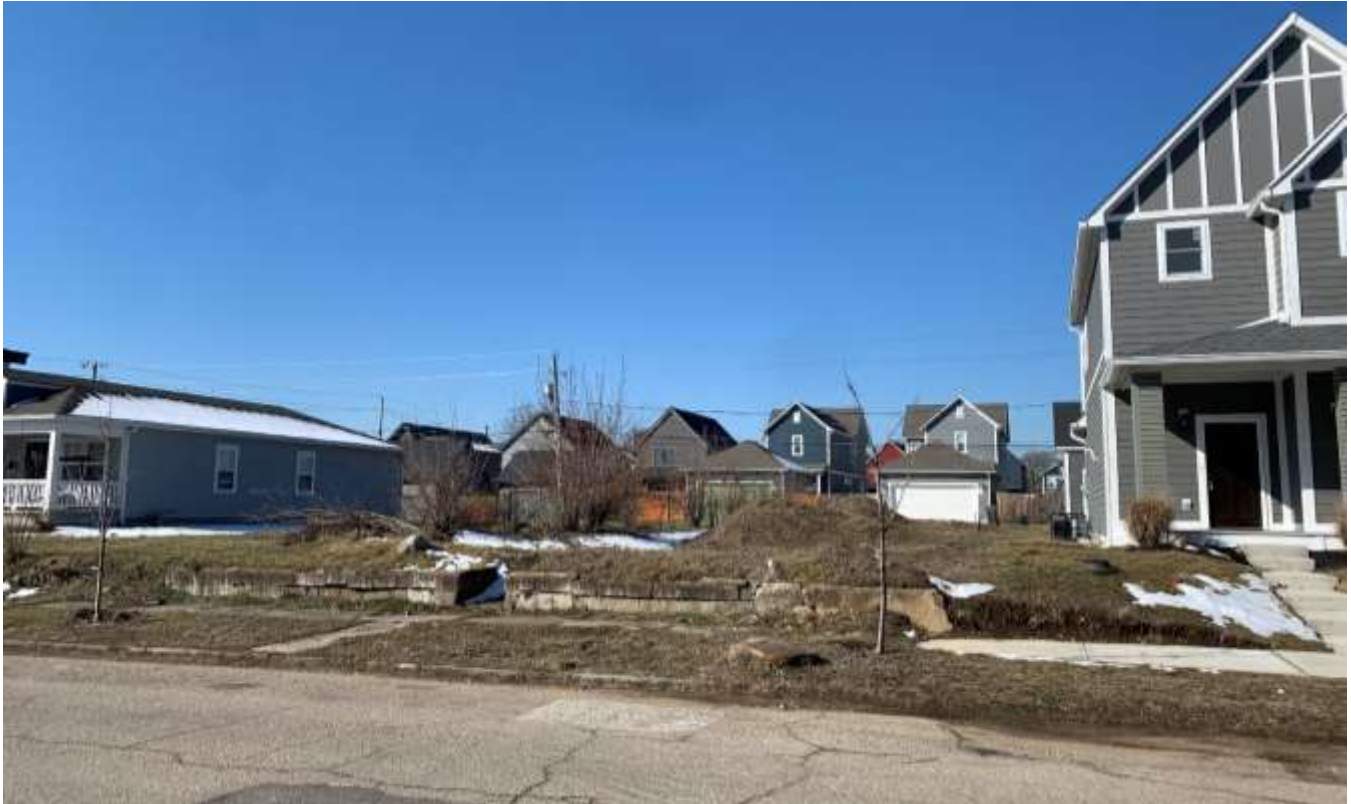
Photo of the subject site looking west from Yandes Street.