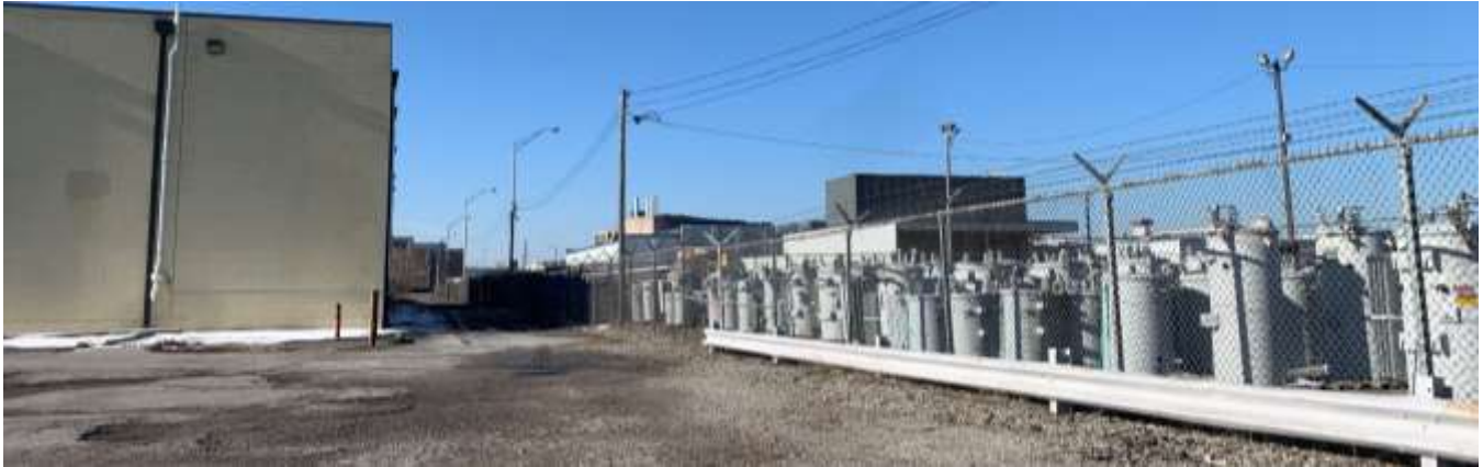
Photo of the industrial property north of the subject site.