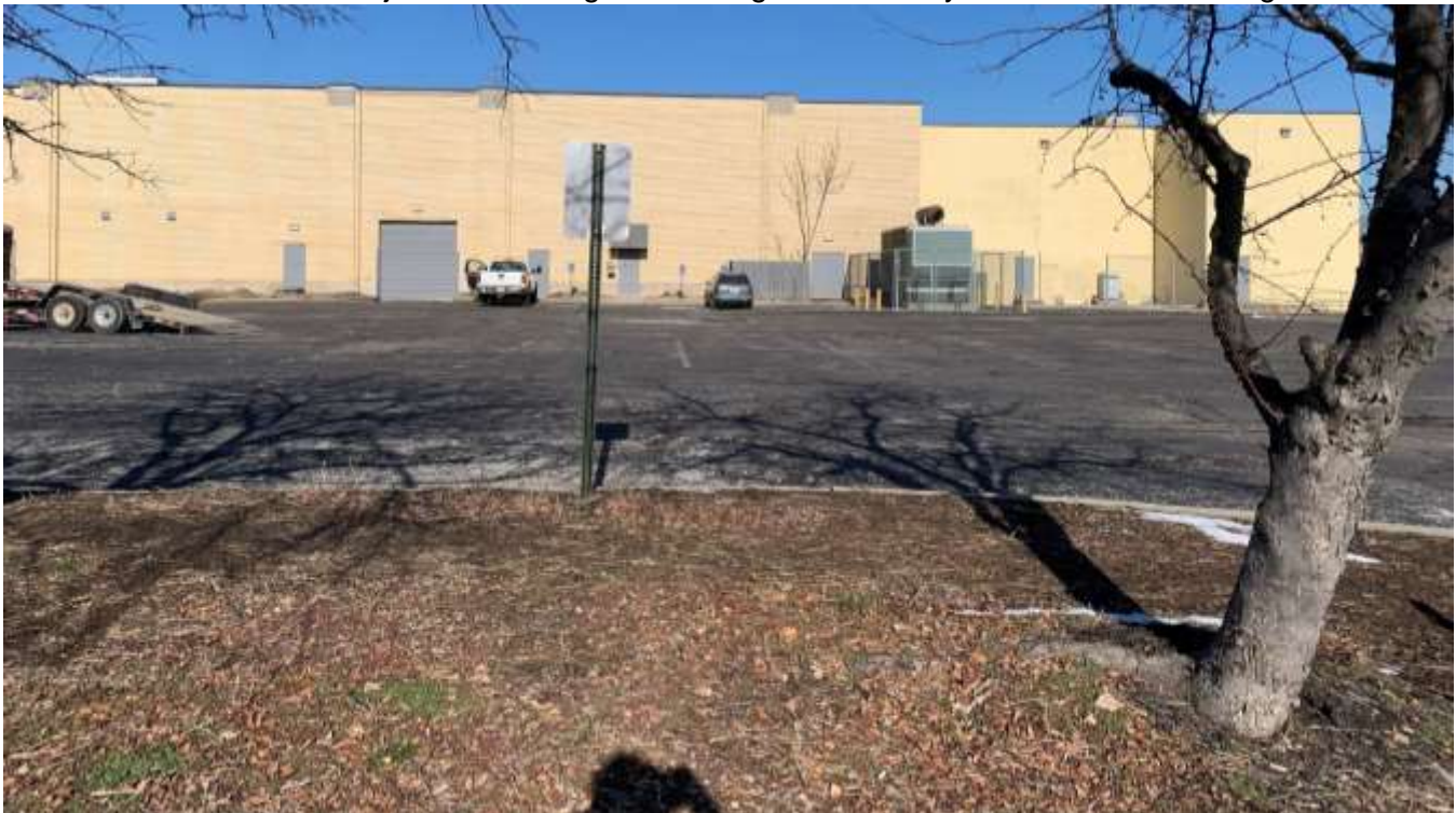
Photo of the subject site looking west at the existing building.