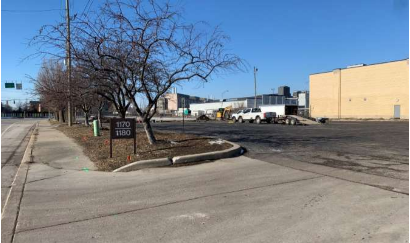
Photo of the subject site looking south along the Kentucky Avenue street frontage.