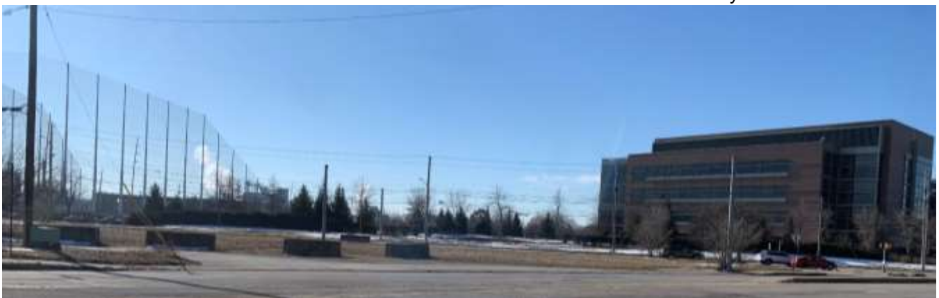
Photo of the undeveloped lot southeast of the site.