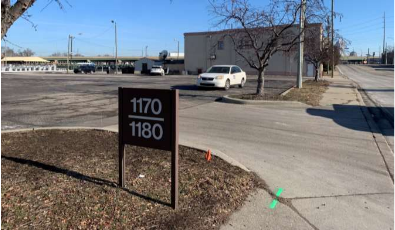
Photo of the subject site looking north along the Kentucky Avenue Street frontage.