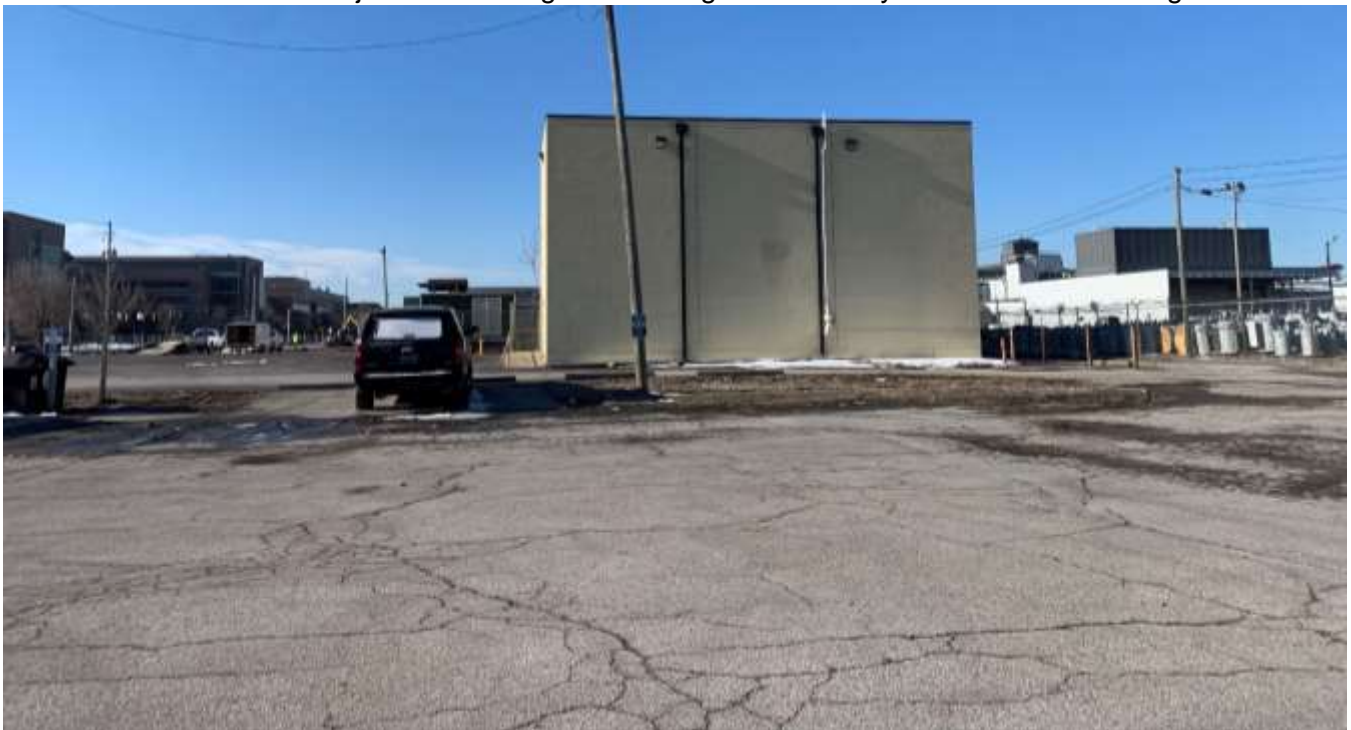
Photo of the existing building looking south from the property to the north.