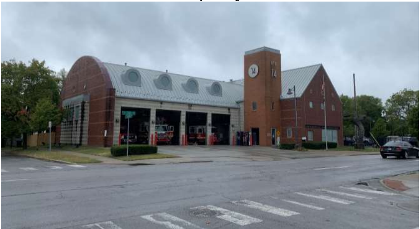
Photo of the fire station south of the site.