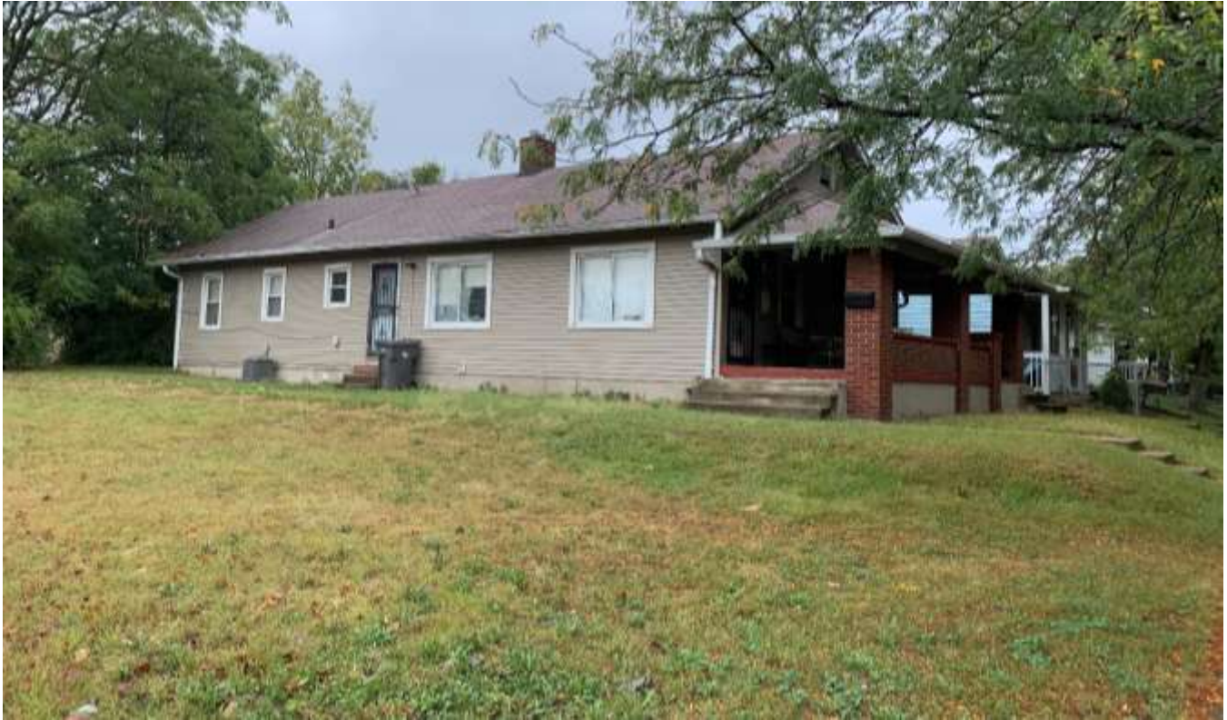
Photo of the two-family dwelling north of the site.