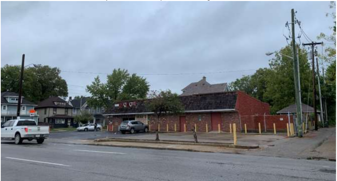
Photo of the liquor store west of the site.