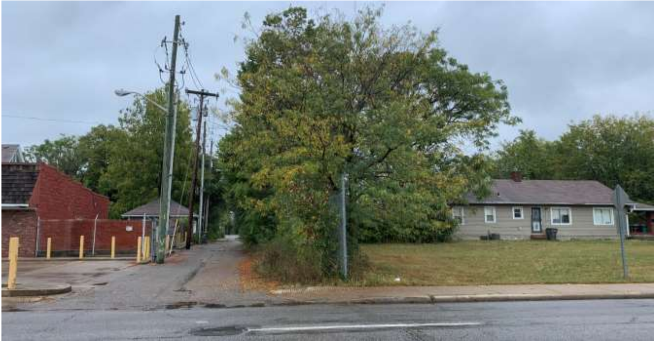
Photo of the alley west of the subject site looking north from 30 th Street.