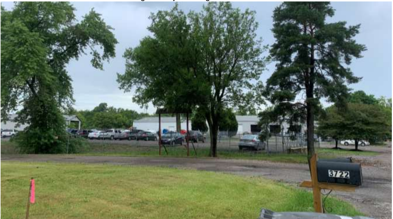
Photo of the concrete contractor business looking north.