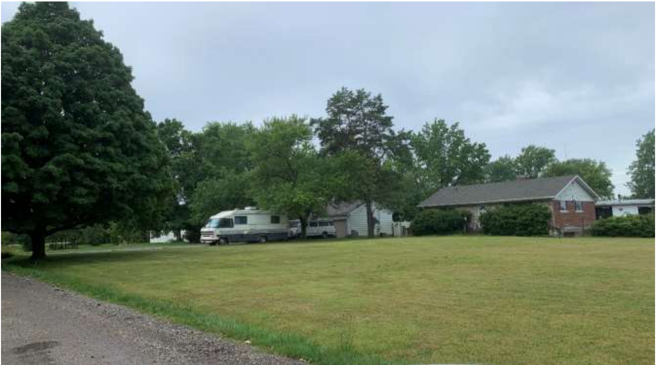
Photo of single-family dwellings southwest of the site.