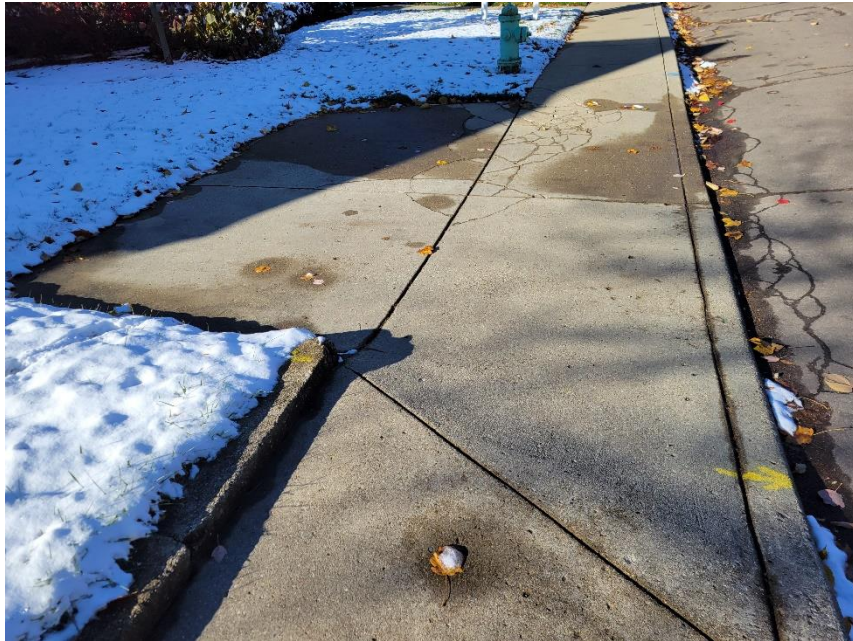
Photo 5: Existing Paving and Curb Cut to East of Alley along New Jersey