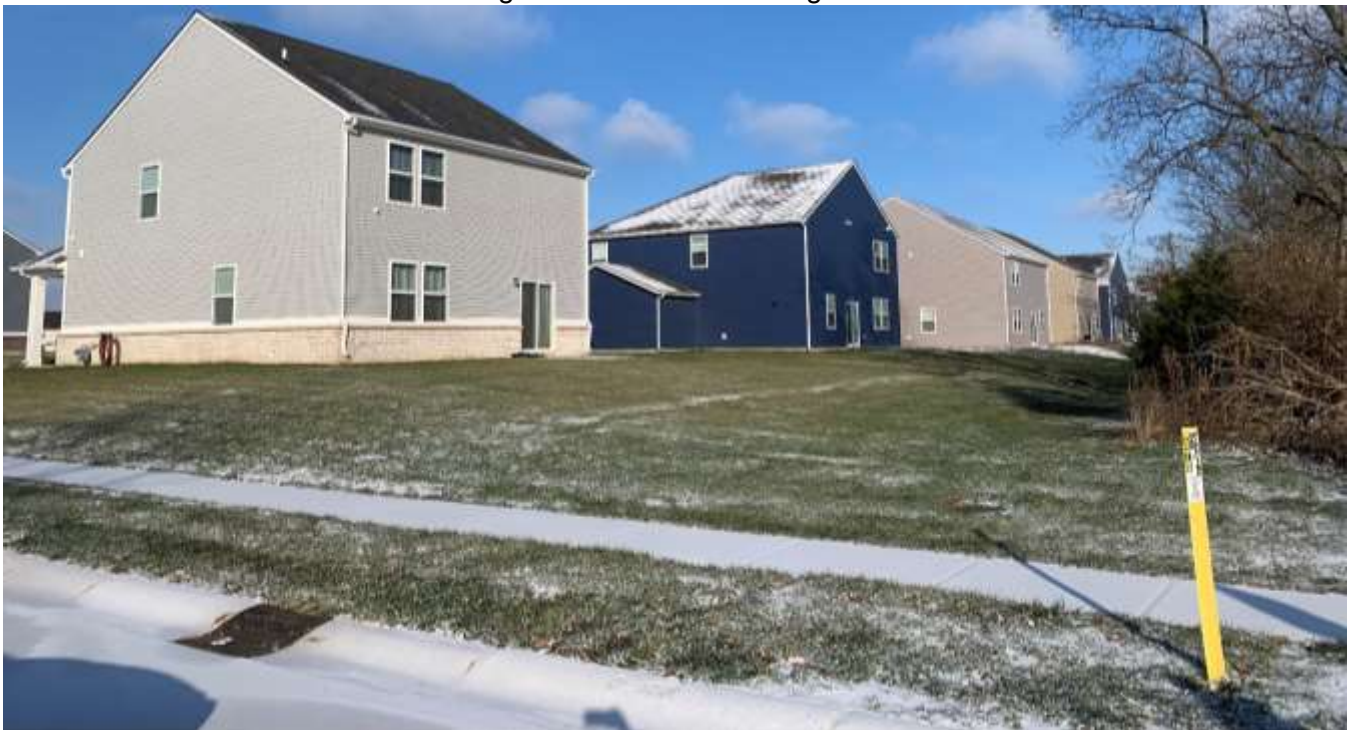
Single family dwellings west of the site at the Wagman Street stub.