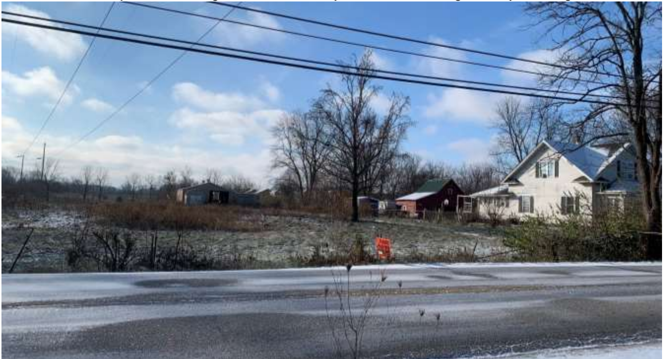
Photo of the subject site looking south from Camby Road and the single-family dwelling to the west.