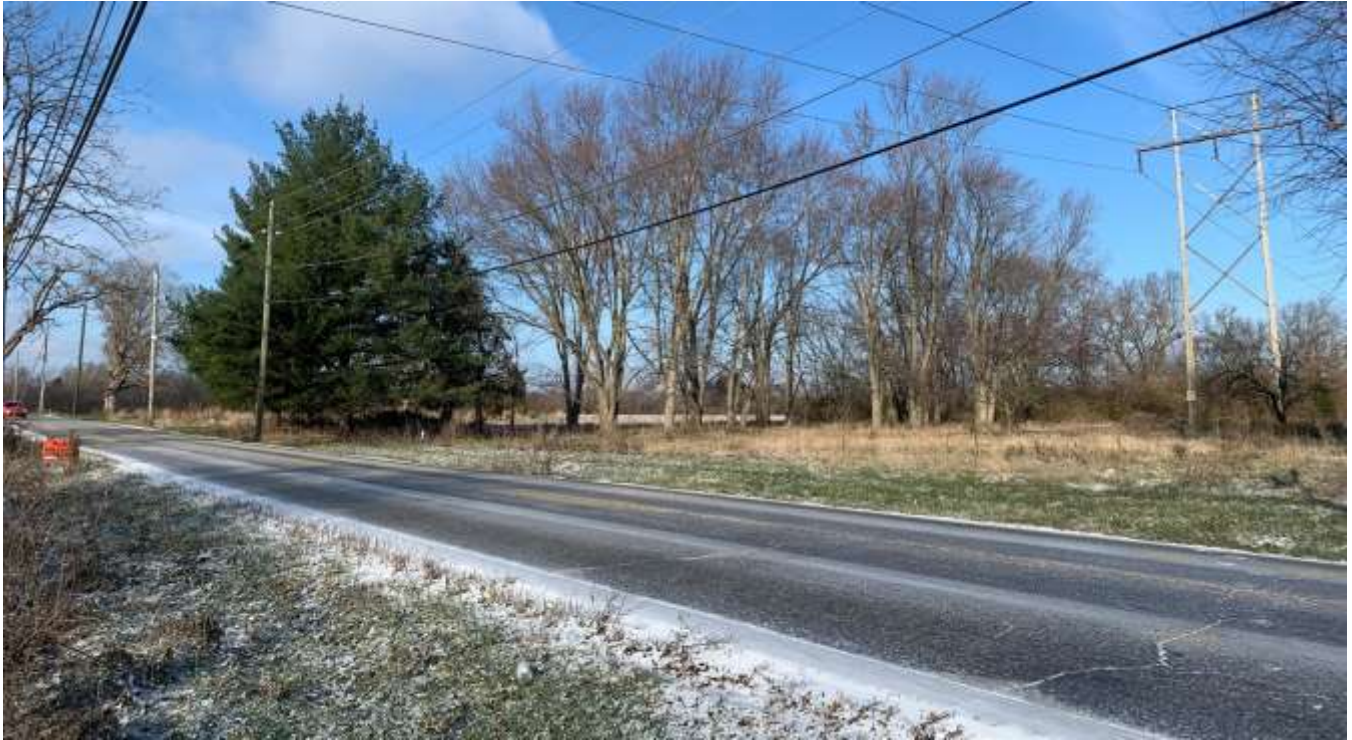
Undeveloped industrial land north of the site.