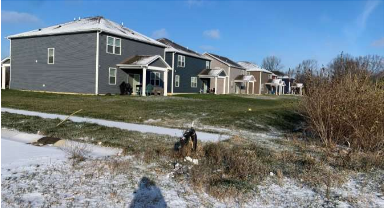
Single family dwellings west of the site at the Red Board Drive stub.