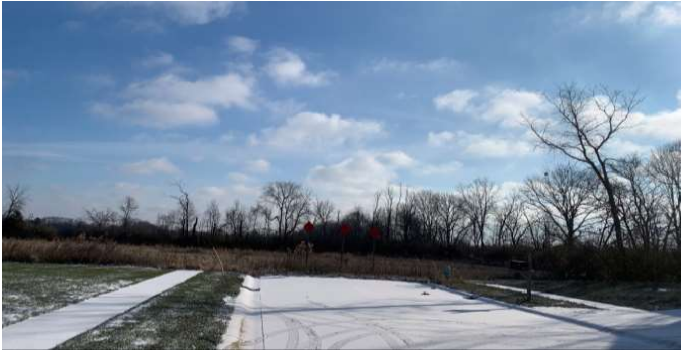
Photo of the Wagman Street stub looking east onto the site.