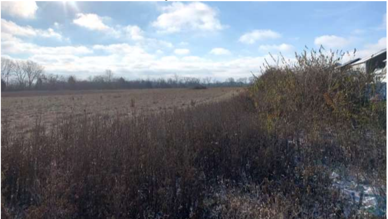
Photo of the site looking north from the Red Board Drive stub.