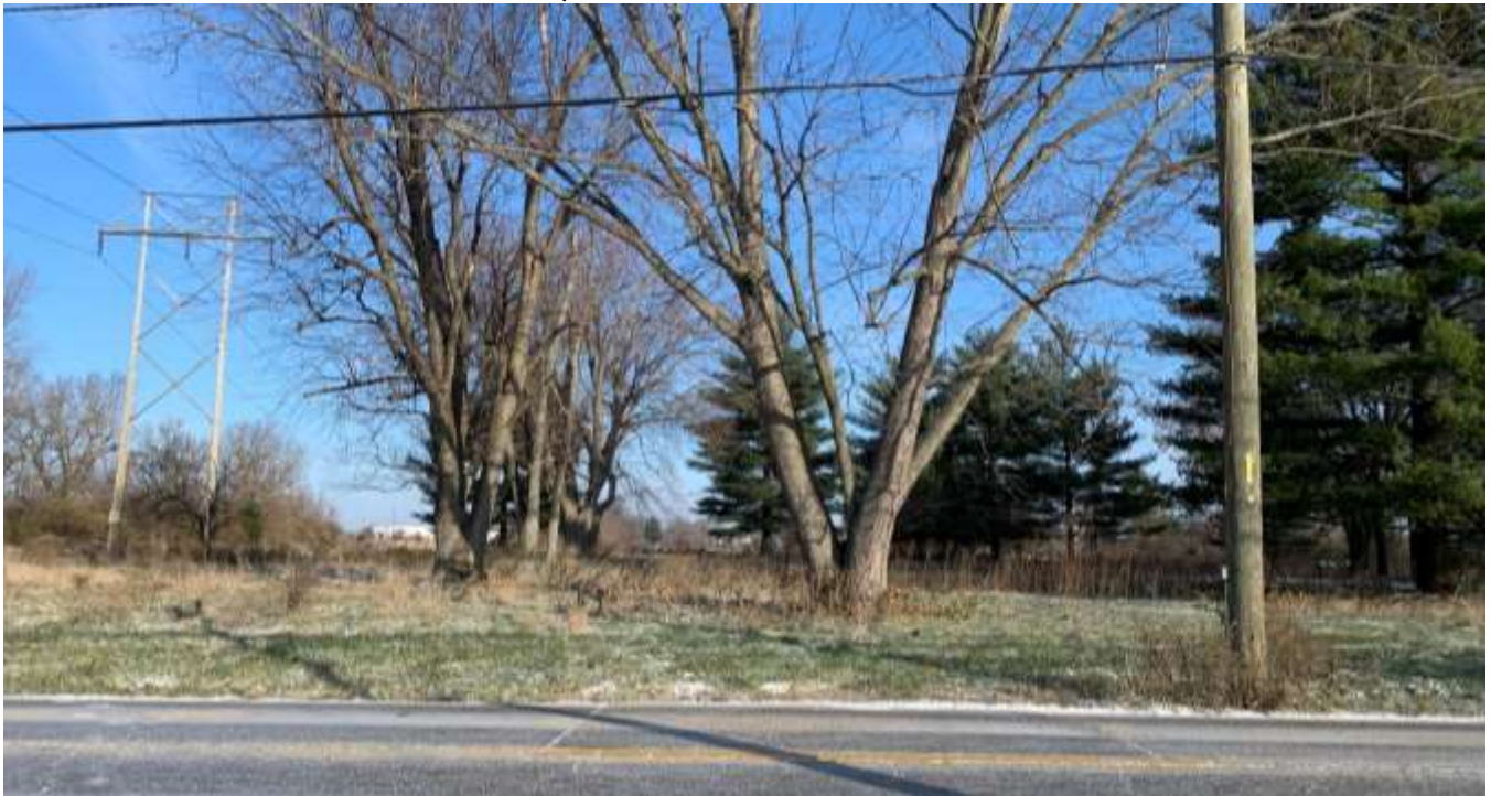
Undeveloped industrial land north of the site.