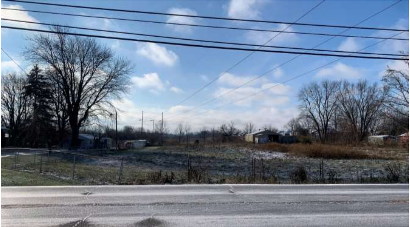
Photo of the subject site looking south from Camby Road and the single-family dwelling to the east.