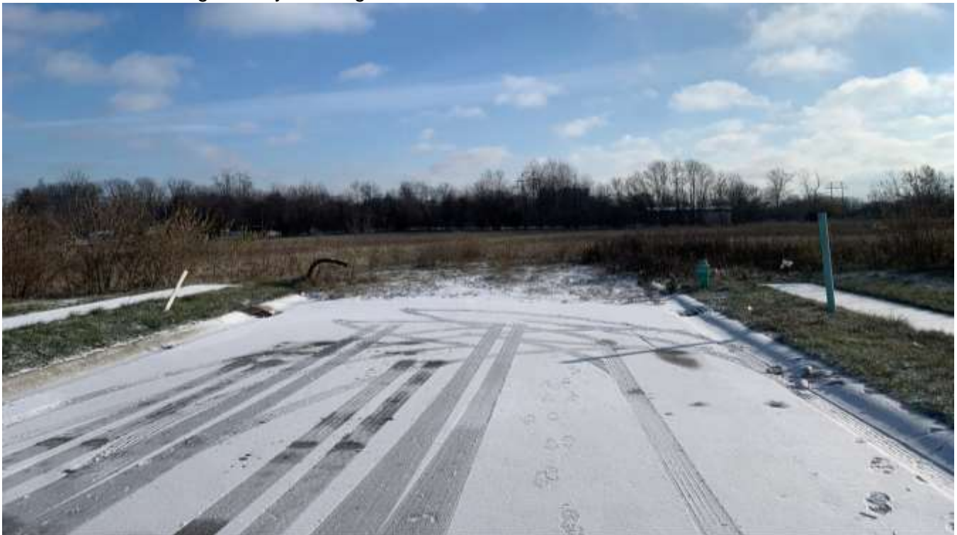
Photo of the Red Board Drive stub looking east onto the site.