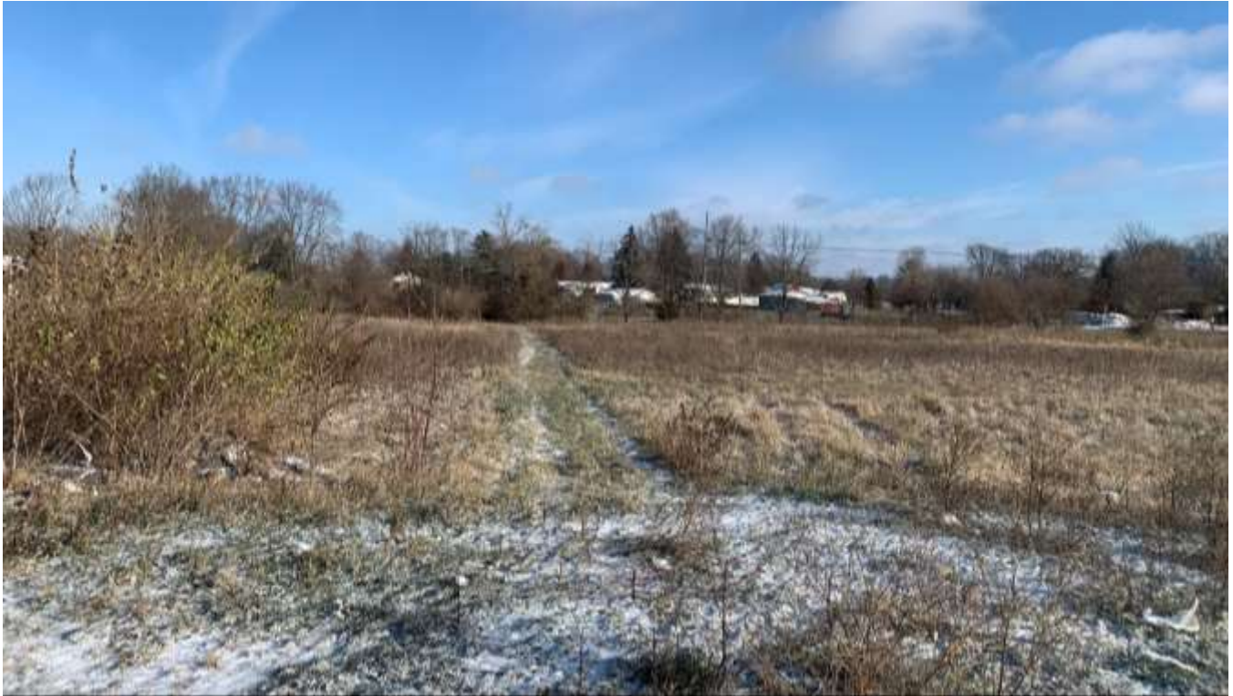
Photo of the site looking north from the Red Board Drive stub.