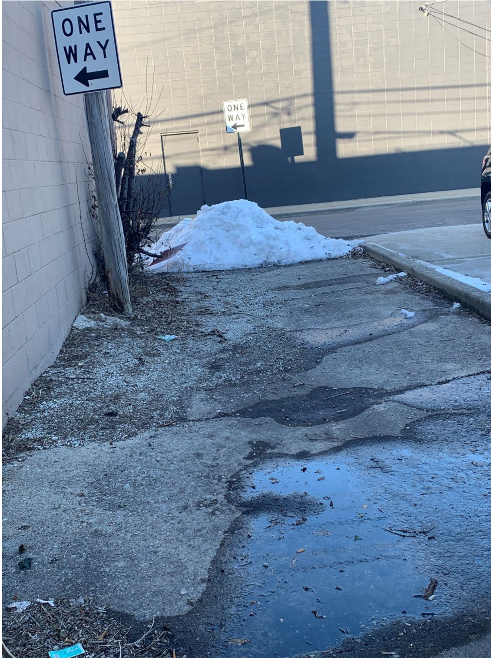
View of the northern portion of the subject alley where it intersects with Park Avenue