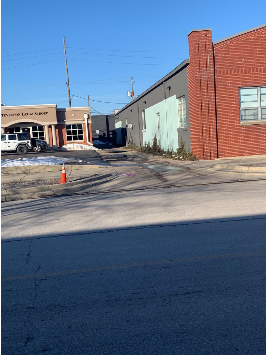
Photo of alley from Market Street, looking north