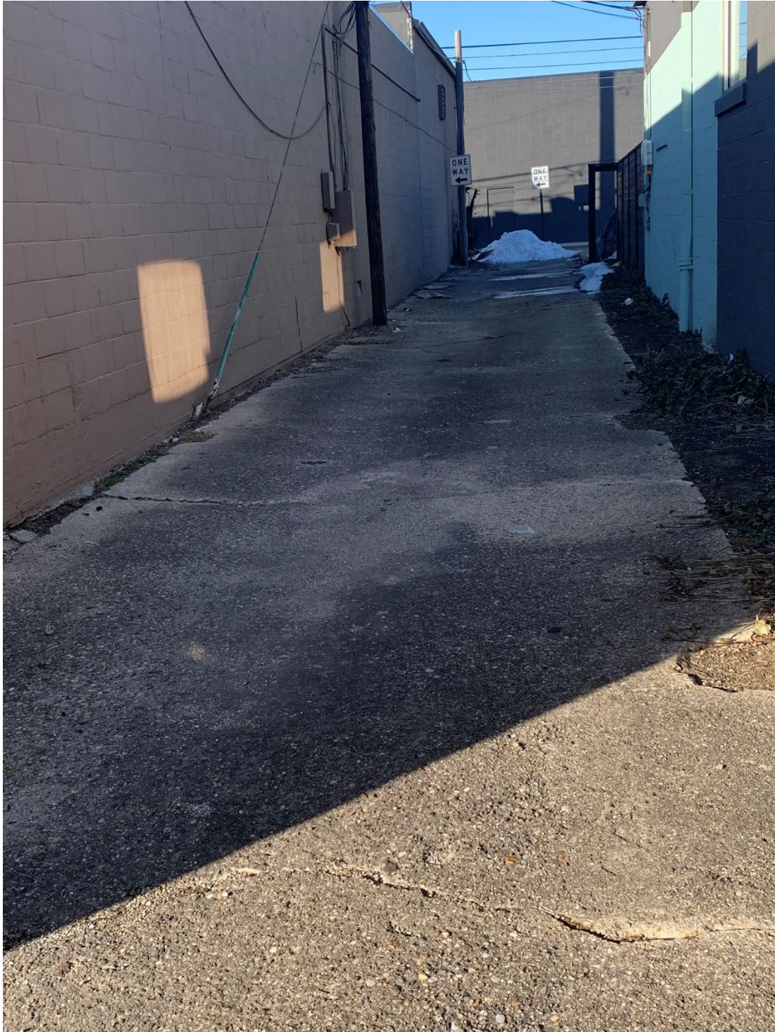
View of the remaining portion of the subject alley