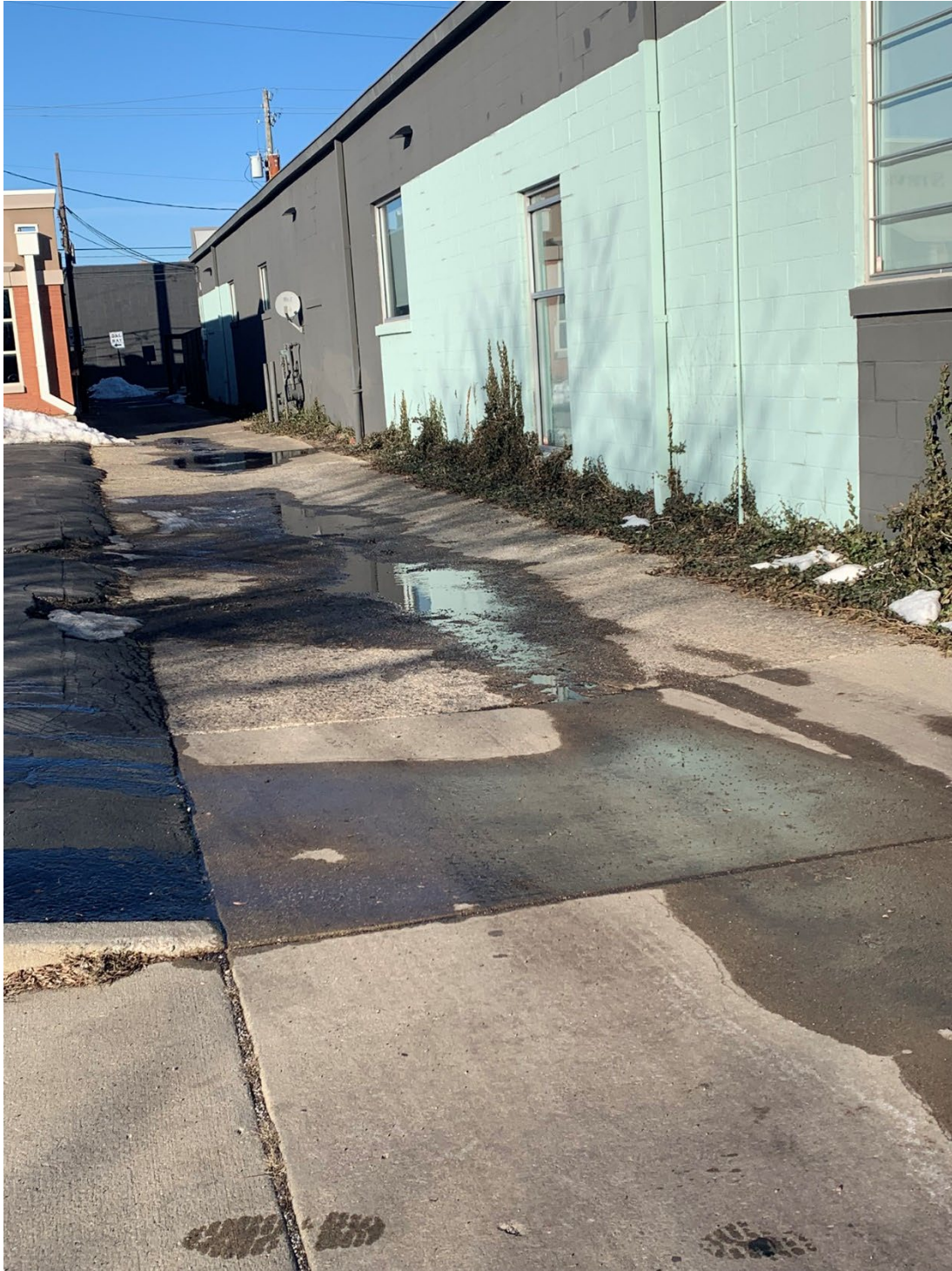
View of the southern portion of the subject alley