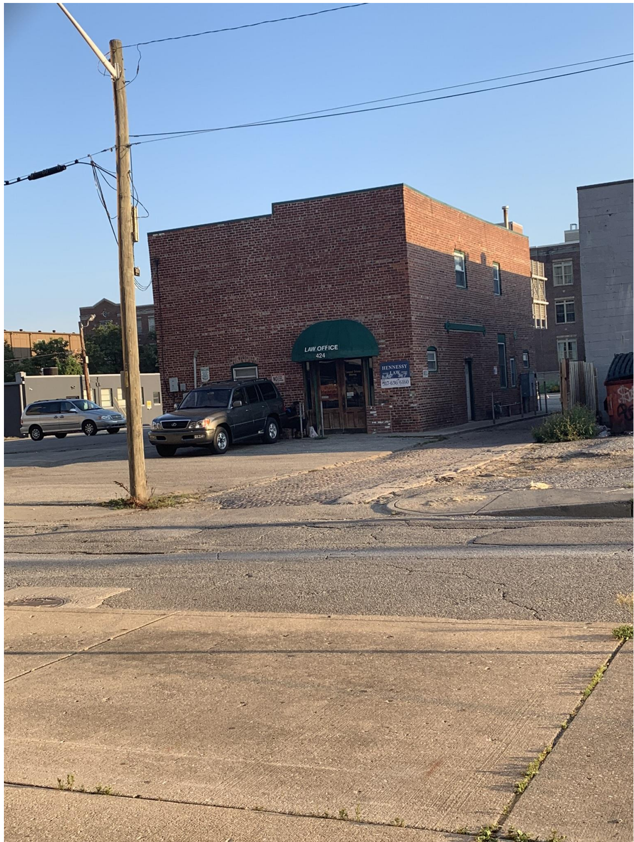
View of existing structure at 419 East Ohio Street and the proposed subject alley 2022-CZN-848 / 2022-CVC-848