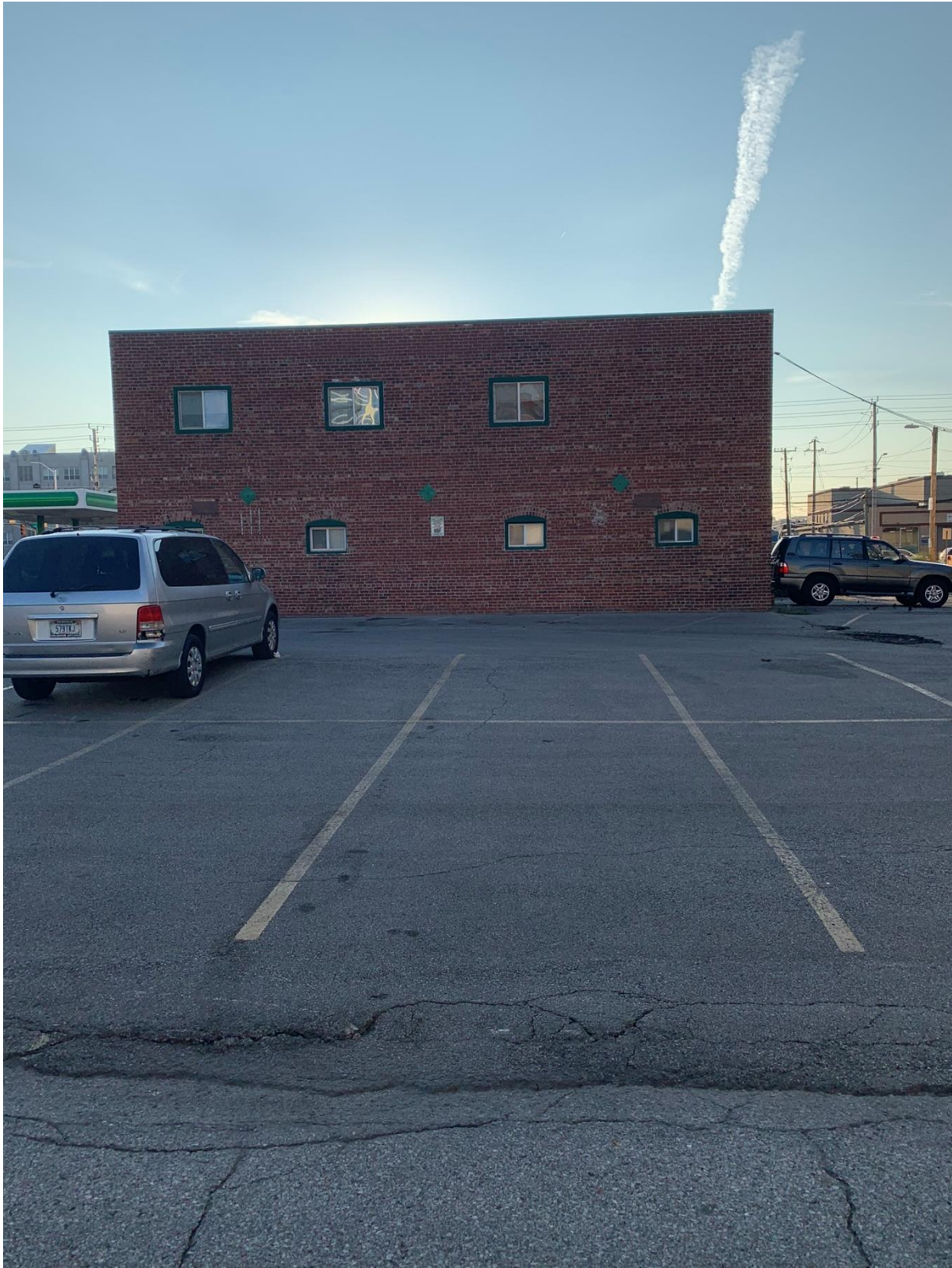
View of existing building at 419 East Ohio Street and surface parking lots, from the west looking east 2022-CZN-848 / 2022-CVC-848