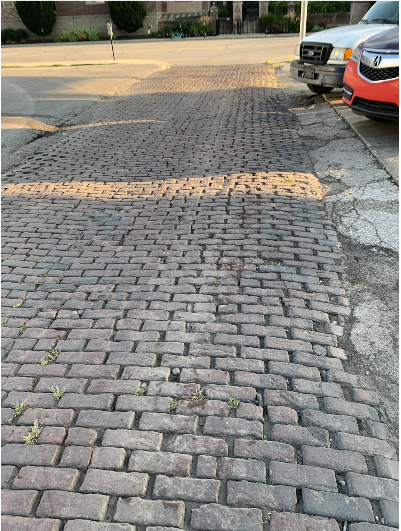
Close-up view of existing condition of the subject alley 2022-CZN-848 / 2022-CVC-848