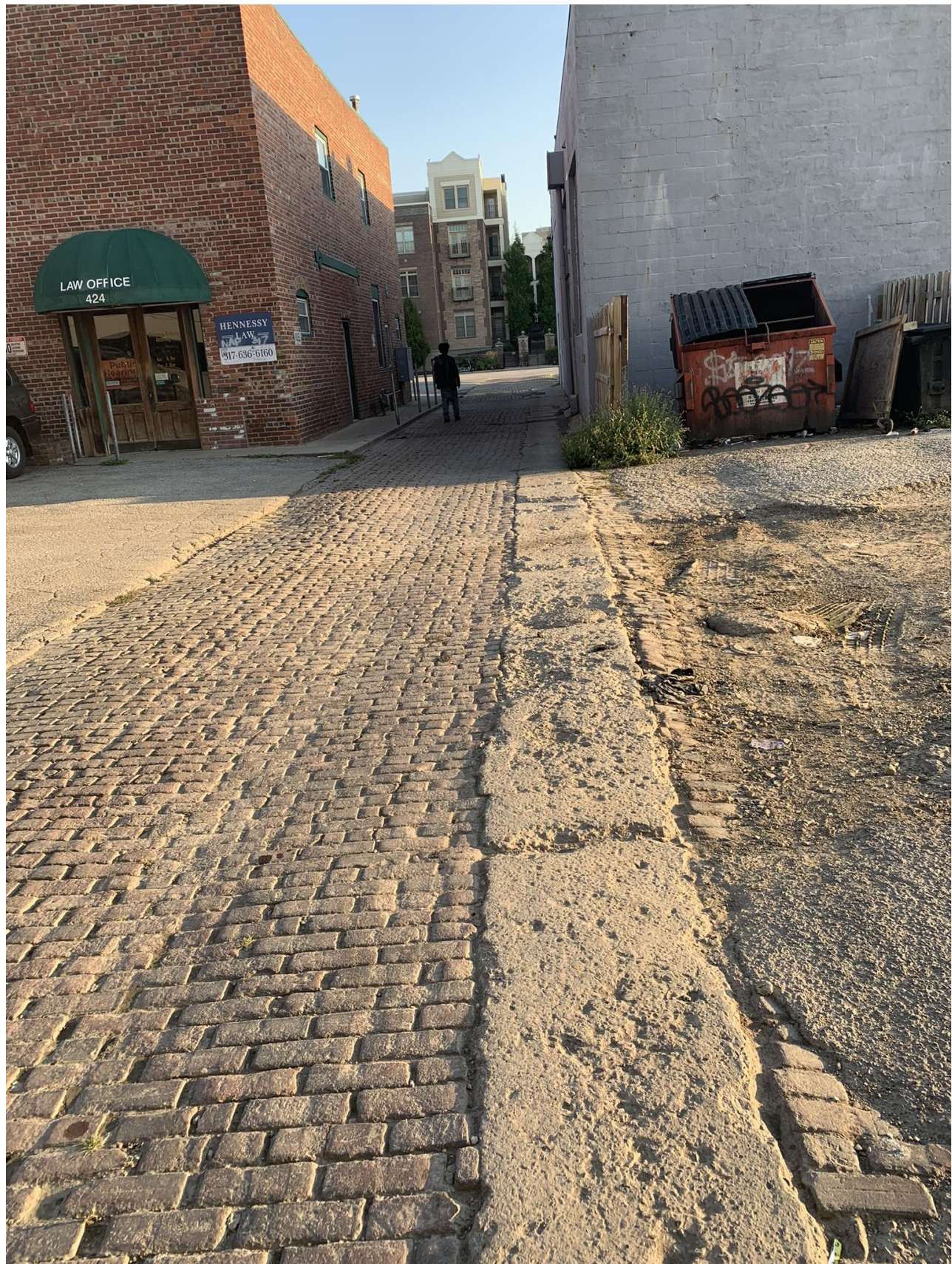
View of the subject alley looking north toward Ohio Street 2022-CZN-848 / 2022-CVC-848