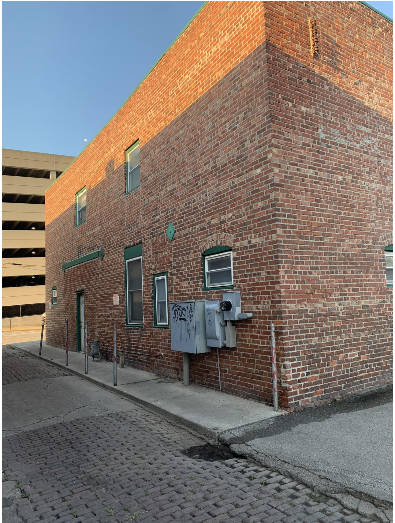
View of existing building at 419 East Ohio Street and subject alley 2022-CZN-848 / 2022-CVC-848