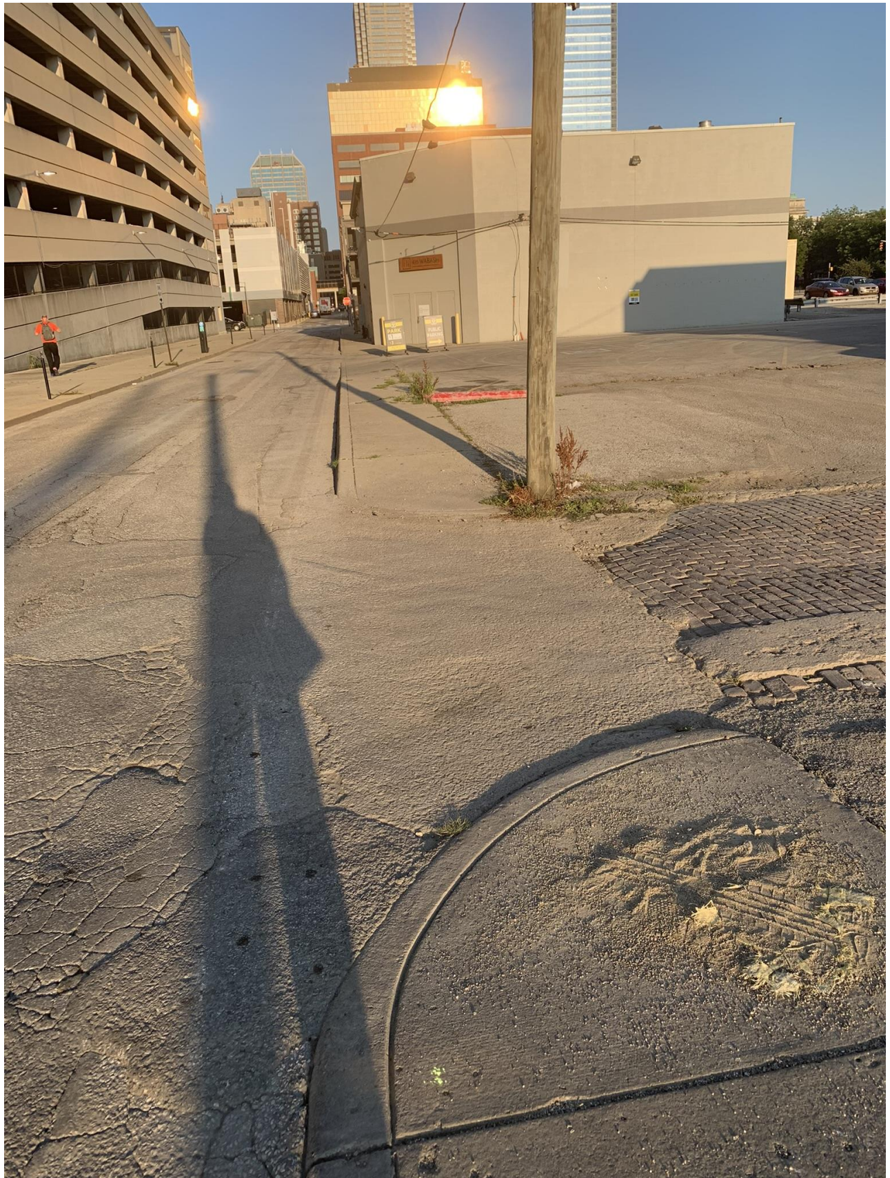
View of south end of site, looking west 2022-CZN-848 / 2022-CVC-848