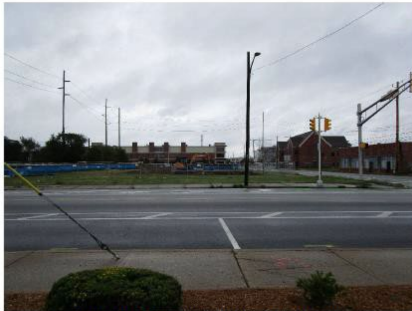
View of site looking south across West 22 nd Street