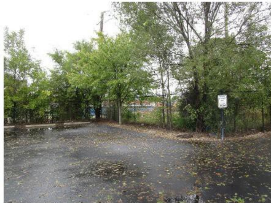
View of site looking northwest from adjacent property to the east