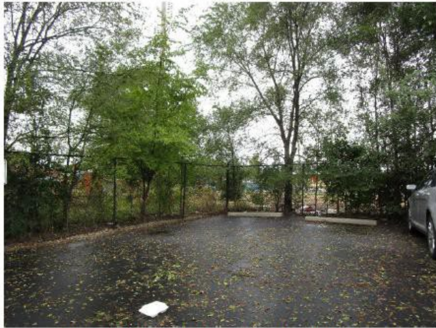
View of site looking north from adjacent property to the east