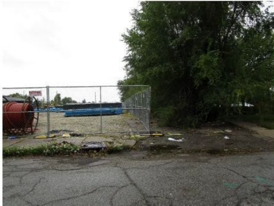
View of site looking north across Mc Lean Place