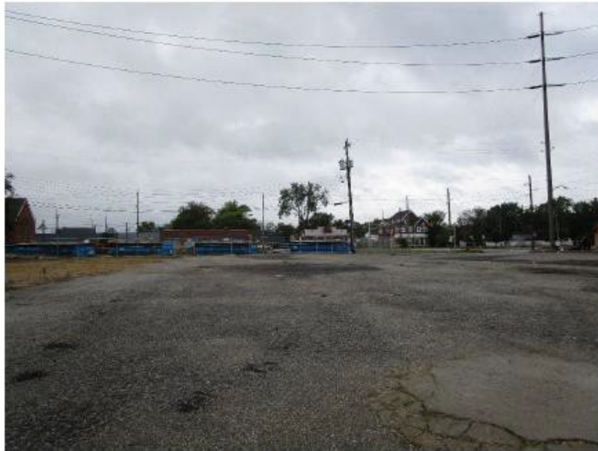
View of site looking west