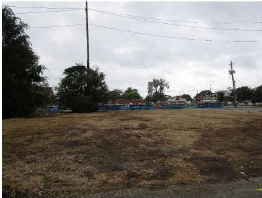
View of site looking west