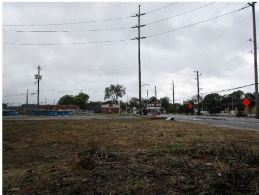
View of site looking west