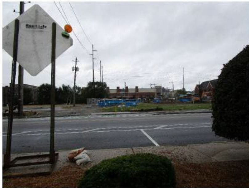
View of site looking south across West 22 nd Street