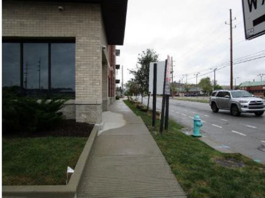
View looking south along North Illinois Street