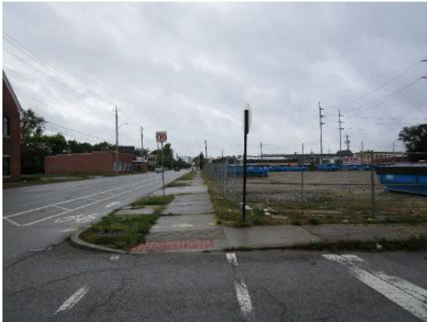
View looking north along North Illinois Street