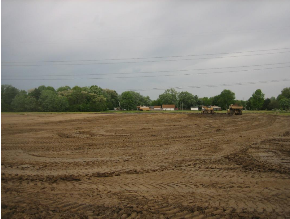
Subject site, looking north from Highcrest Road.