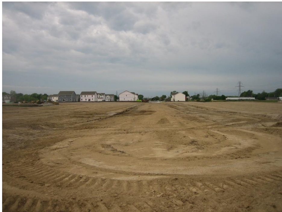
Subject site, looking west from Asher Way.