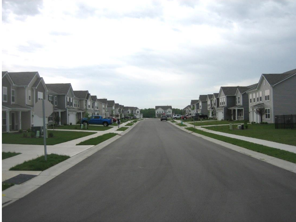
Adjacent developed lots on Highcrest Road, looking south.