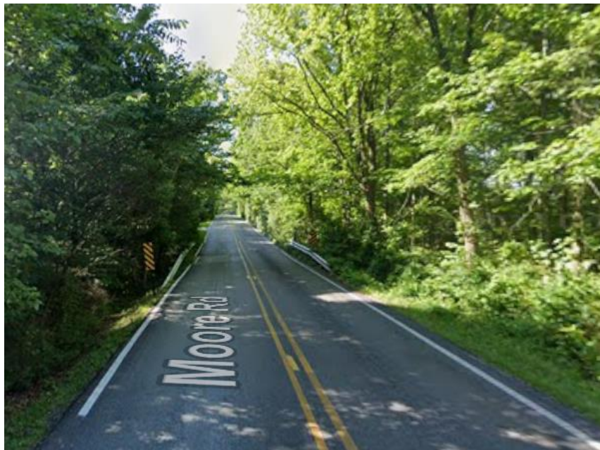
Photo 10: Moore Road Looking South Towards 86 th Street (August 2024)