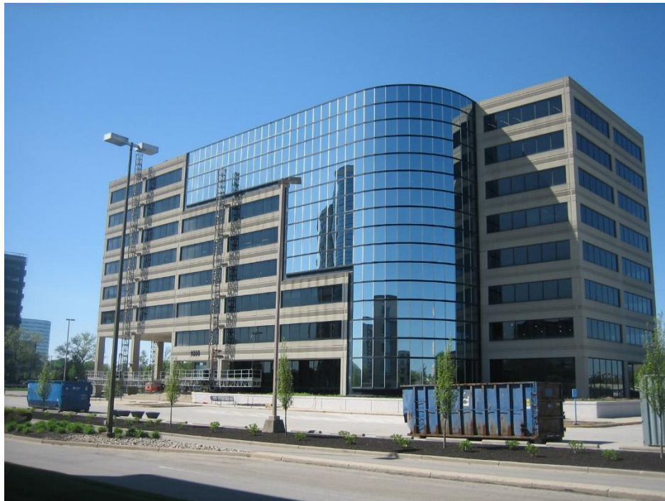
8888 Keystone Crossing building south façade, looking north.