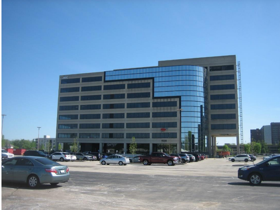
8888 Keystone Crossing building north facade, looking south (proposed sign façade).