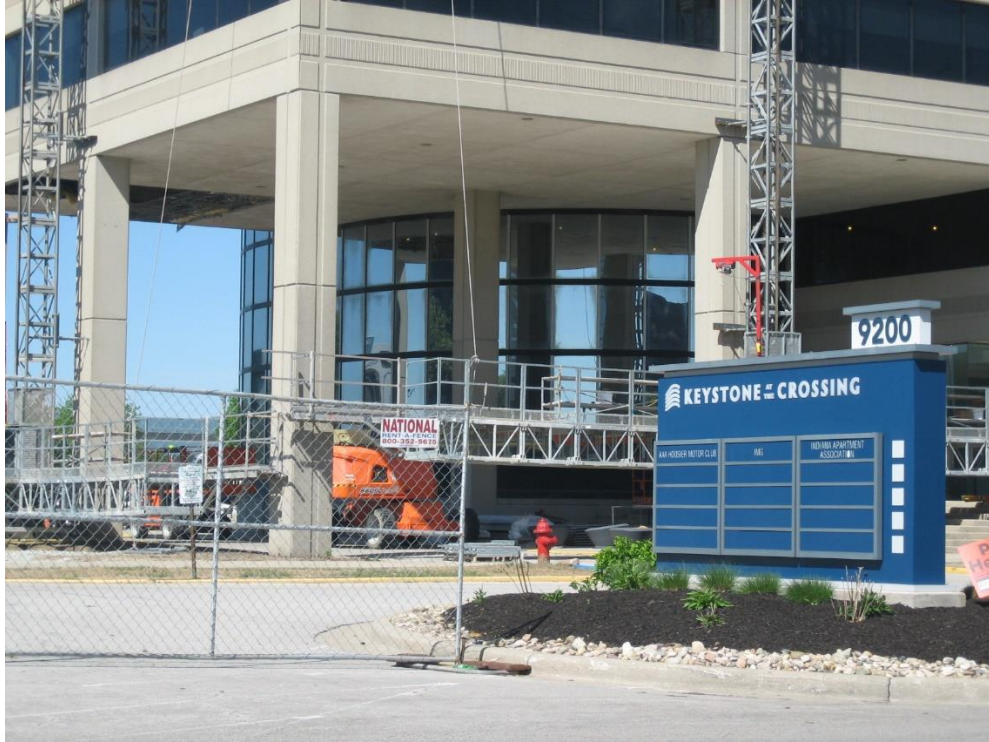
Freestanding monument sign for 9200 Keystone Crossing tenants, easily visible at vehicular / eye level for arriving motorists from the south, looking north.