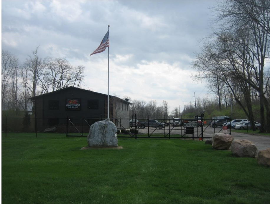
Subject site, looking south from Brookville Road