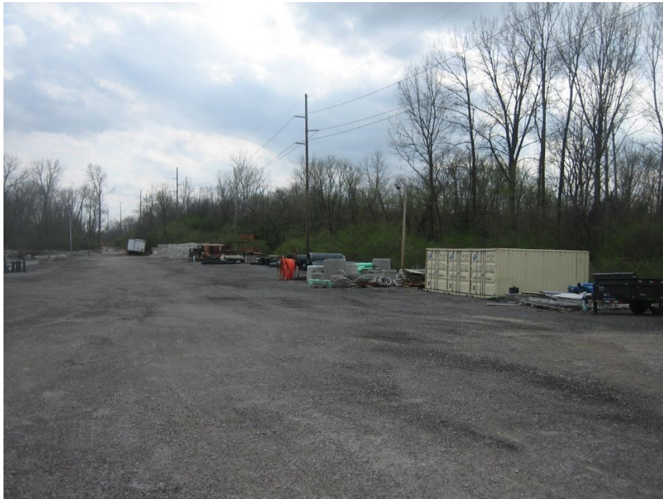
Subject site, looking southwest.