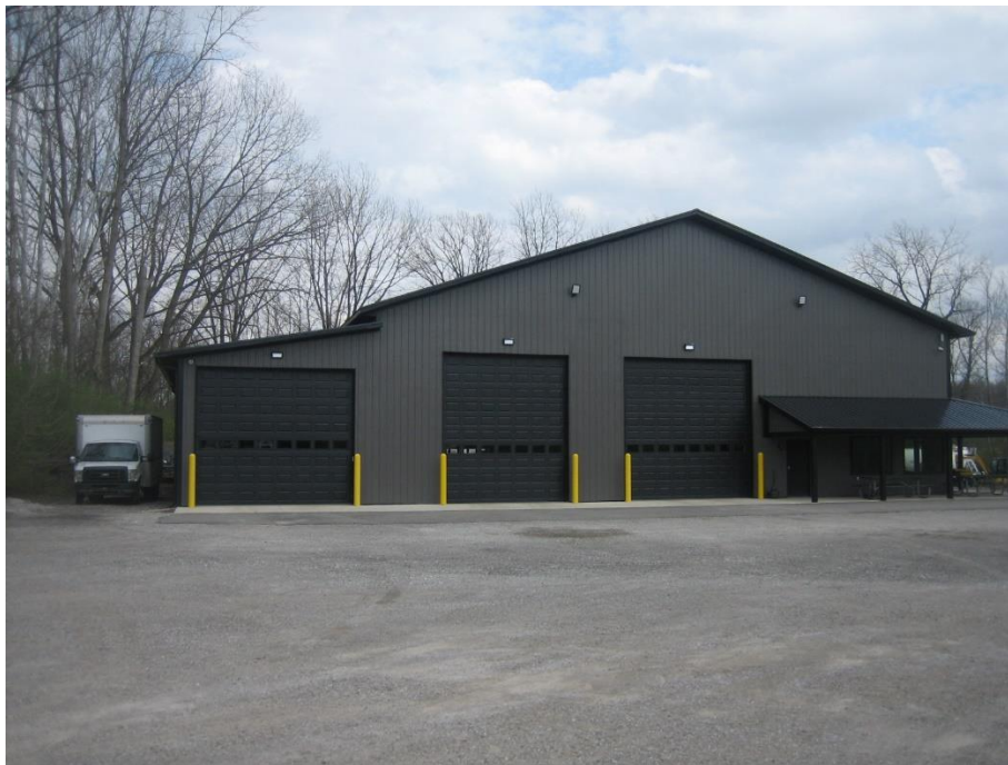
Subject site, existign office and storage building on site, looking east