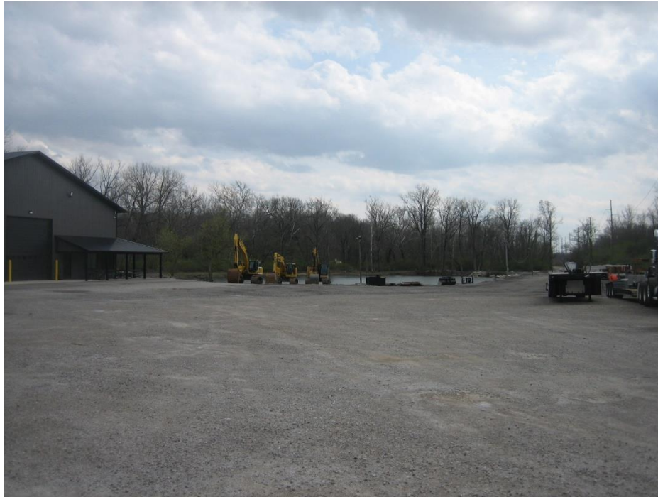
Subject site, looking south