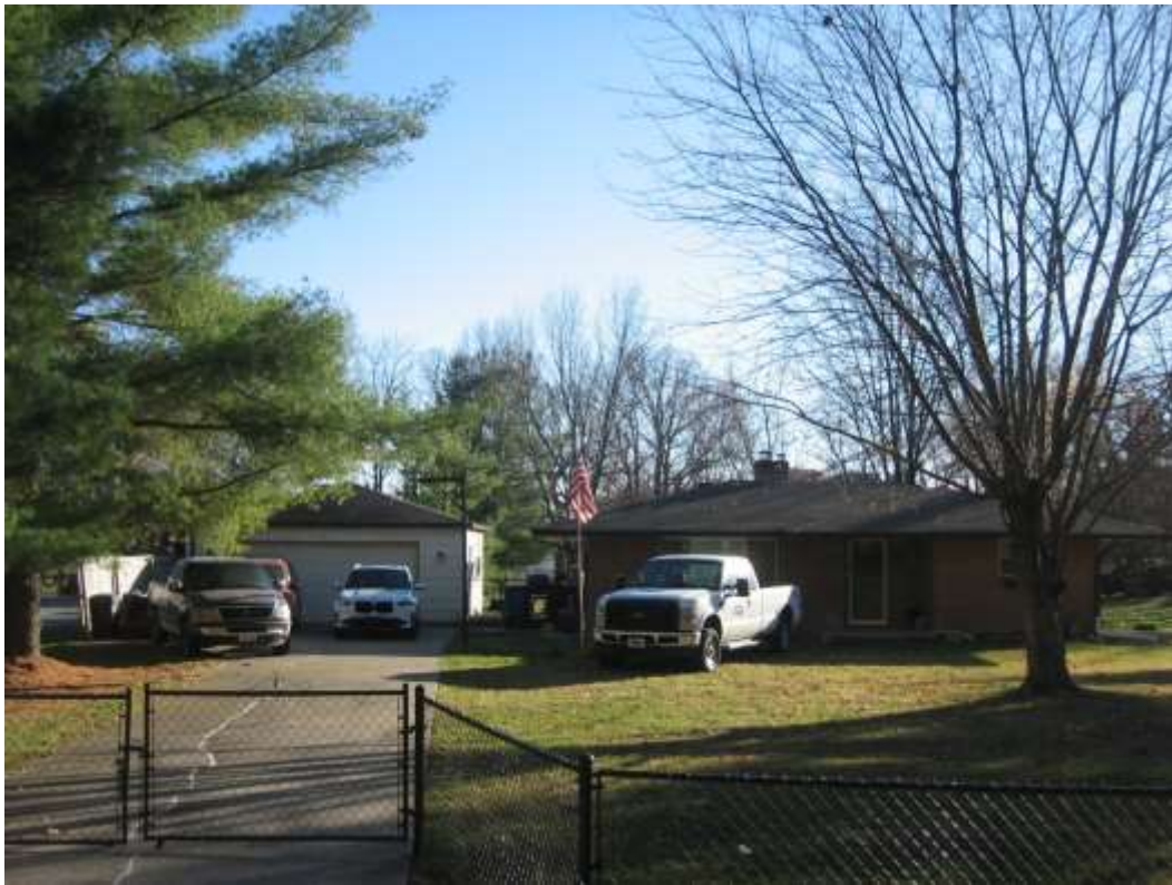
Adjacent property to the west, looking south.