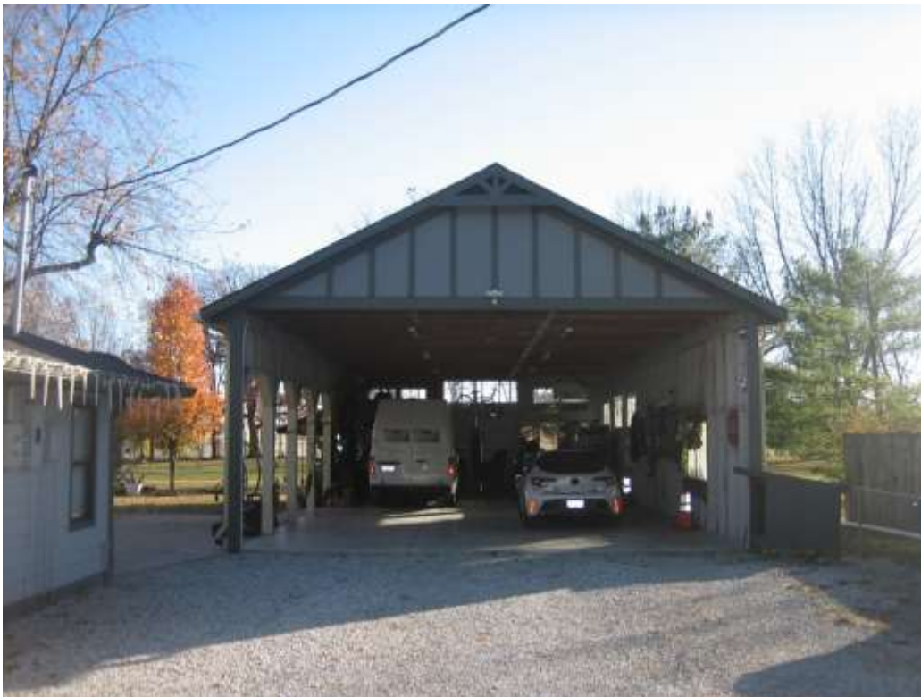
The detached garage, to the west of the primary dwelling, looking south.