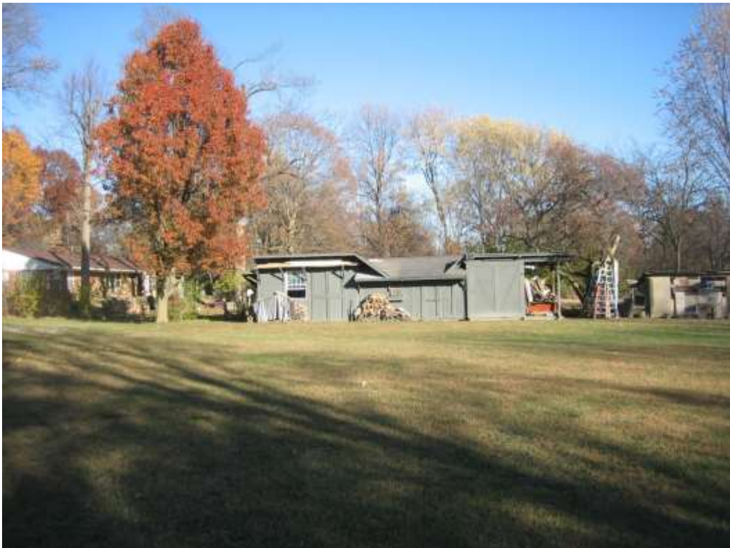
The backyard, showing the side of the freestanding shed, looking east.