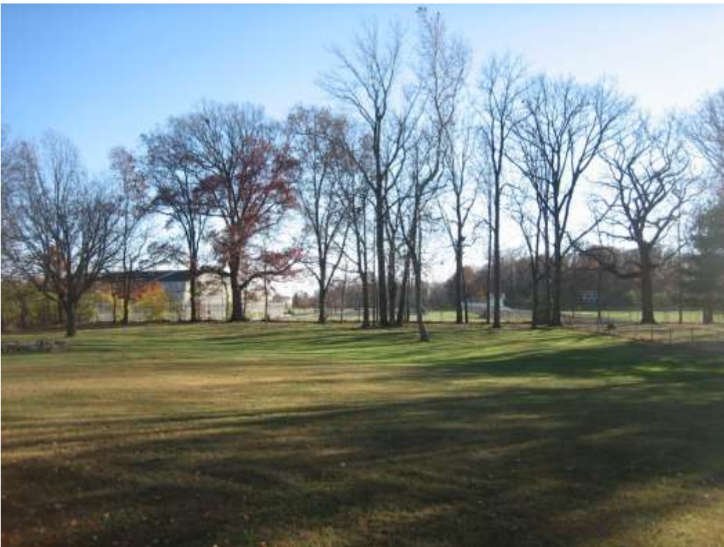
The backyard, looking south.