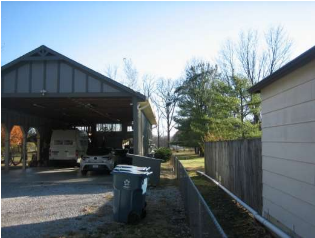
The west side property line, and garage setback, looking south.