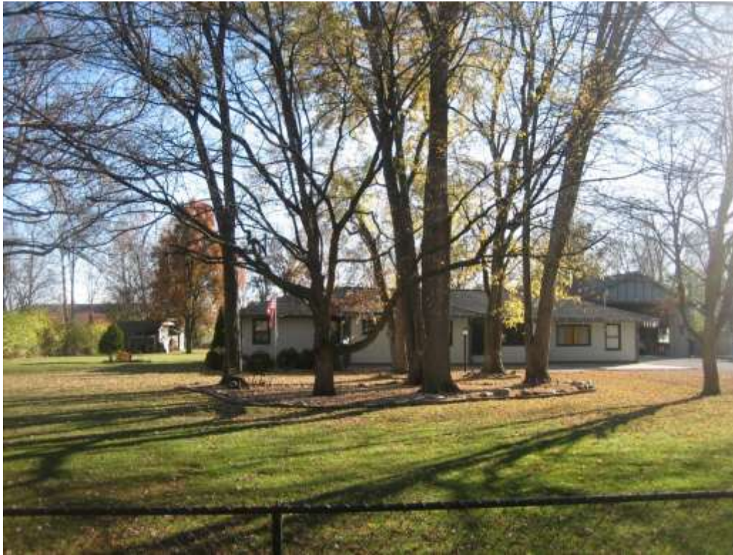
The residence, looking south, from 69 th Street.