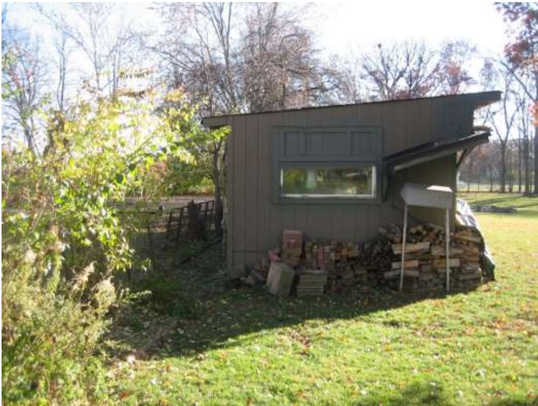
The east side property line, and shed setback, looking south.