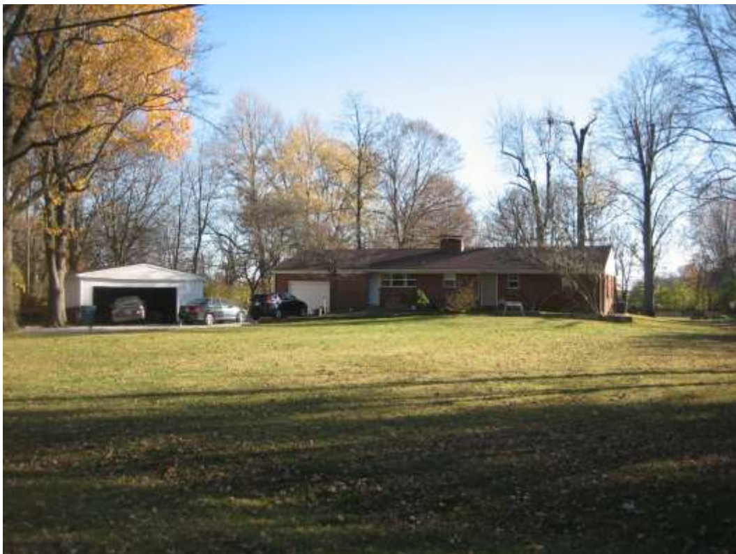
Adjacent property to the east, looking south.