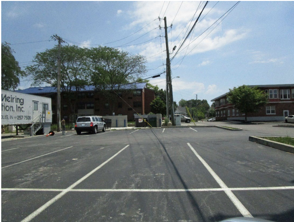
View looking east across adjacent parking lot to the south