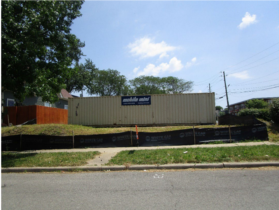
View of site looking northeast across North Jefferson Avenue of site