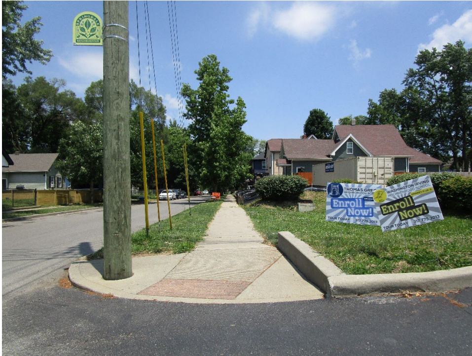
View looking north along North Jefferson Avenue