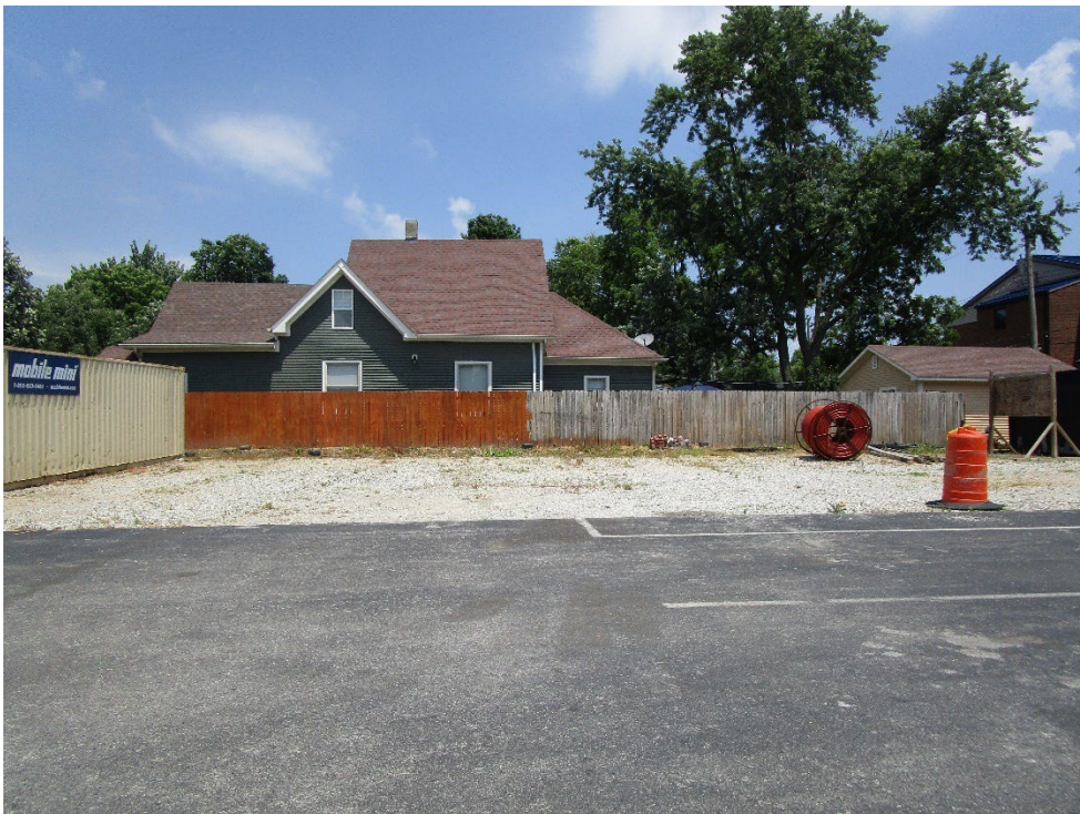
View of site looking north