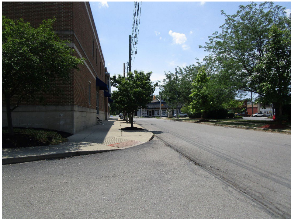
View looking south along North Jefferson Avenue