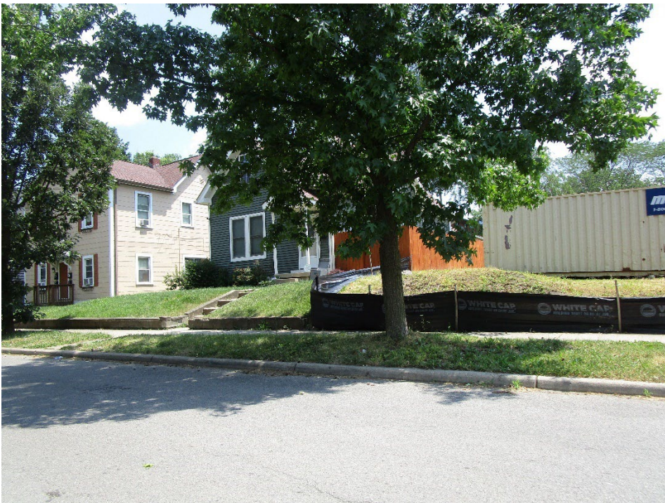
View looking of site and adjacent single-family dwelling northeast across North Jefferson Avenue