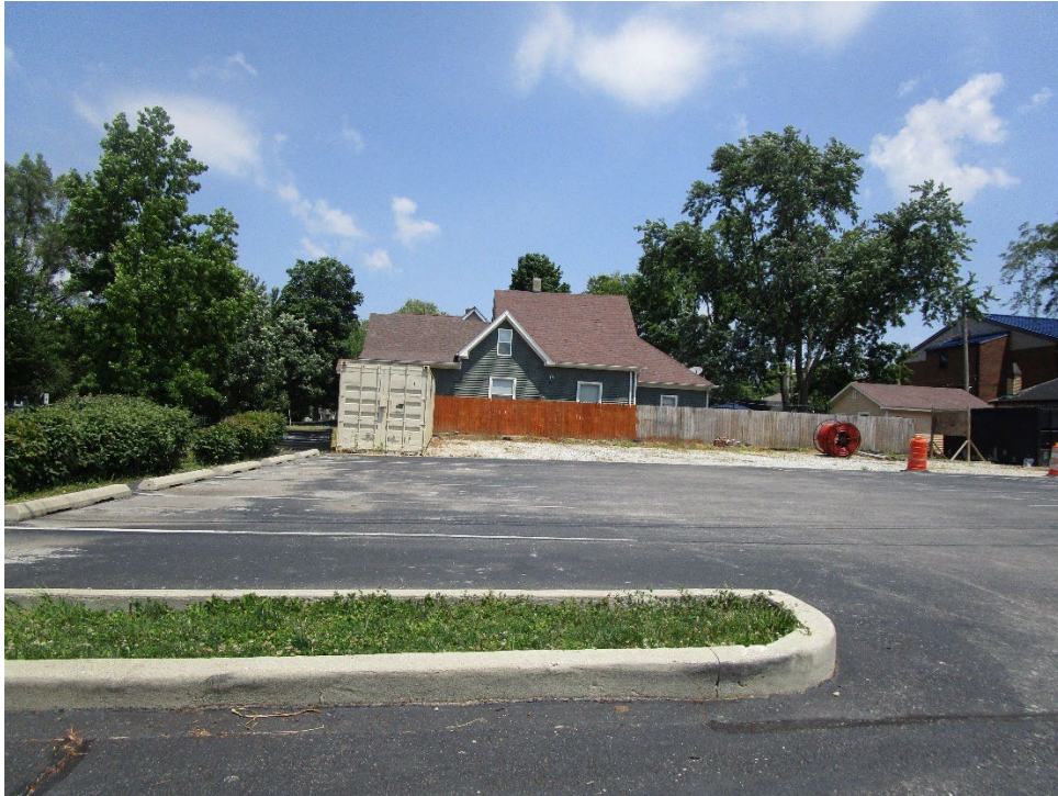
View of site looking north