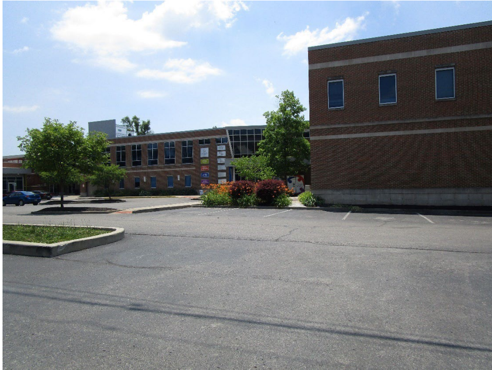
View from site looking southeast