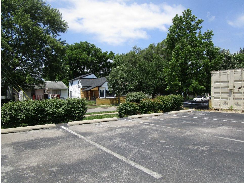
View looking northwest from adjacent parking to the south