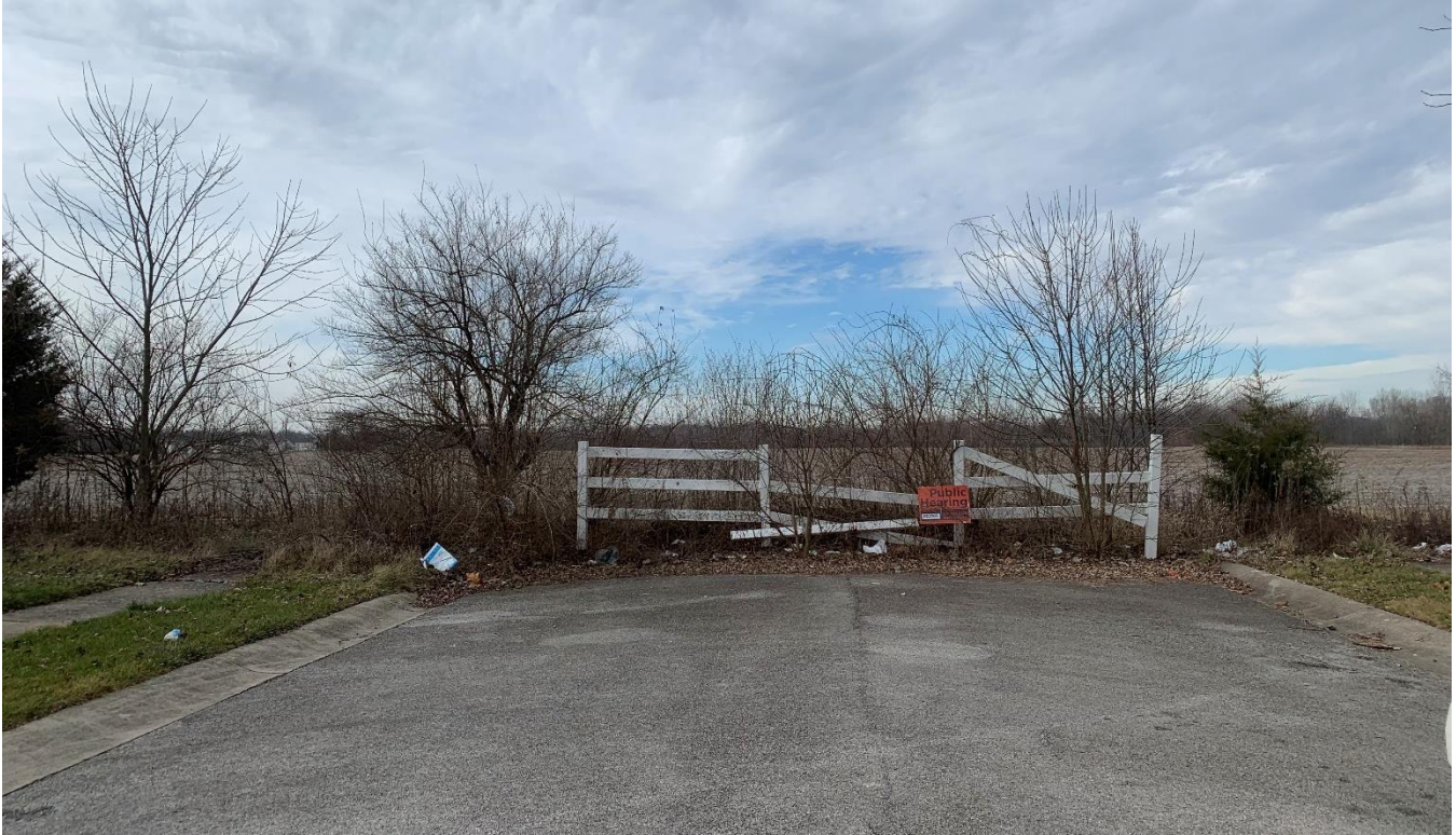
Photo of the adjacent residential neighborhood where the street connection will take place.