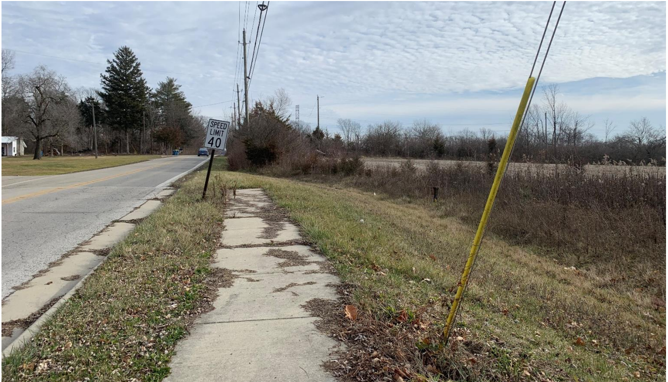
Photo looking east where the sidewalk ends along 46th Street.