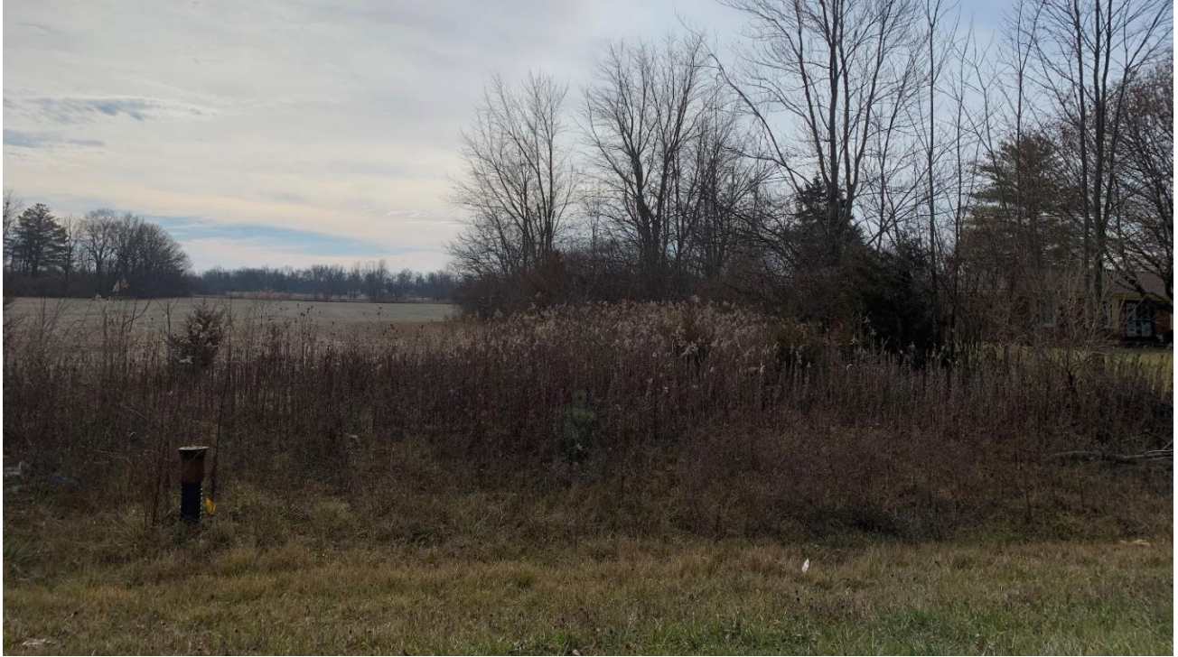
Photo looking south on to the subject site from 46 th Street.