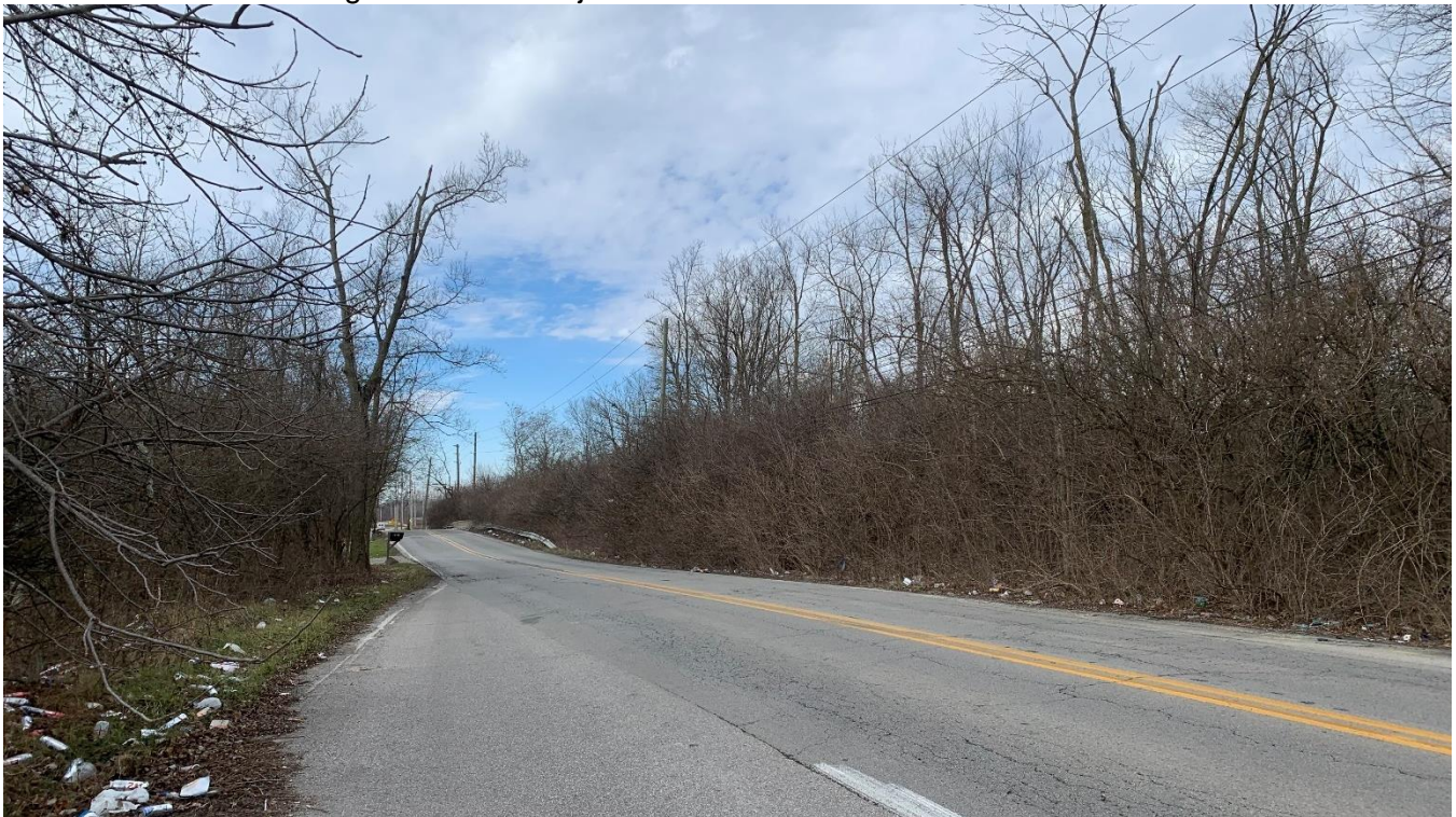
Photo looking north at the southern property boundary along 42 nd Street.