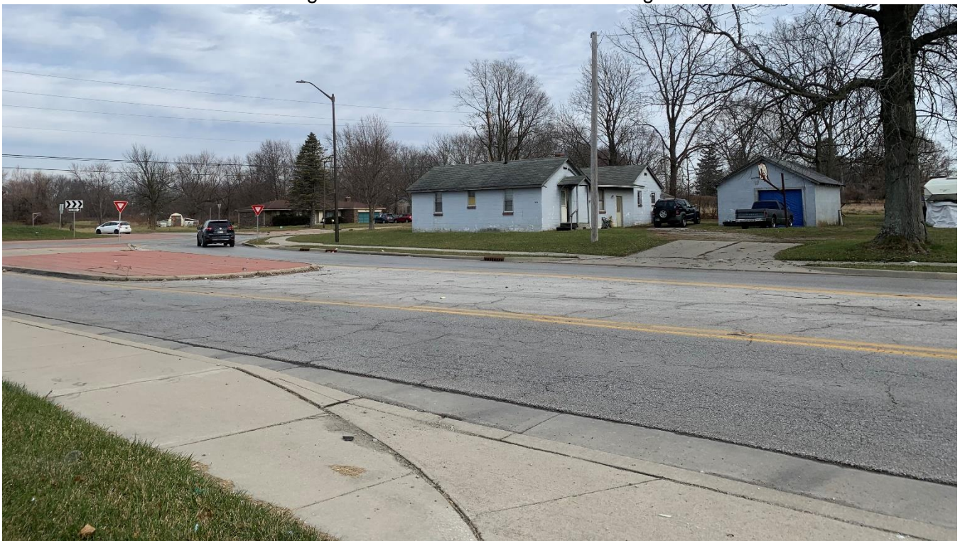
Photo looking east across German Church Road to the corner subject site. Buildings to be removed .