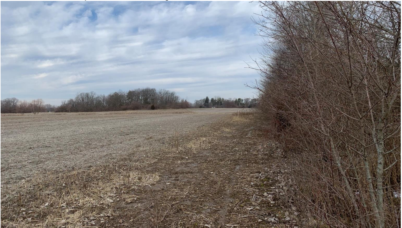
Photo of the subject site looking north from the eastern property boundary.