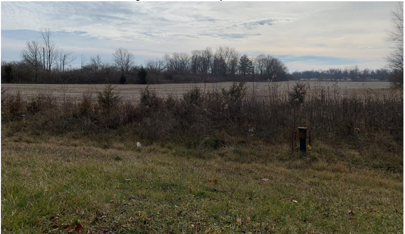
Photo looking south on to the subject site from 46 th Street.