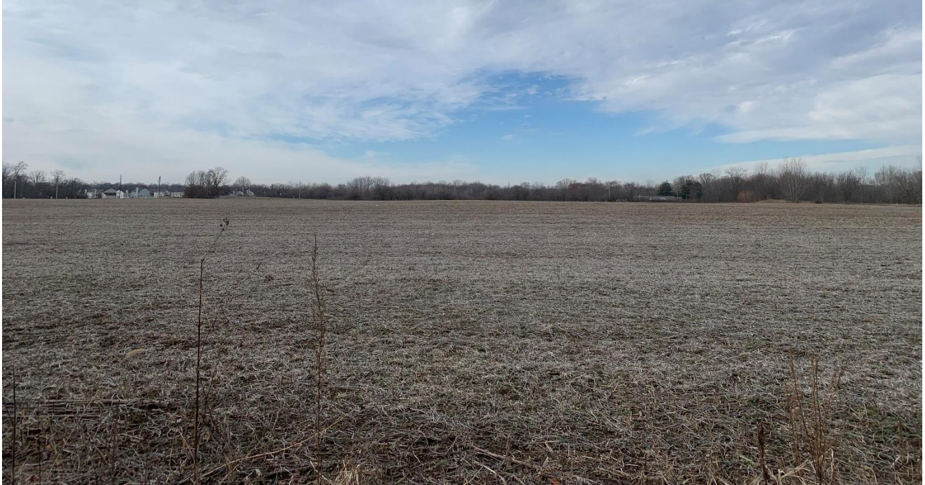
Photo of the subject site looking west from the eastern property boundary.