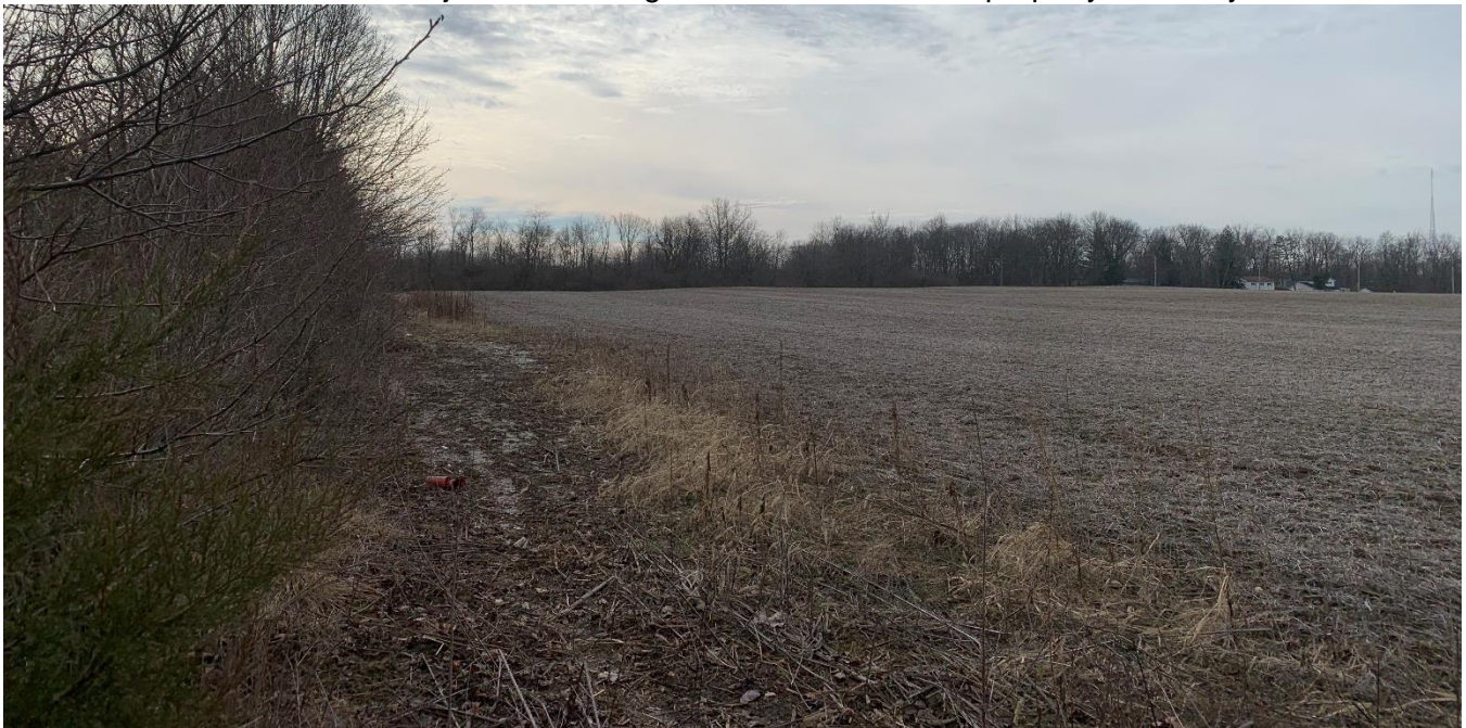
Photo of the subject site looking south from the eastern property boundary.