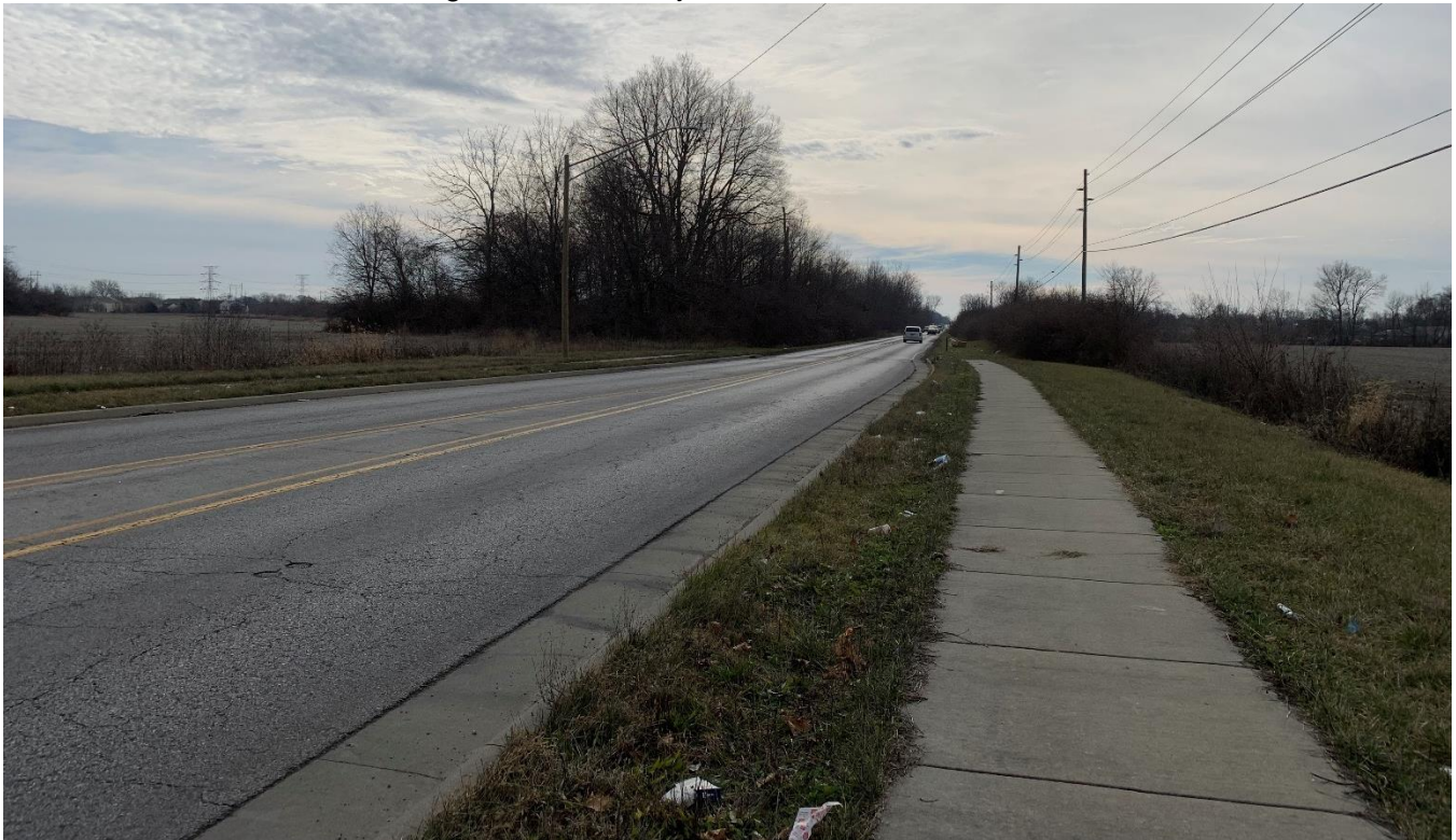
Photo looking southeast at the subject site from German Church Road.