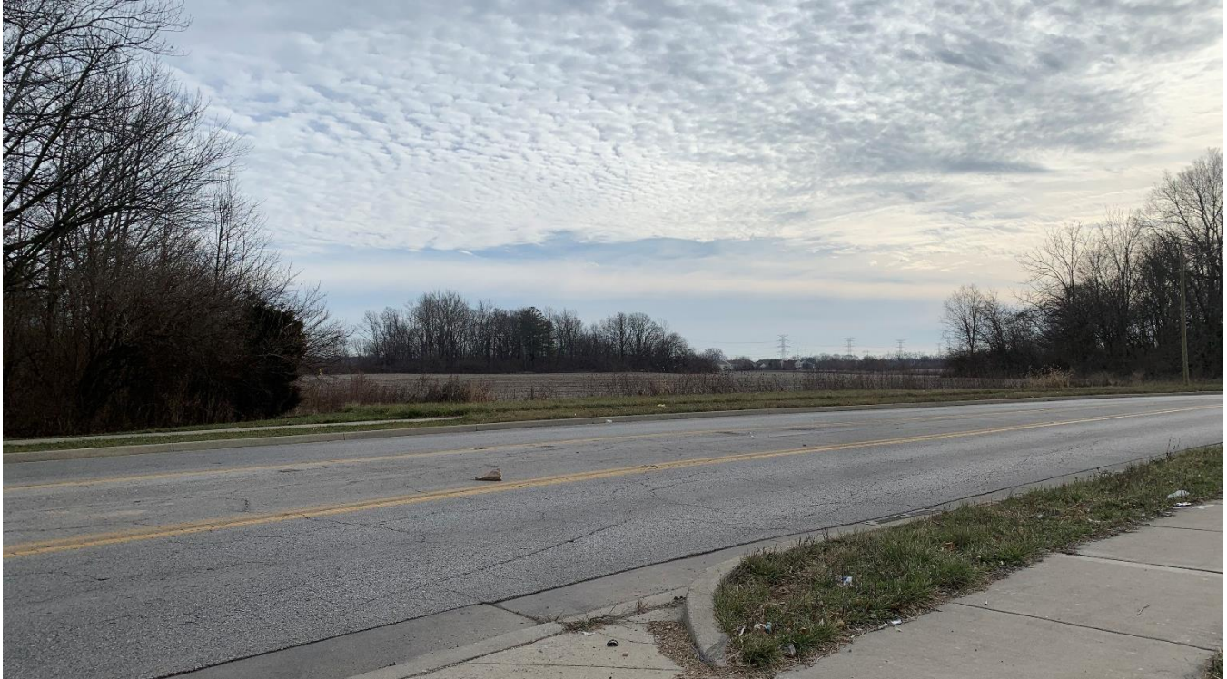
Photo looking east at the subject site from German Church Road.