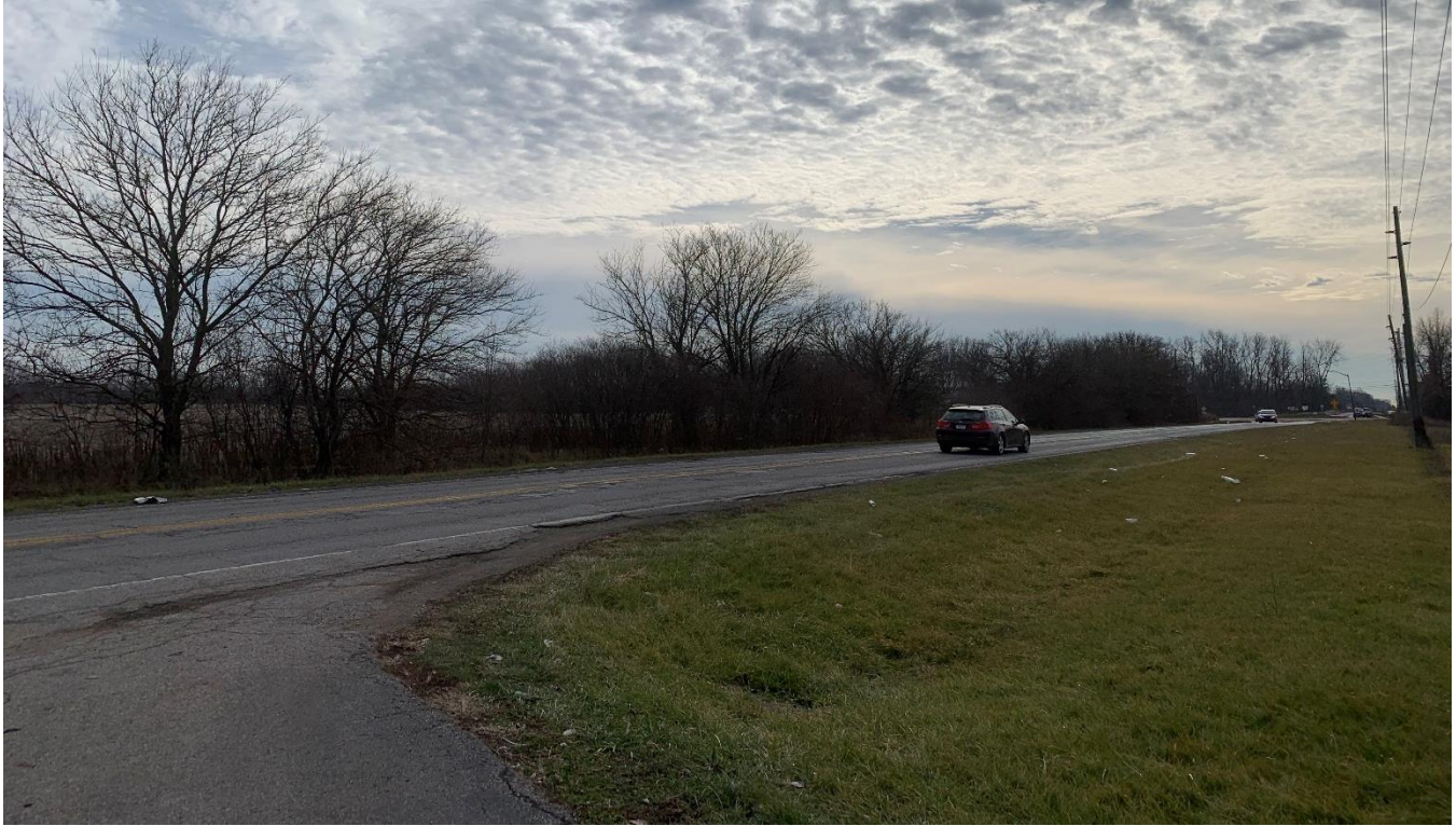
Photo looking east at the subject site from the church on German Church Road.