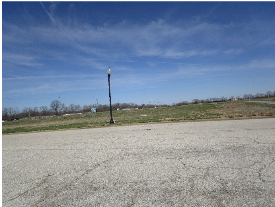
View of site looking north across Camby Village Boulevard