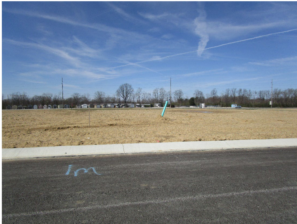
View from site looking south