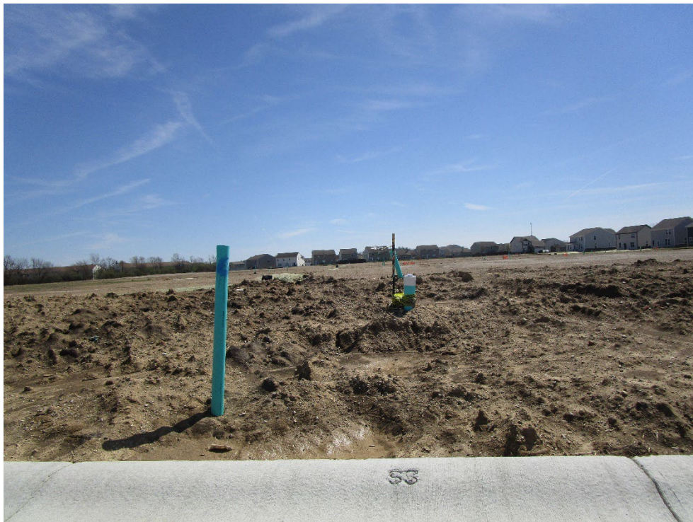
View from site looking east