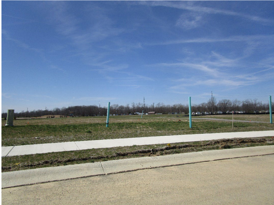
View from site looking south