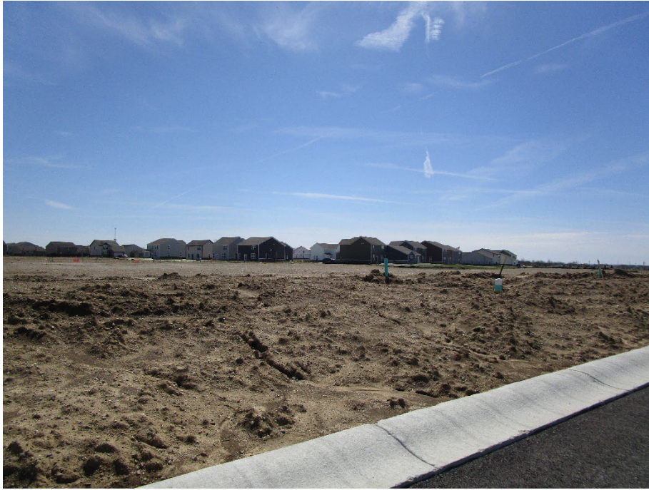
View from site looking southeast