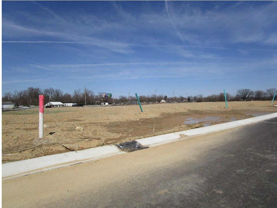
View from site looking northwest