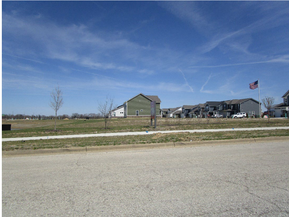
View of site looking north across Camby Village Boulevard