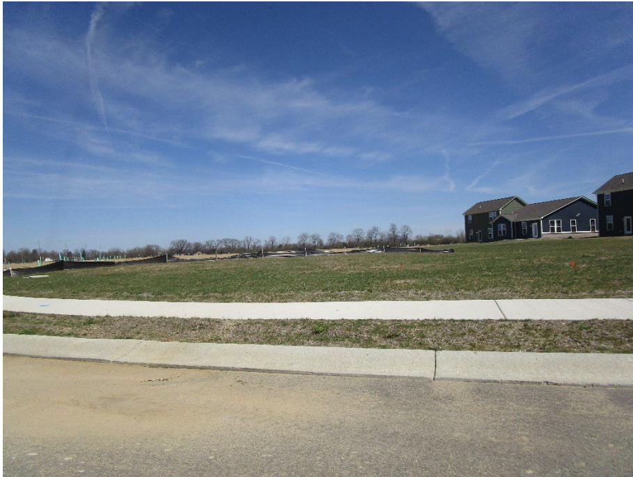
View of site looking north across Hollander Drive