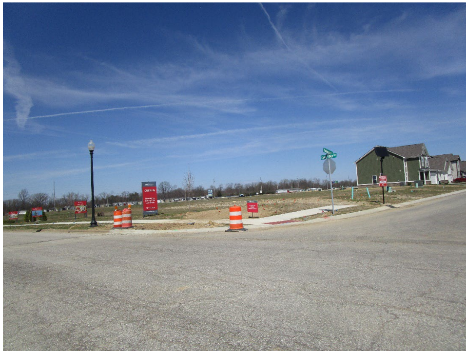
View of site looking northwest across intersection of Camby Village Boulevard and Hollander Drive