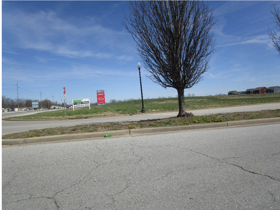
View of site looking north across Camby Village Boulevard entrance