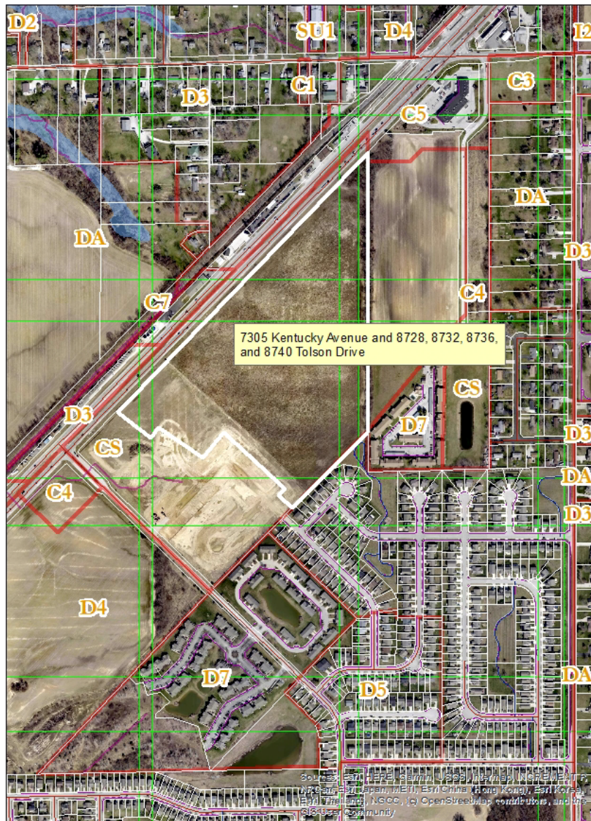
7305 Kentucky Avenue and 8728, 8732, 8736, and 8740 Tolson Drive