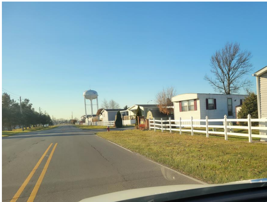
Photo 4: Southern Portion Of Existing Trailer Park Along 52 nd Street