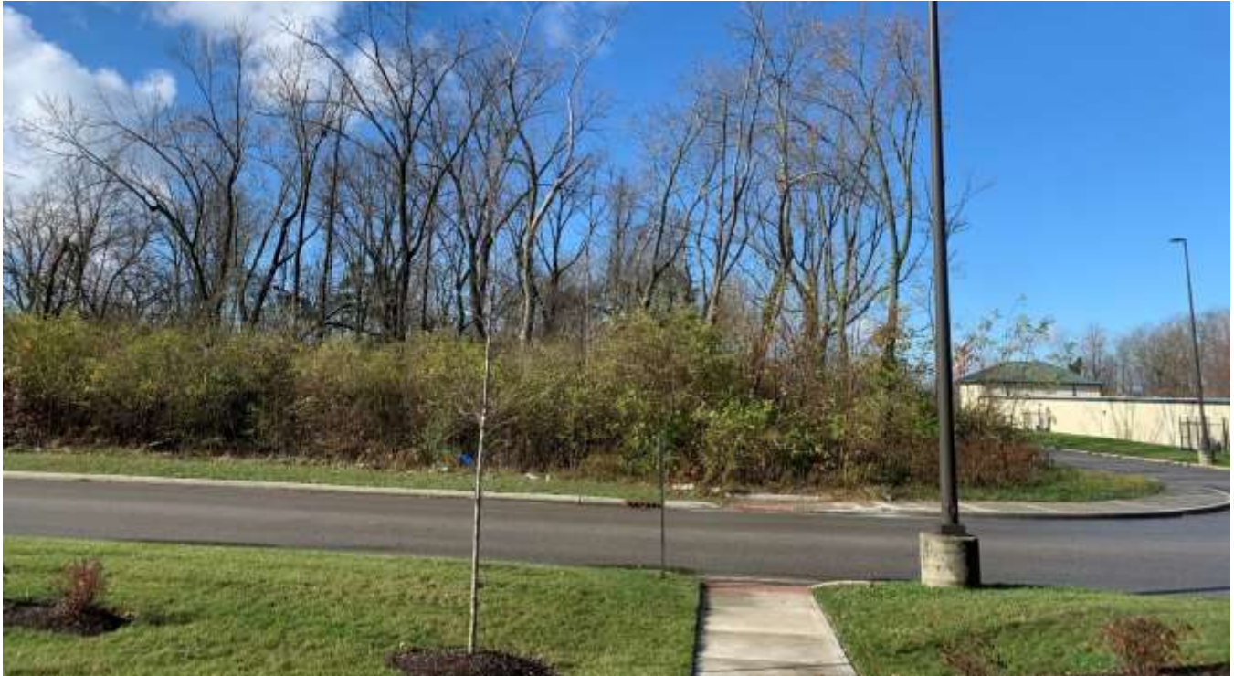
Photo of the northeastern property boundary where the sidewalk ends.