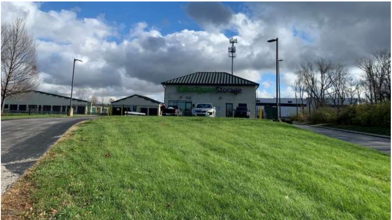
Self-storage facility north of the site.