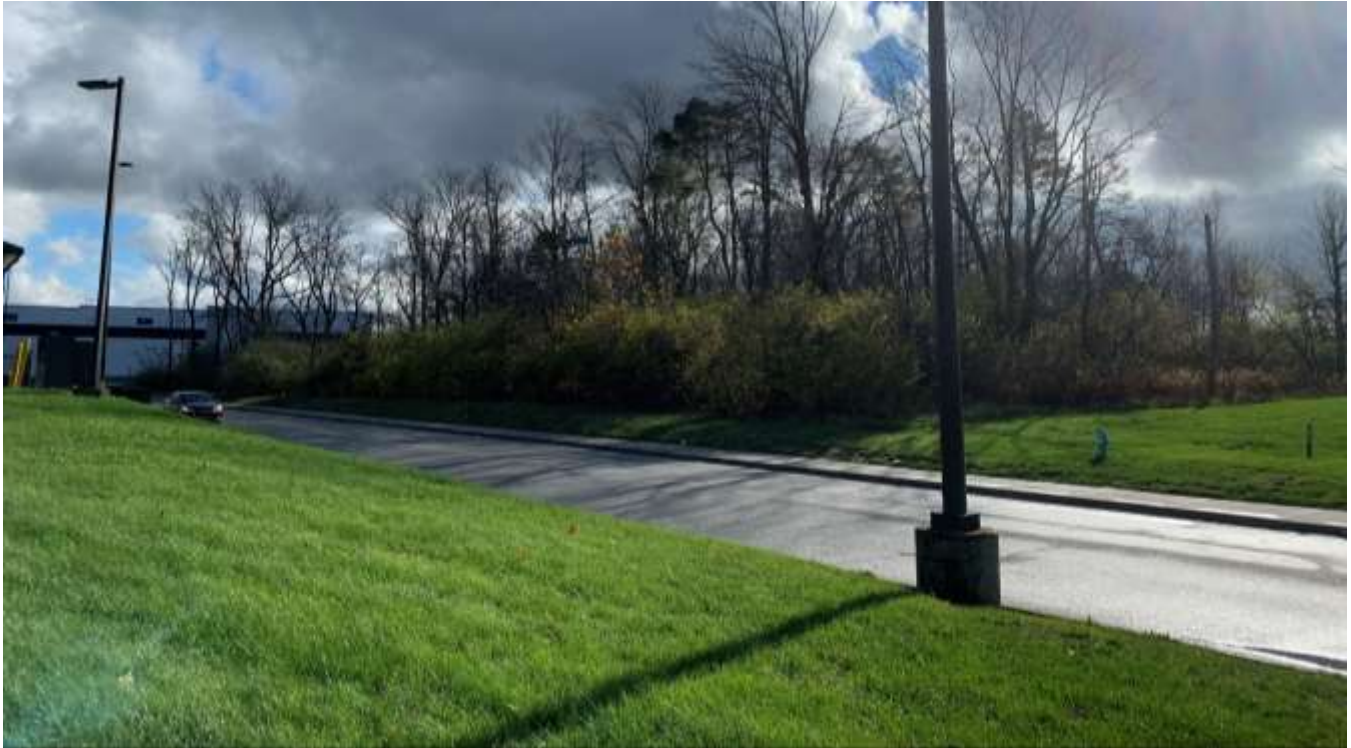
Northern property boundary along Shear Avenue looking east.