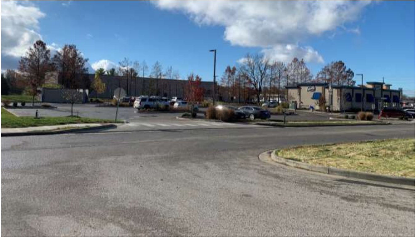
Photo of the fast-food restaurant west of the site.