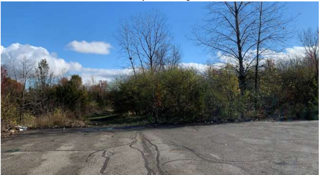
View looking east across the subject site.