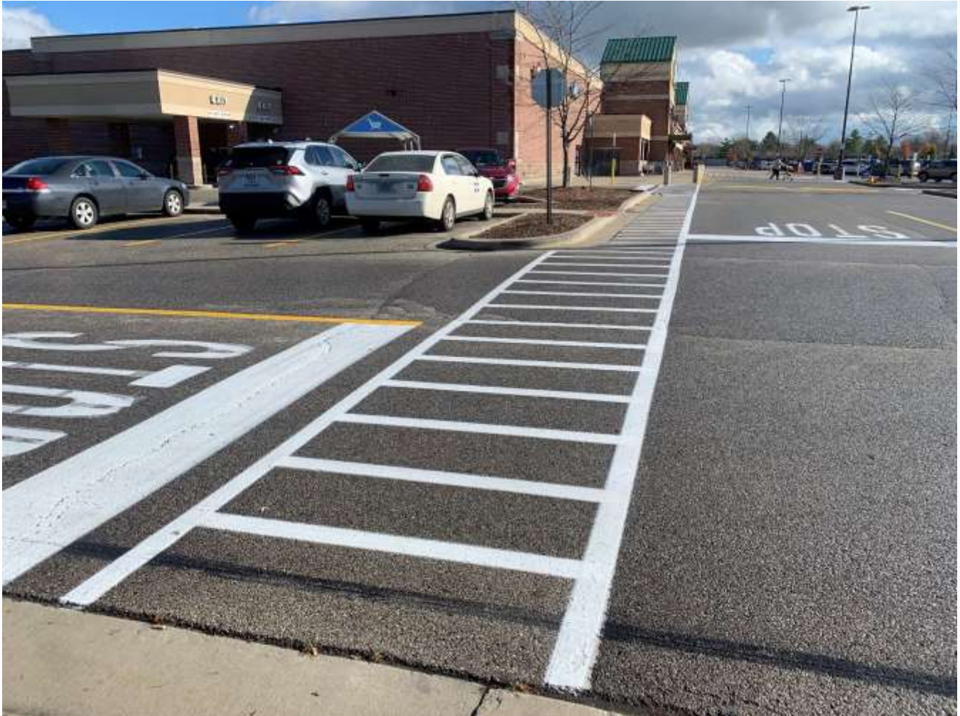
Existing crosswalk from the property to the grocery store to the east.