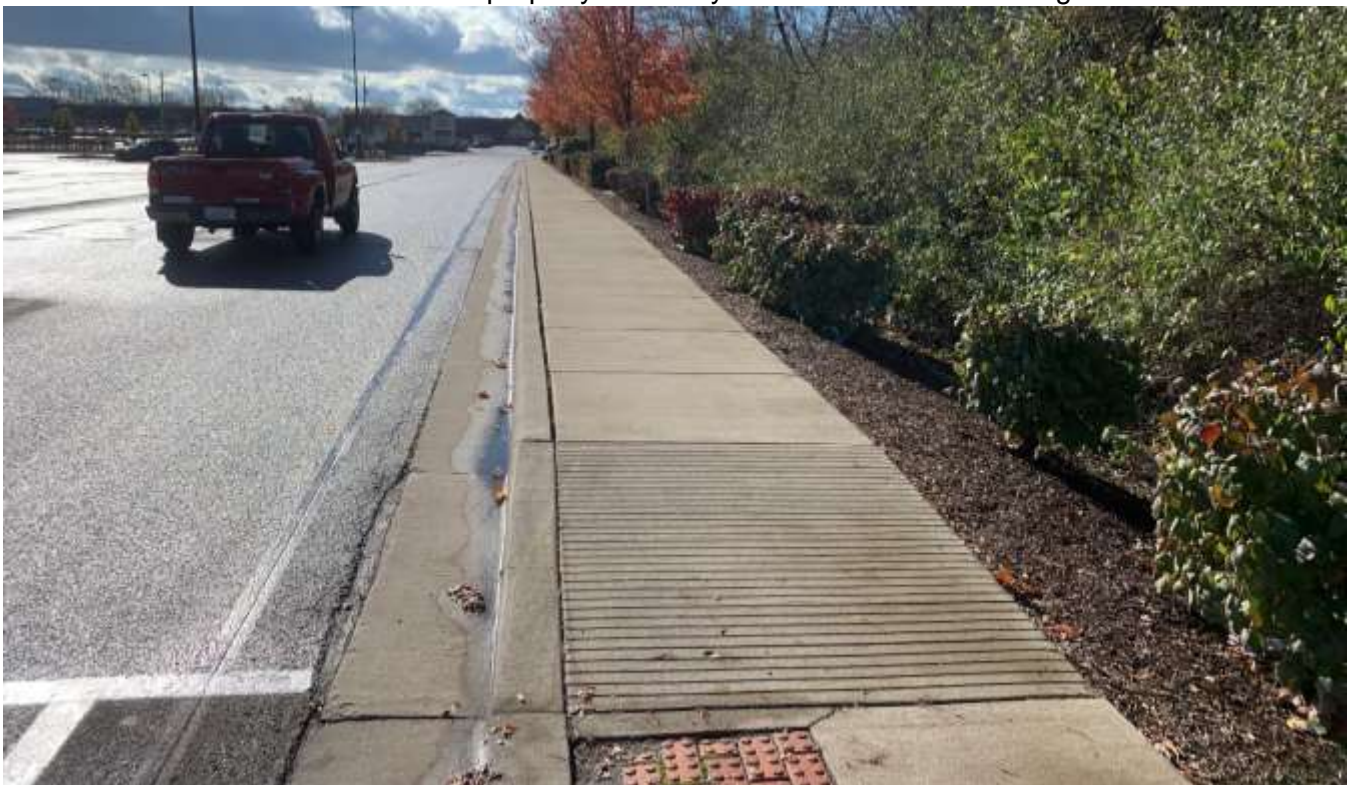
Sidewalk that leads to East Thompson Road.