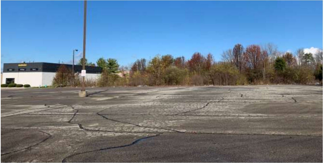
View of the subject site looking north across the site.