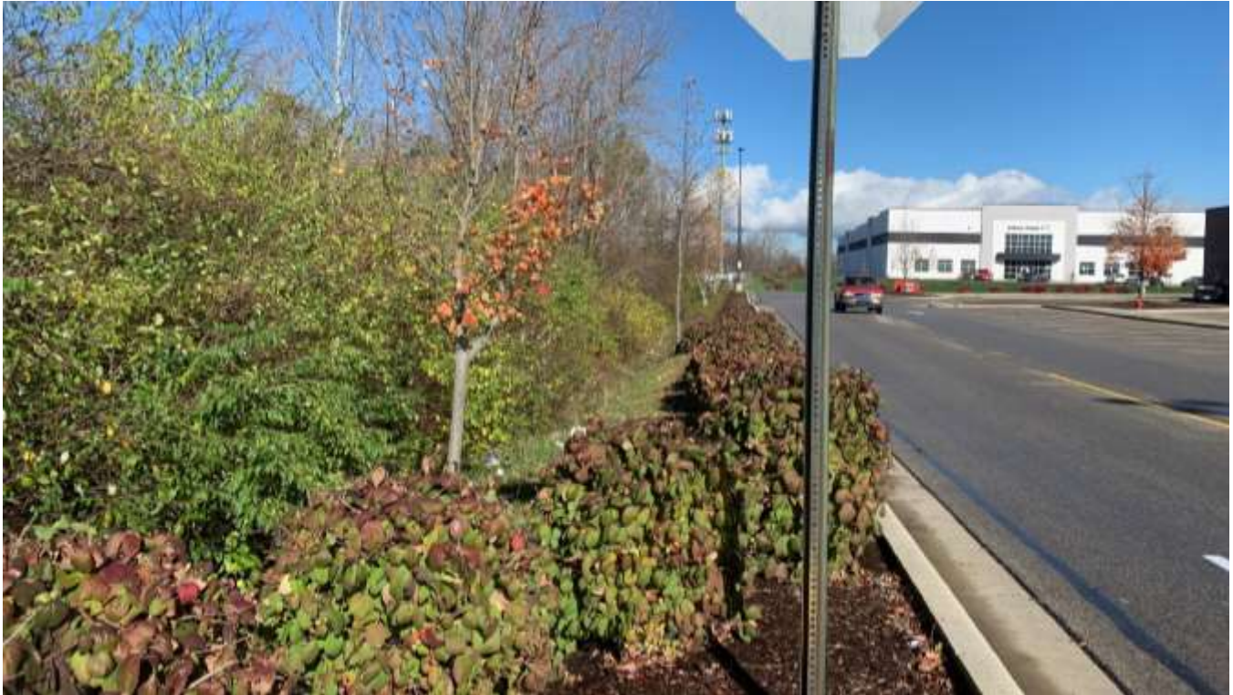
Eastern section of the property boundary without a sidewalk looking north.