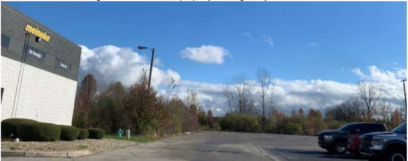
Photo of the subject site looking east.