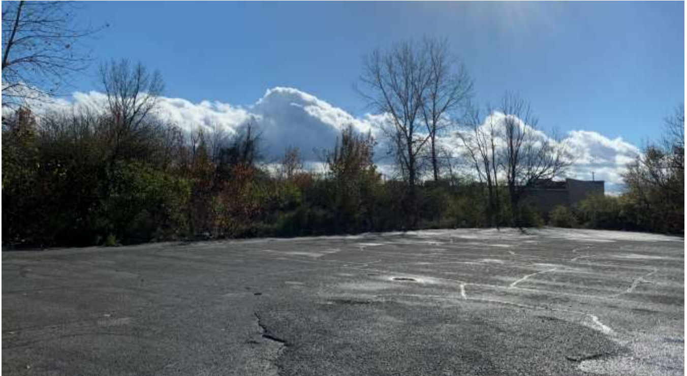
View of the subject site looking southeast.