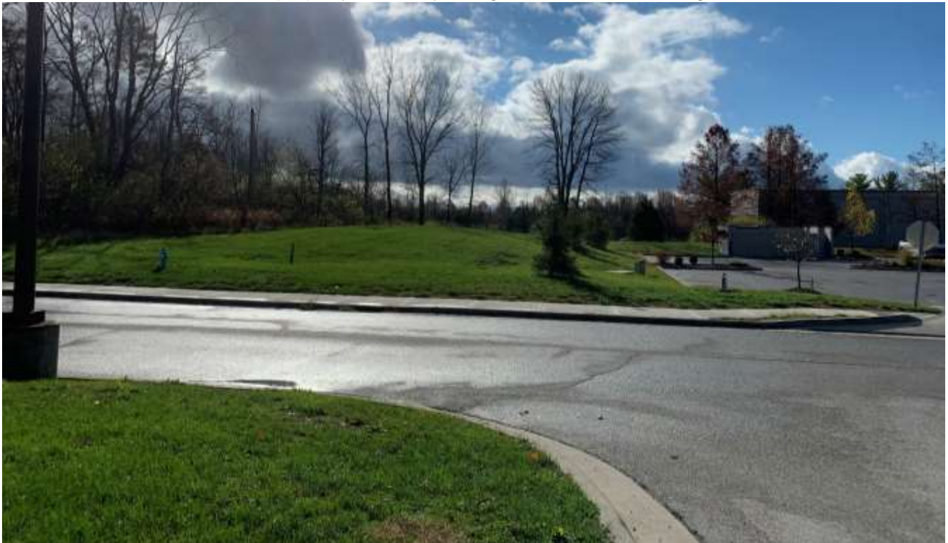
Northern property boundary along Shear Avenue looking south.