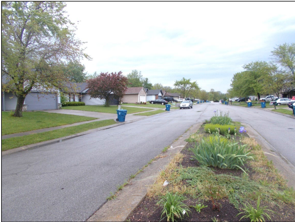
Looking north on River Birch Drive from 30 th Street.