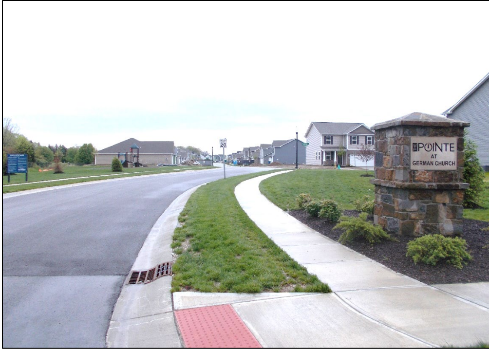
Looking south on Pointe Harbour Drive from 30 th Street.