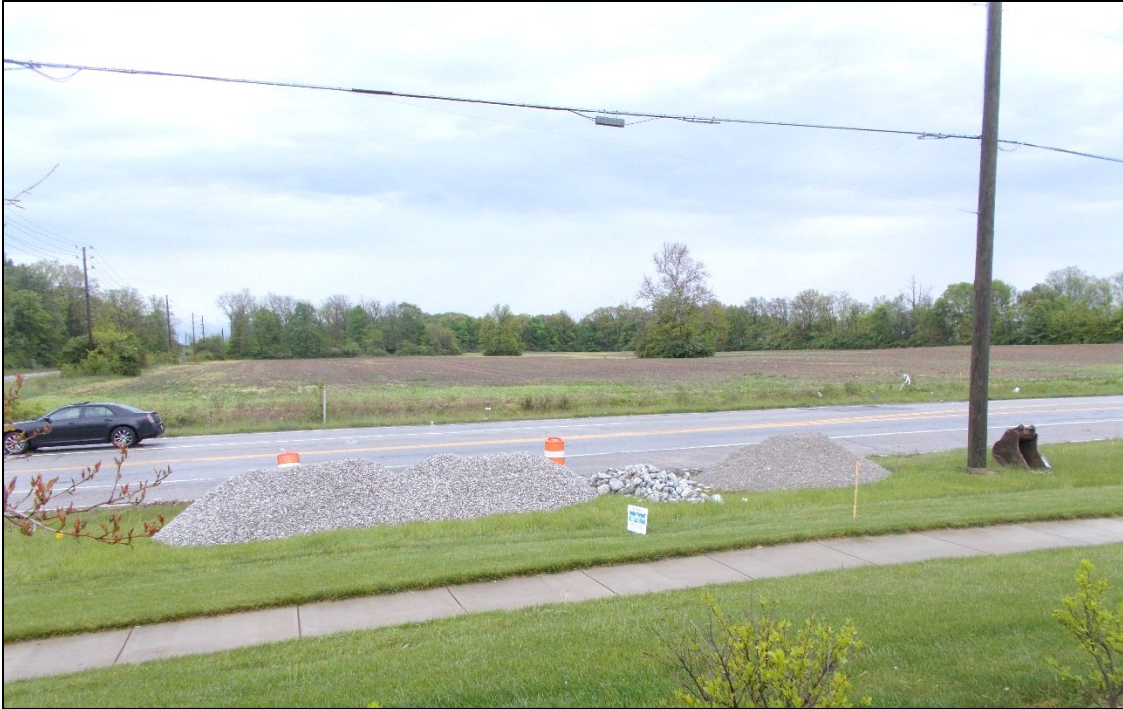
Looking north across 30 th Street to the subject site.