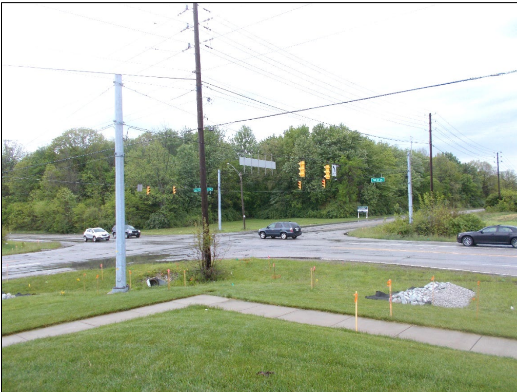
Looking northwest at the intersection of 30 th Street and German Church Road.