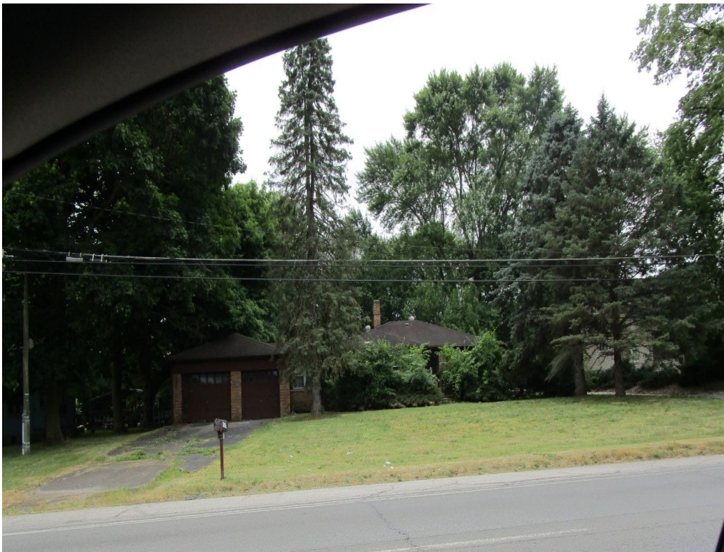
View of site looking south across Rockville Road