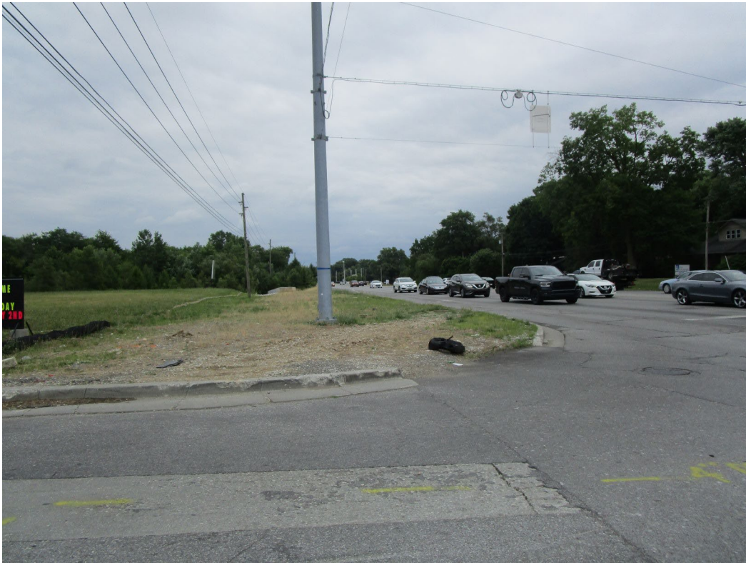
View looking east along Rockville Road