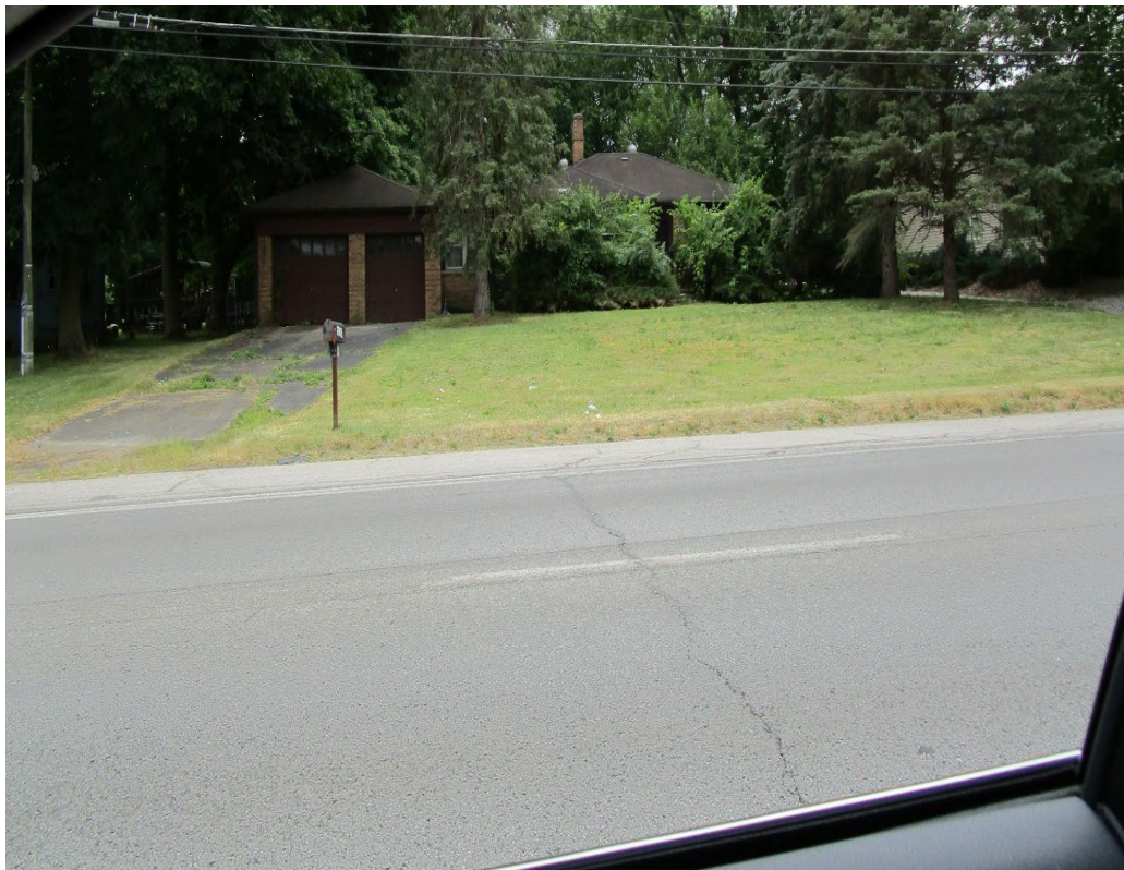
View of site looking south across Rockville Road