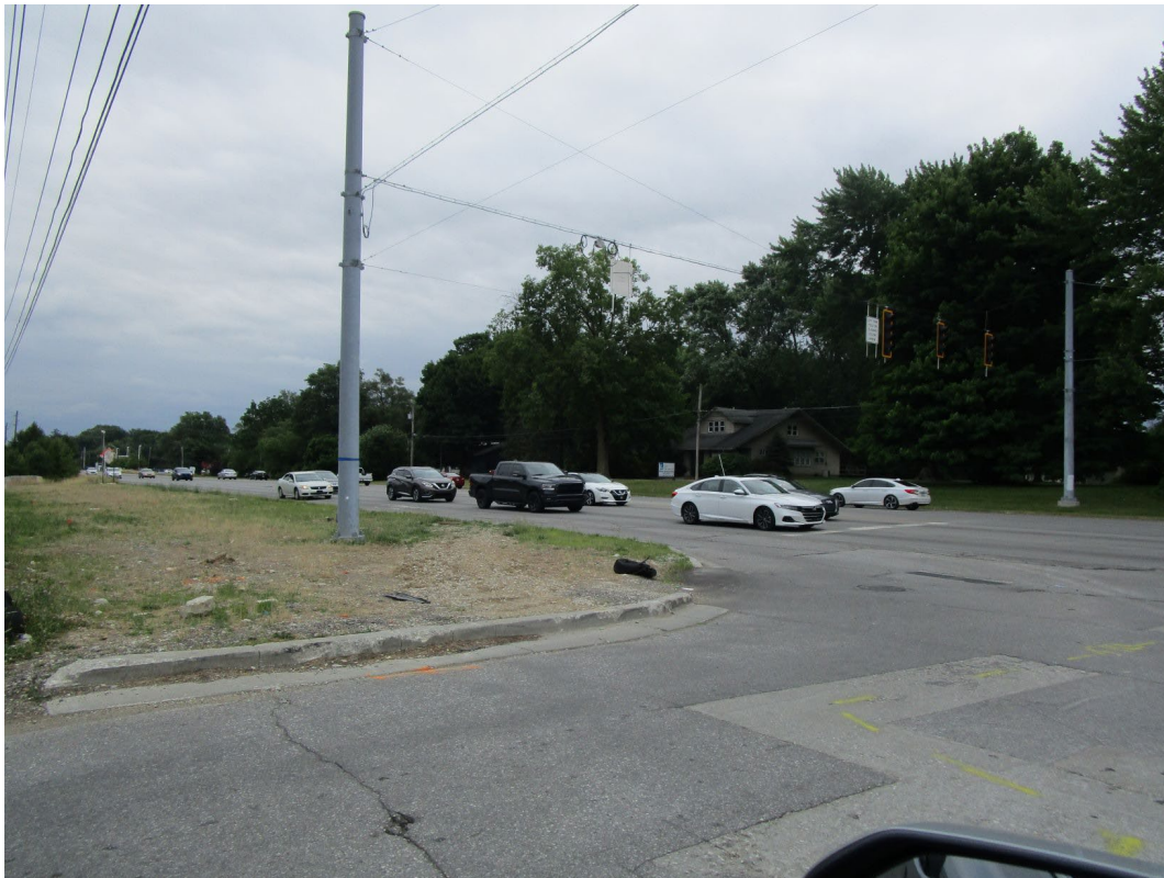
View of site looking southeast across Rockville Road