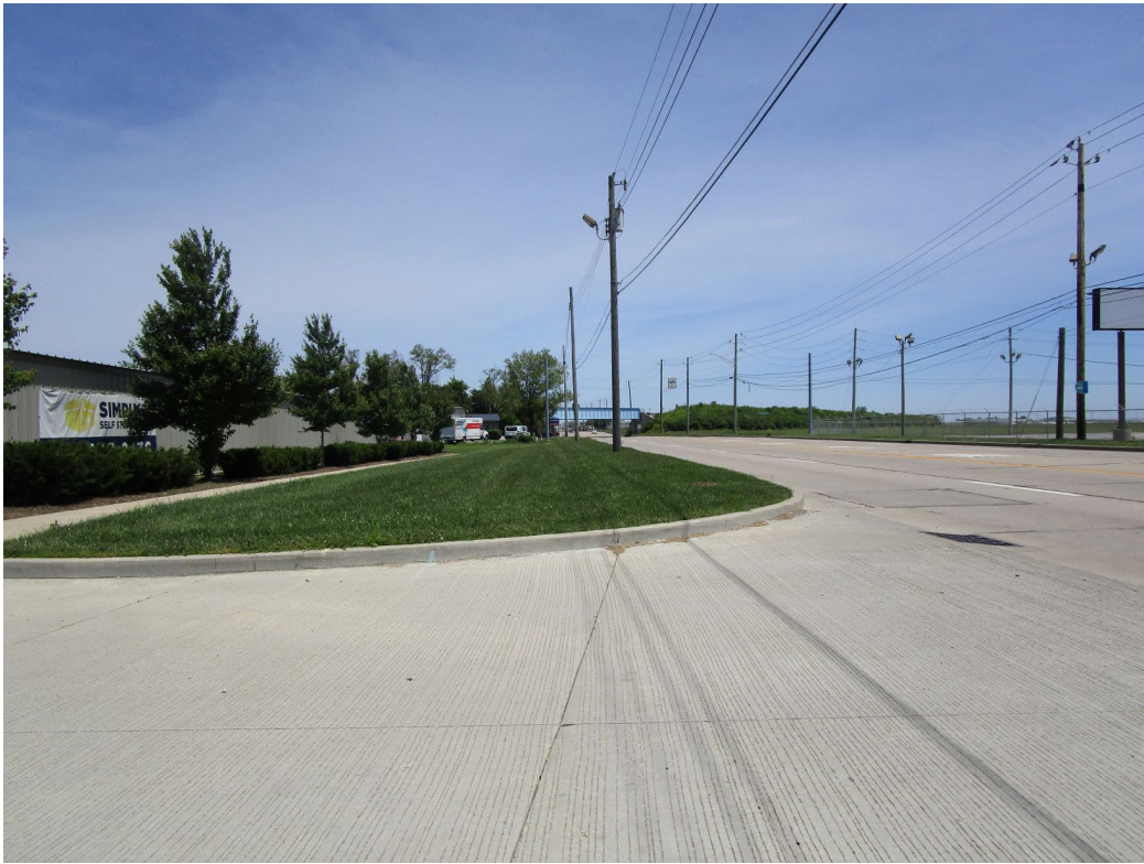
View looking east along West Washington Street