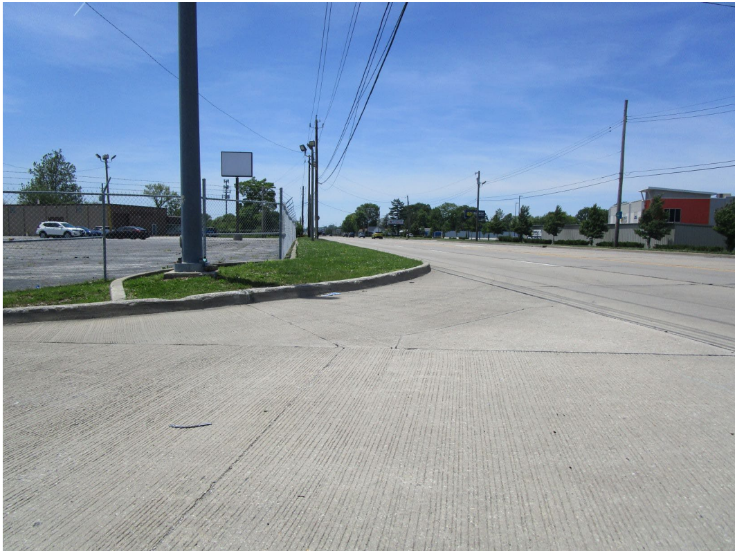
View looking west along West Washington Street