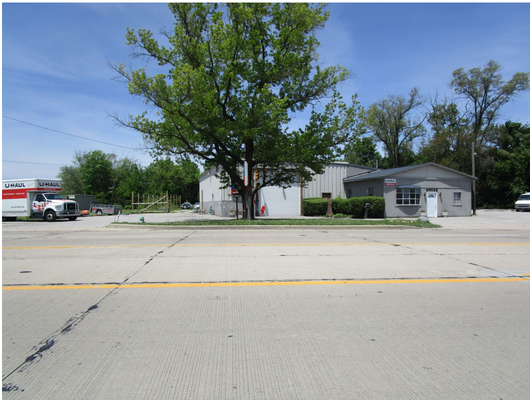
View of site looking north across West Washington Street