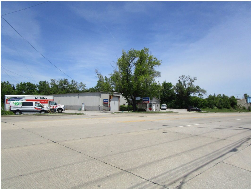
View of site looking northeast across West Washington Street