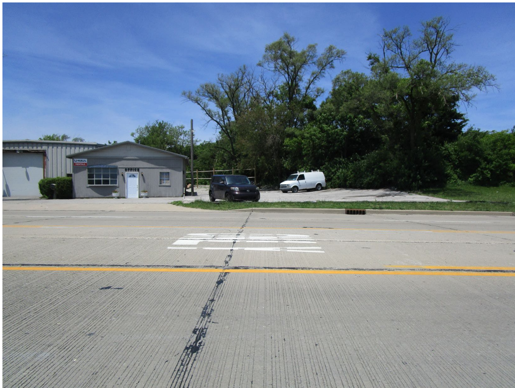
View of site looking north across West Washington Street