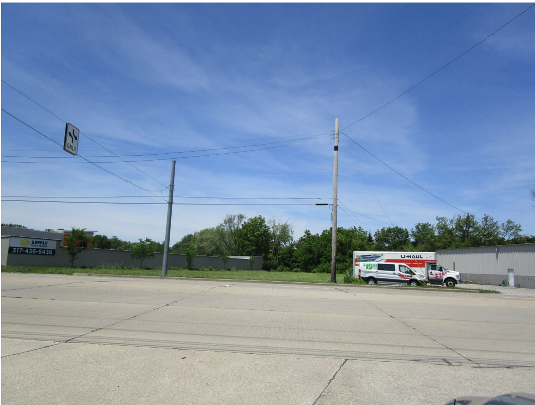
View of site looking north across West Washington Street