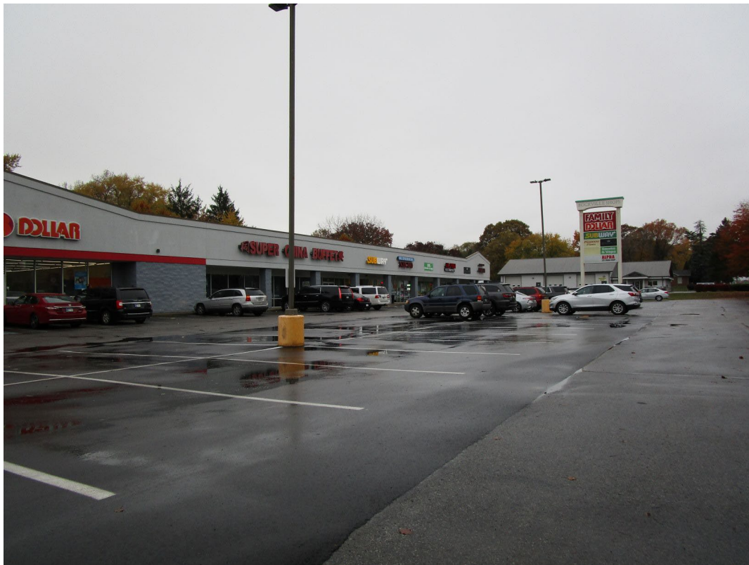
View of site looking southwest