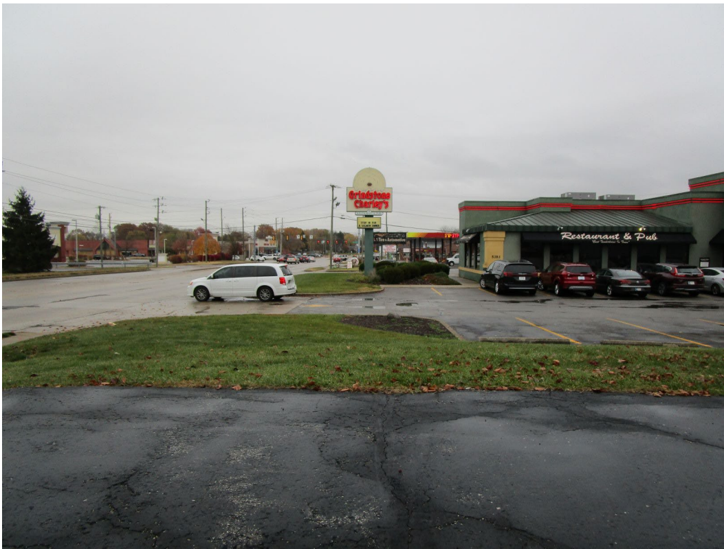
View from site looking east