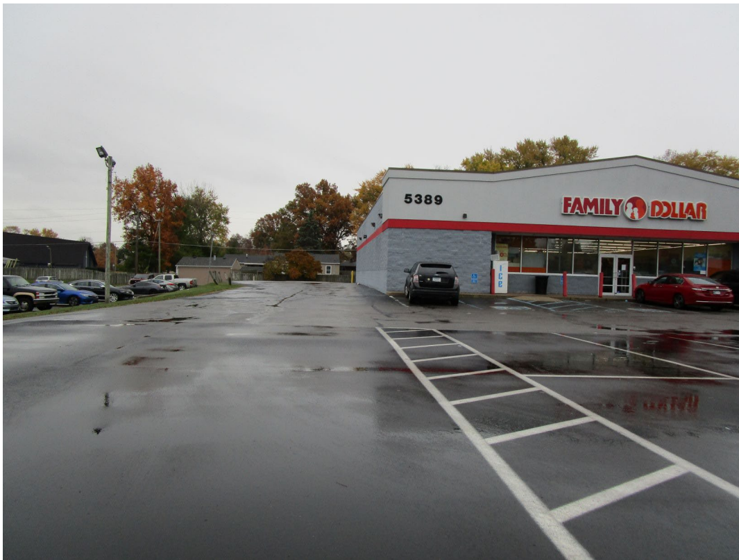
View looking south along the eastern property boundary