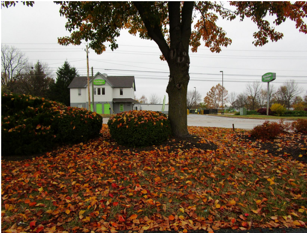
View from site looking north across Rockville