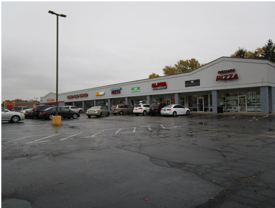
View of site looking southeast