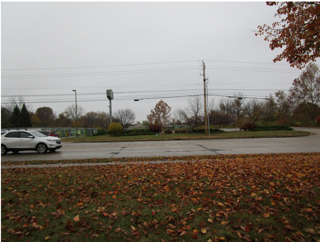
View from site looking north across Rockville