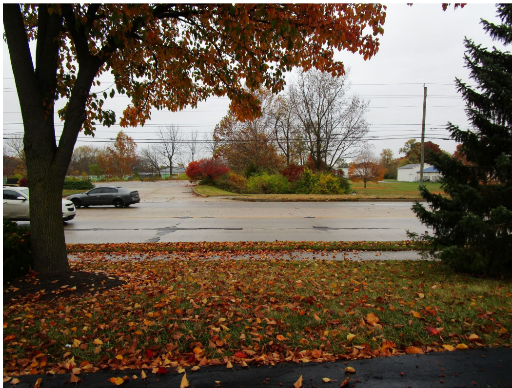
View from site looking north across Rockville