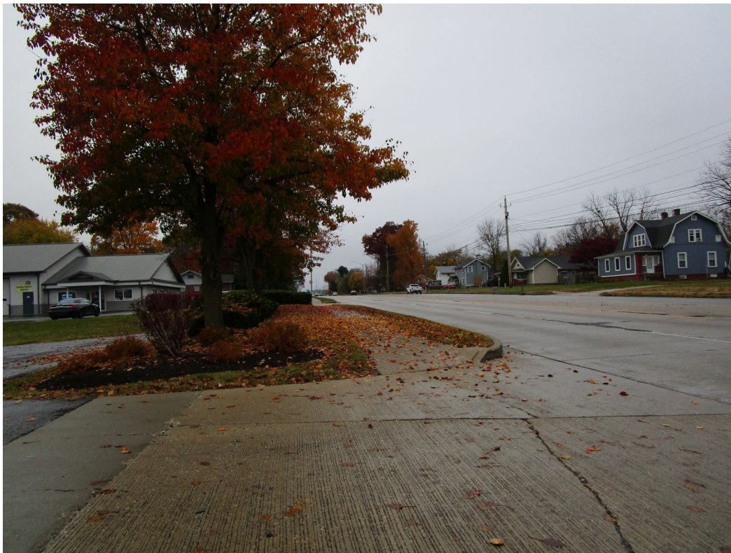
View looking west along Rockville Rpad