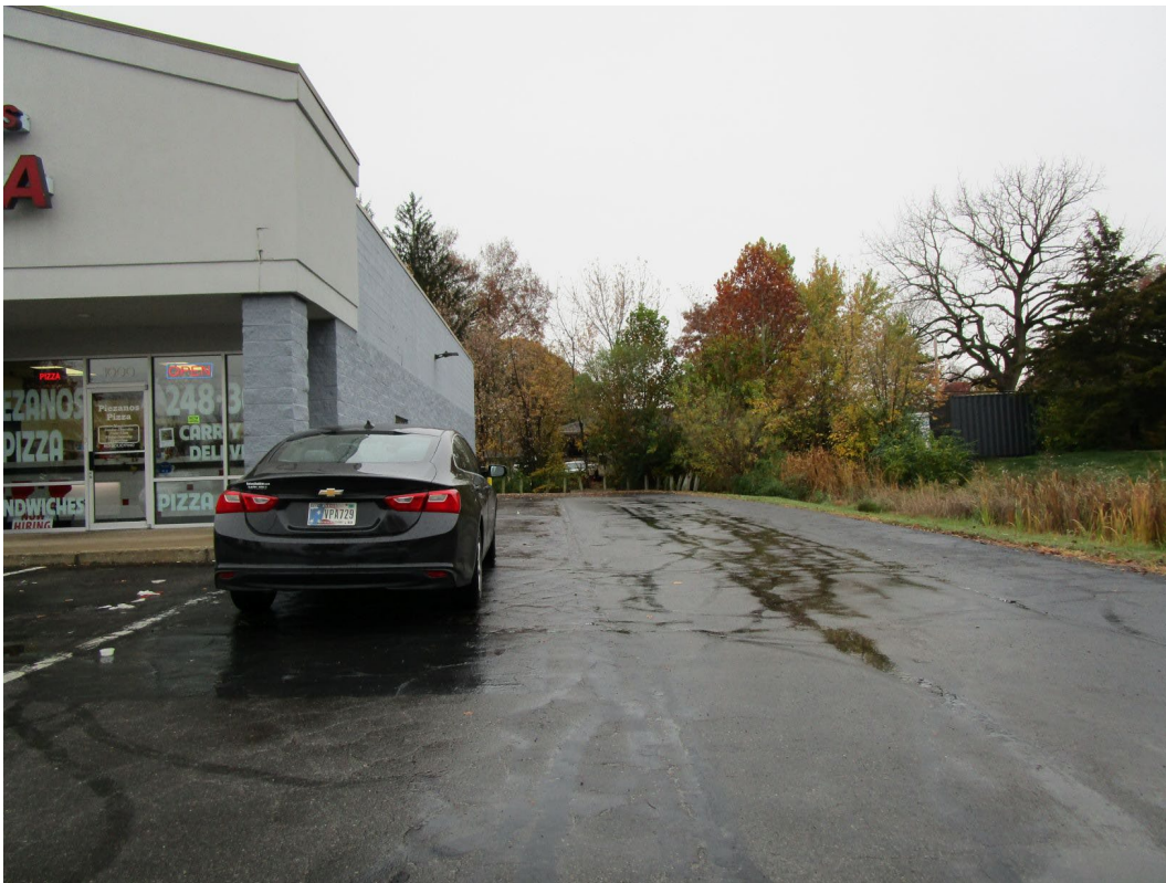
View of site looking along the western property boundary