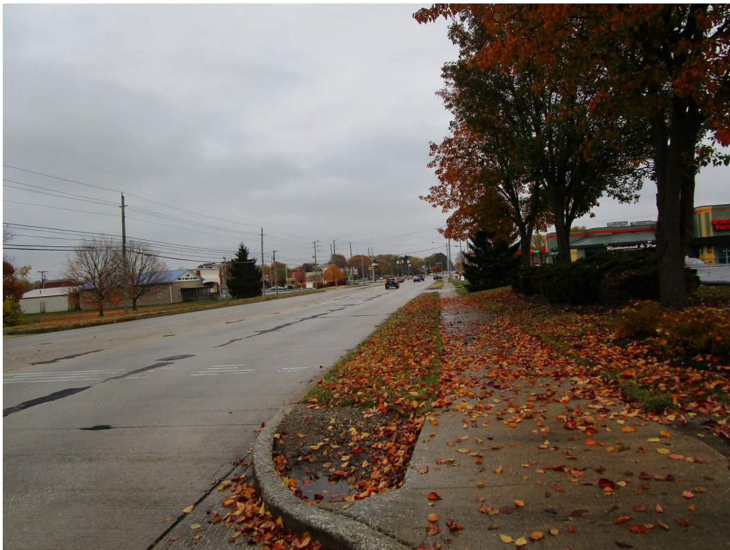
View looking east along Rockville Road