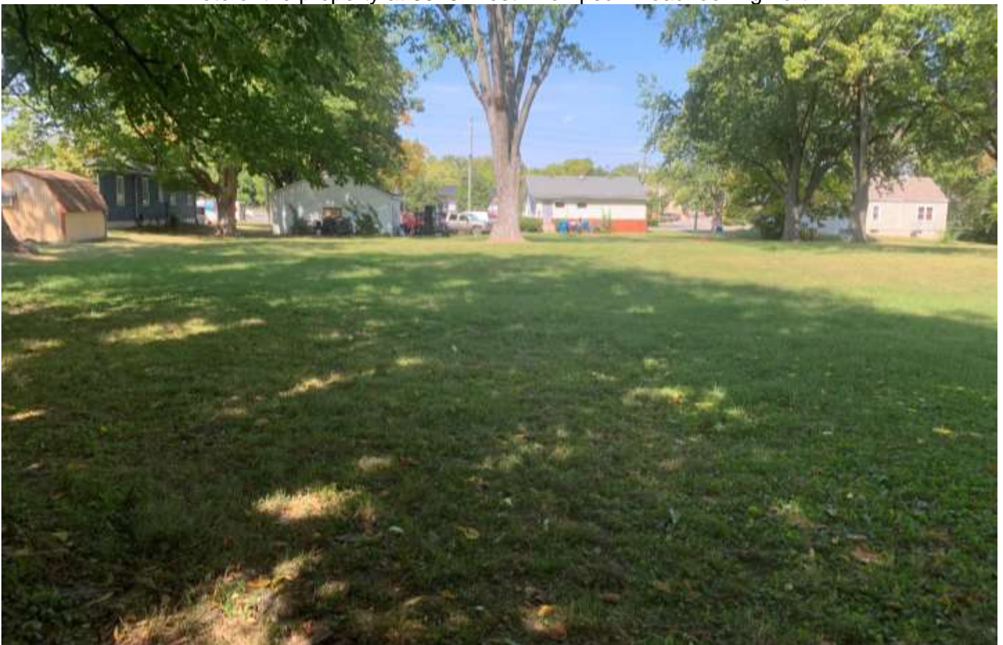
Photo of the property at 6333 West Thompson Road looking north.