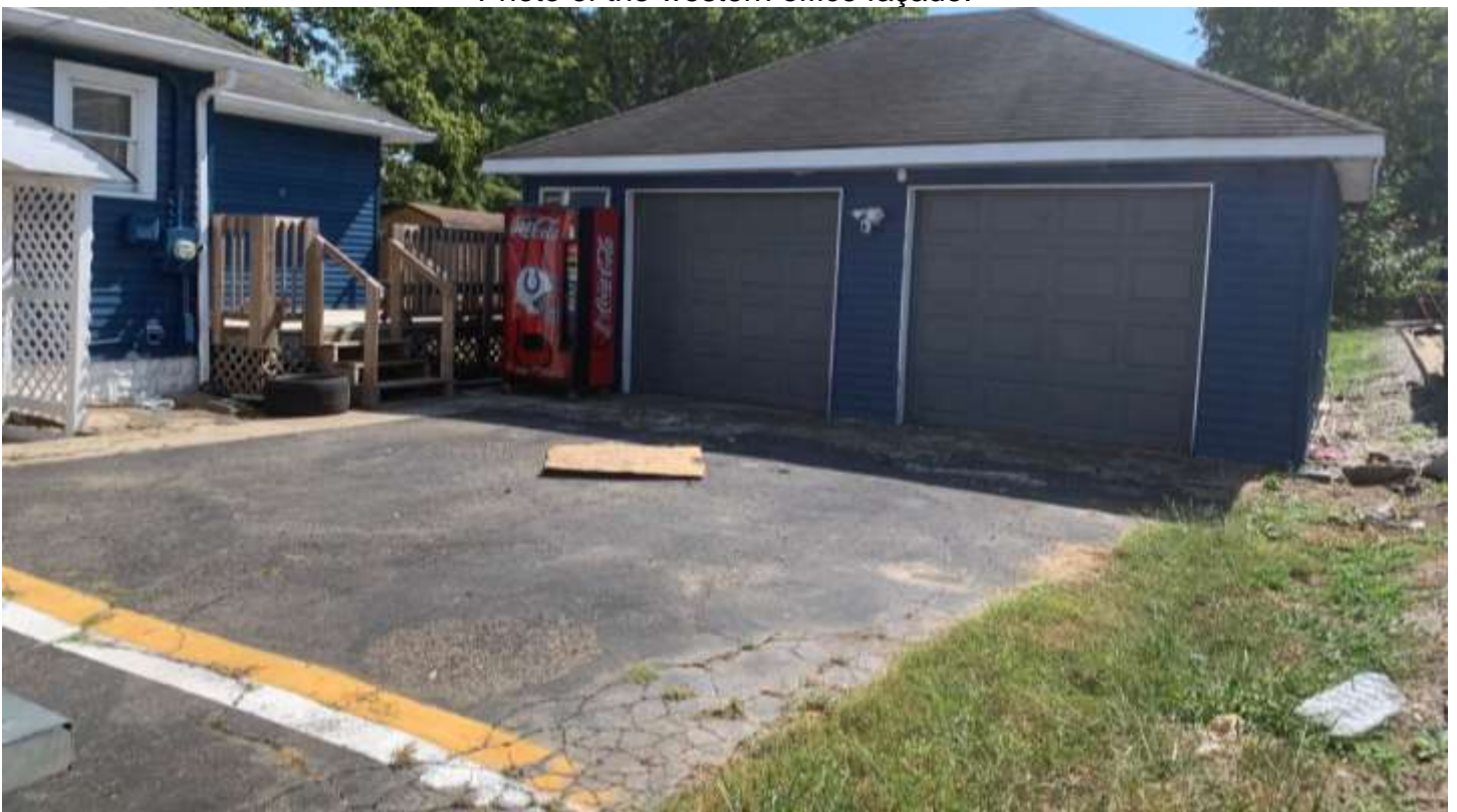
Photo of the existing garage on site.