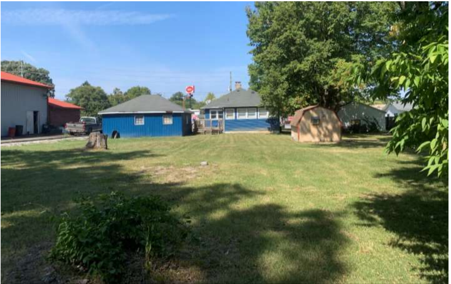
Photo of the property at 6345 West Thompson Road looking north.