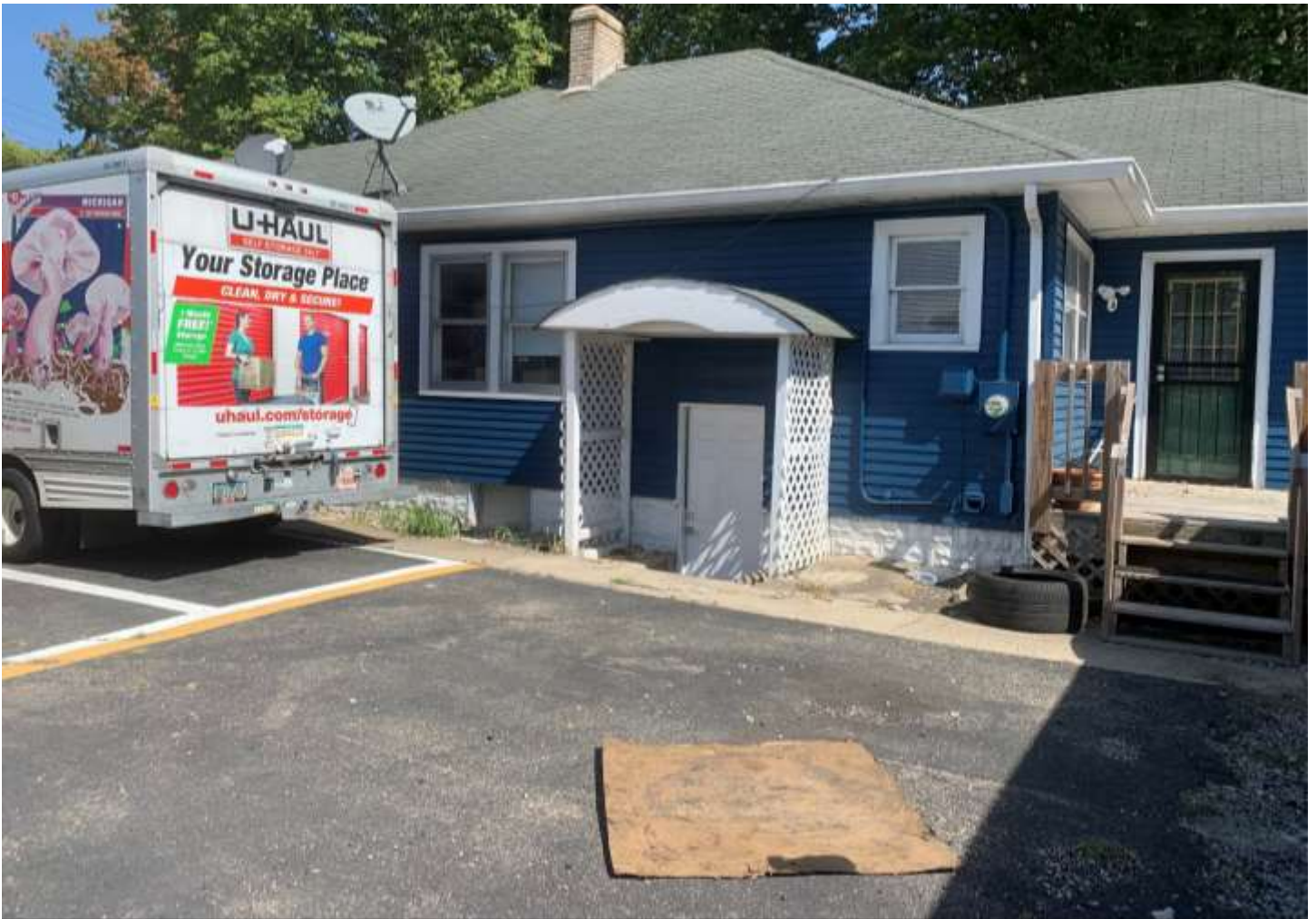
Photo of the western office façade.