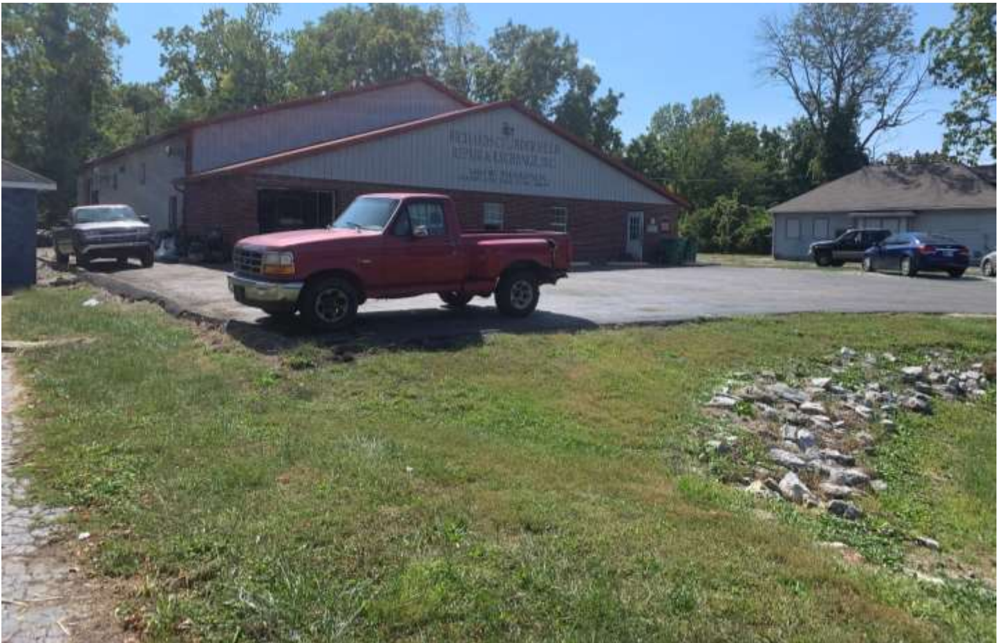
Photo of the commercial property west of the site.