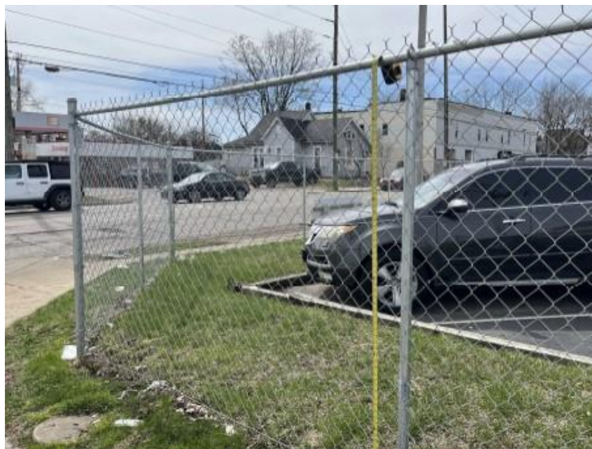
Photo 8: Prospect/Keystone Clear-Sight Area Viewed from Northeast (January 2025)