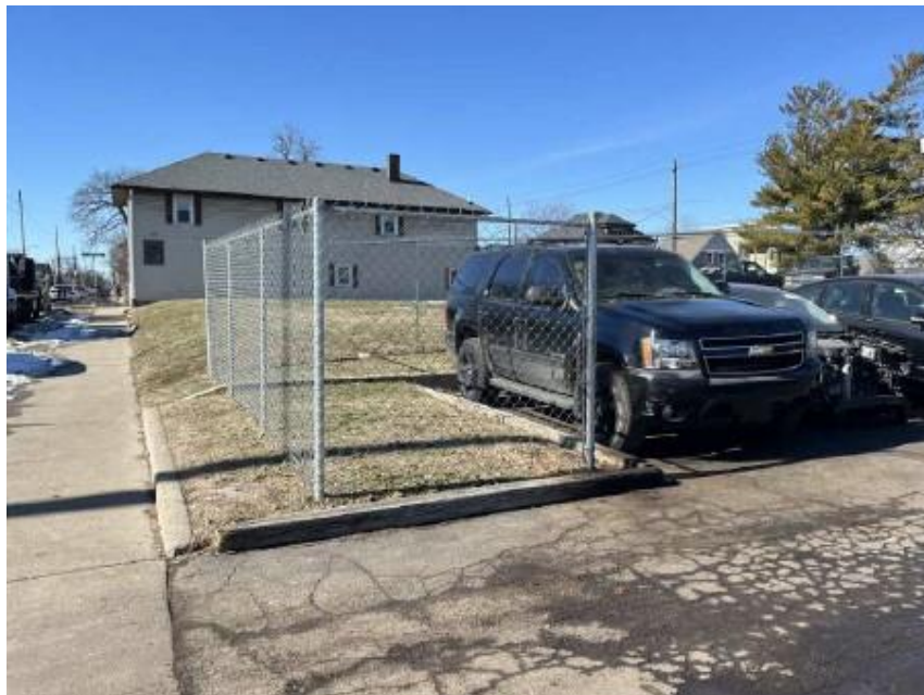
Photo 10: Fence from Prospect Driveway Looking West (January 2025)