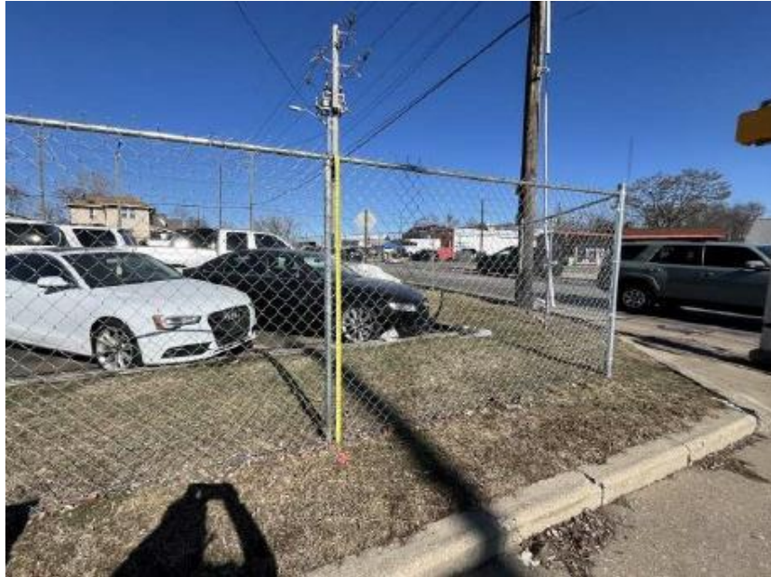
Photo 7: Prospect/Keystone Clear-Sight Area Viewed from Southwest (January 2025)