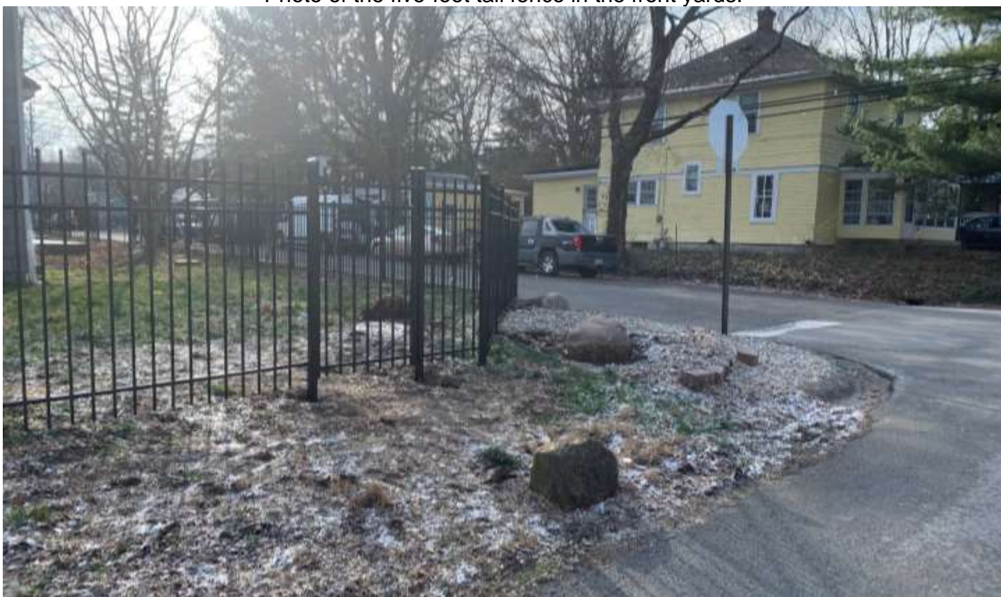
Photo of the fence in the clear sight triangle.