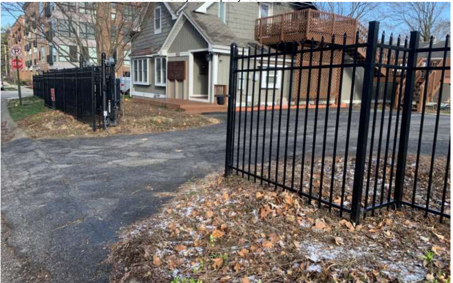
Photo of the automated gate along 66 th Street.