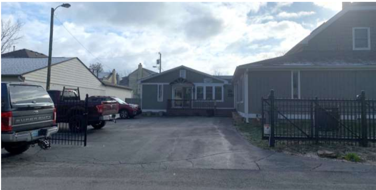
Photo of the other office on site and second parking lot.