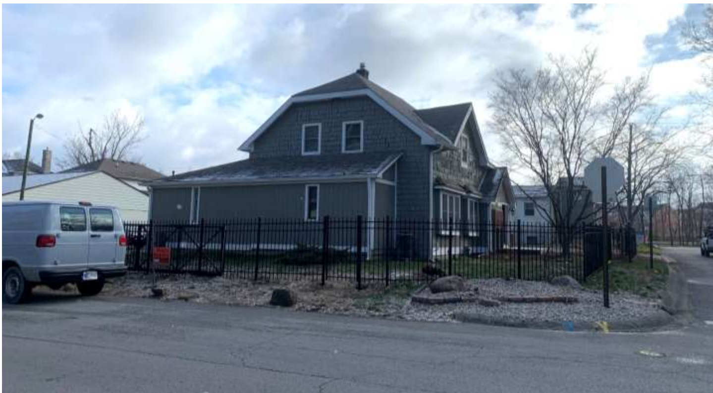
Photo of the five-foot tall fence in the front yards.