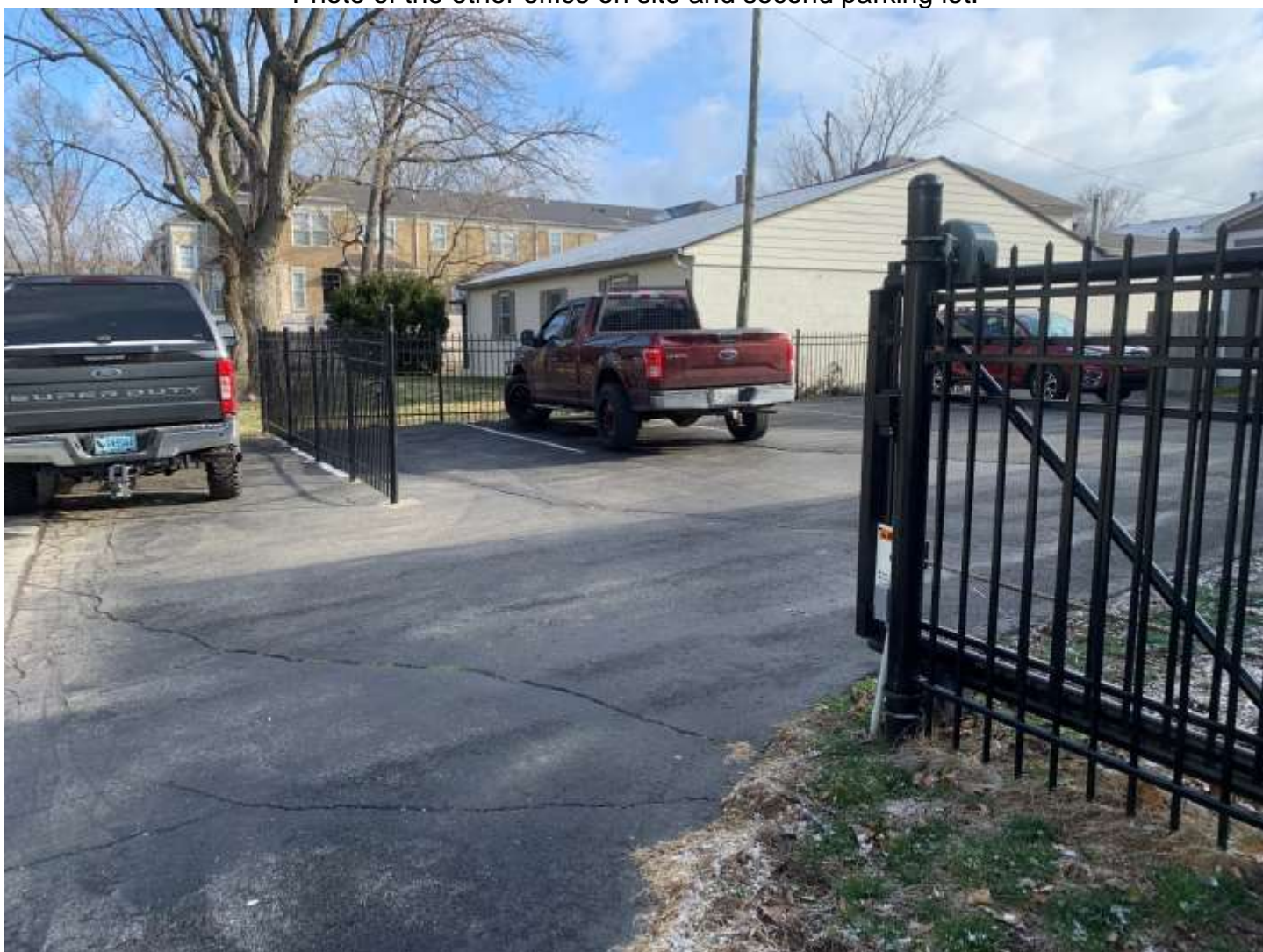
Photo of the automated gate along Ferguson Street.