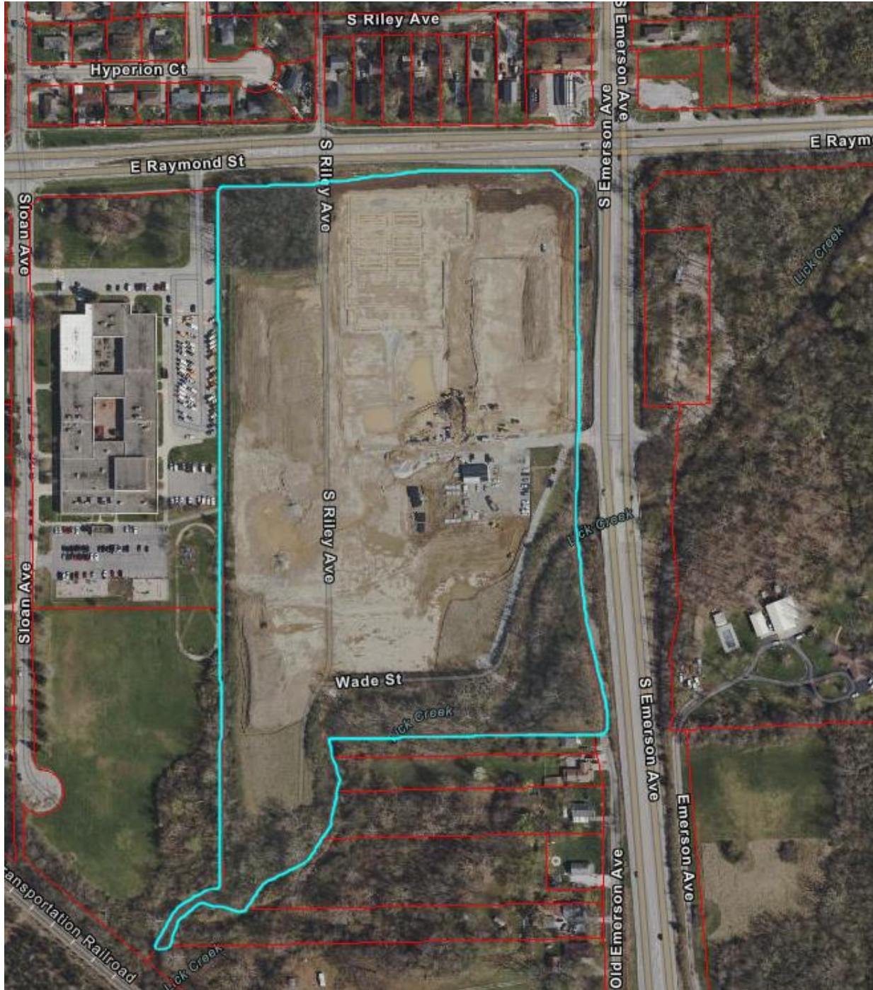
Note: aerial image taken prior to completion of animal care facility