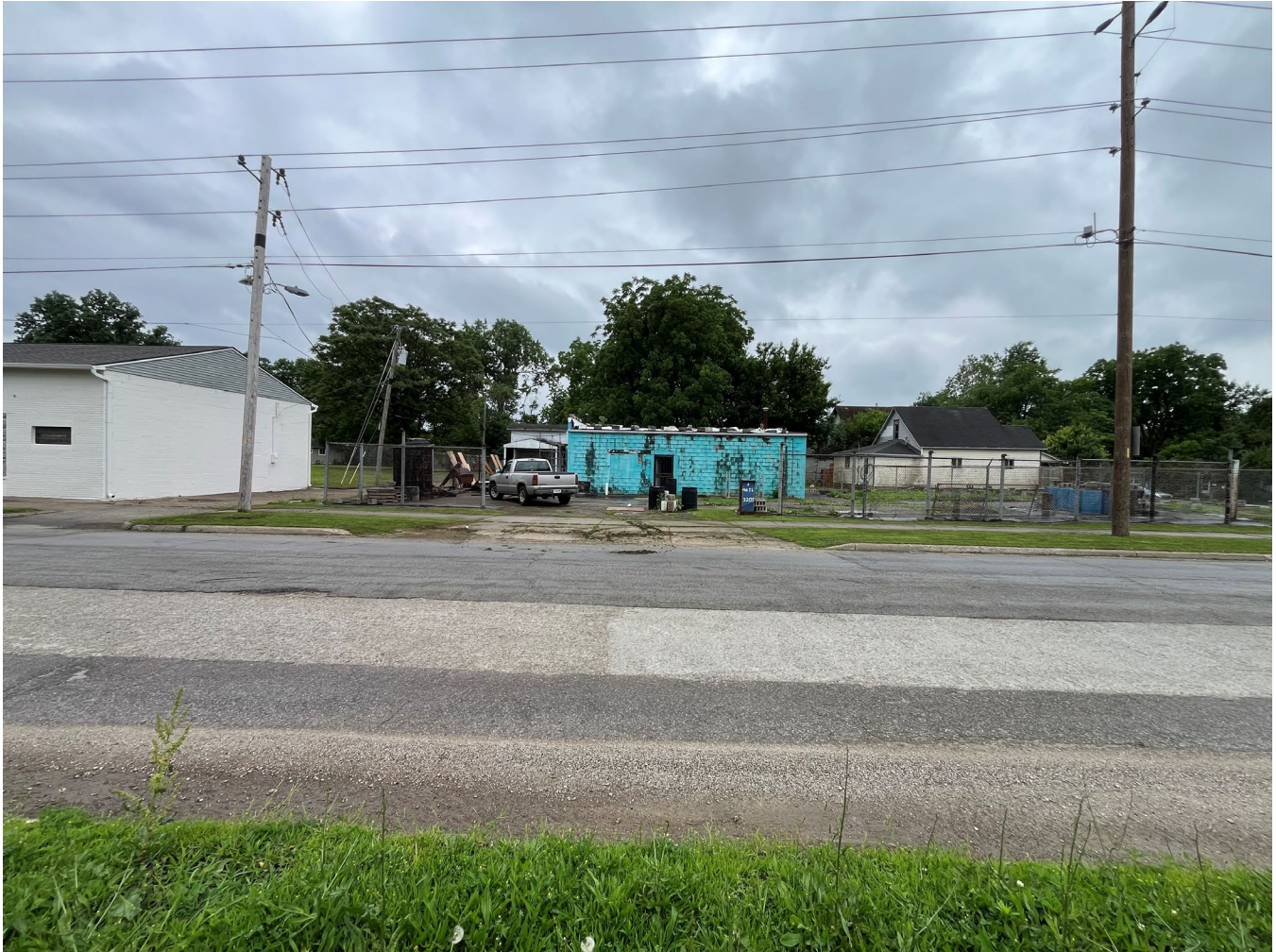
Photo 4: View of commercial building across 25 th Street to the south.