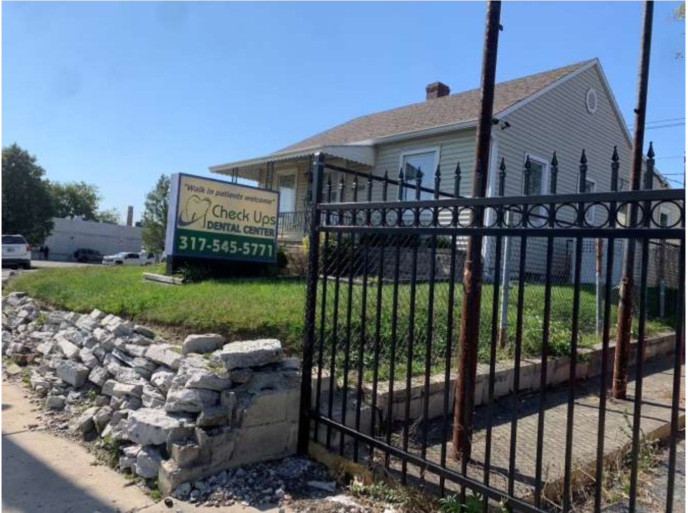
Photo of the dentist office south of the site zoned C-3.