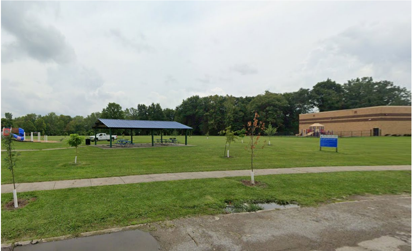
Photo of the existing park and school looking east.