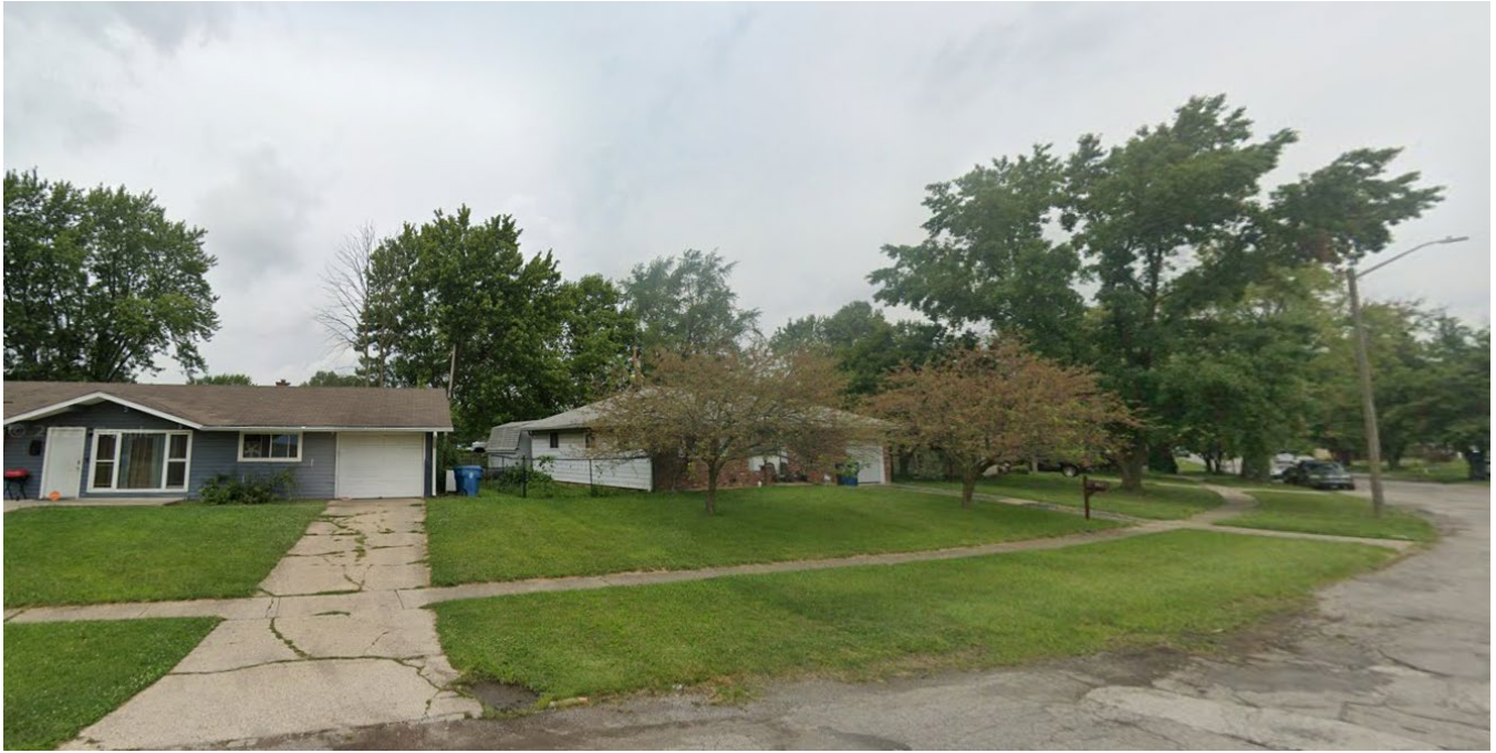
Photo of the single-family dwellings west of the site.