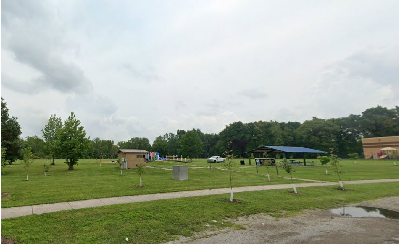
Photo of the exiting park looking southeast.