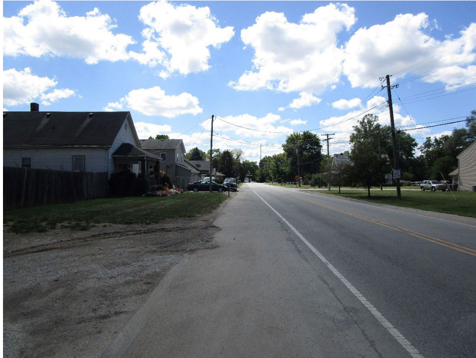
View looking south along South Tibbs Avenue