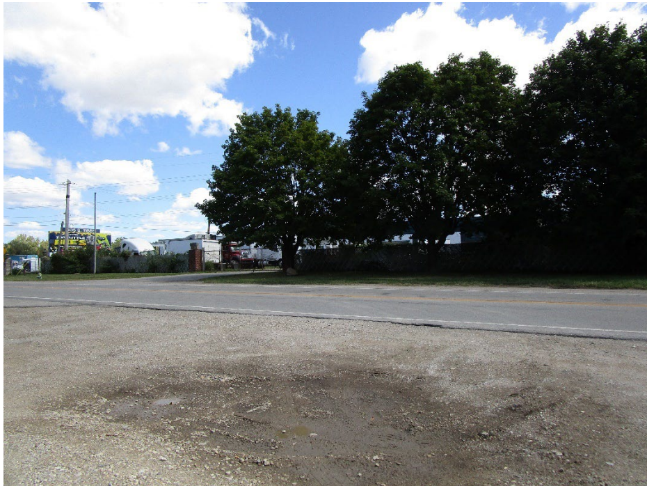
View looking northeast across South Tibbs Avenue at adjacent property to the north