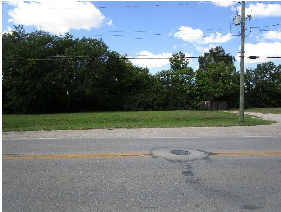
View from site looking west across South Tibbs Avenue