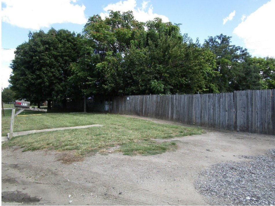
View of site looking northeast