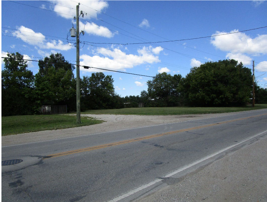
View from site looking northwest across South Tibbs Avenue