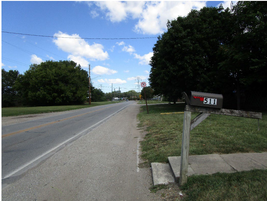
View looking north along South Tibbs Avenue