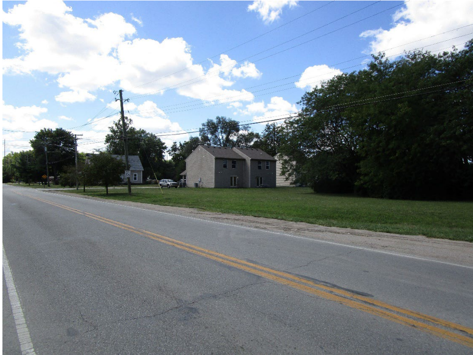
View from site looking southwest across South Tibbs Avenue