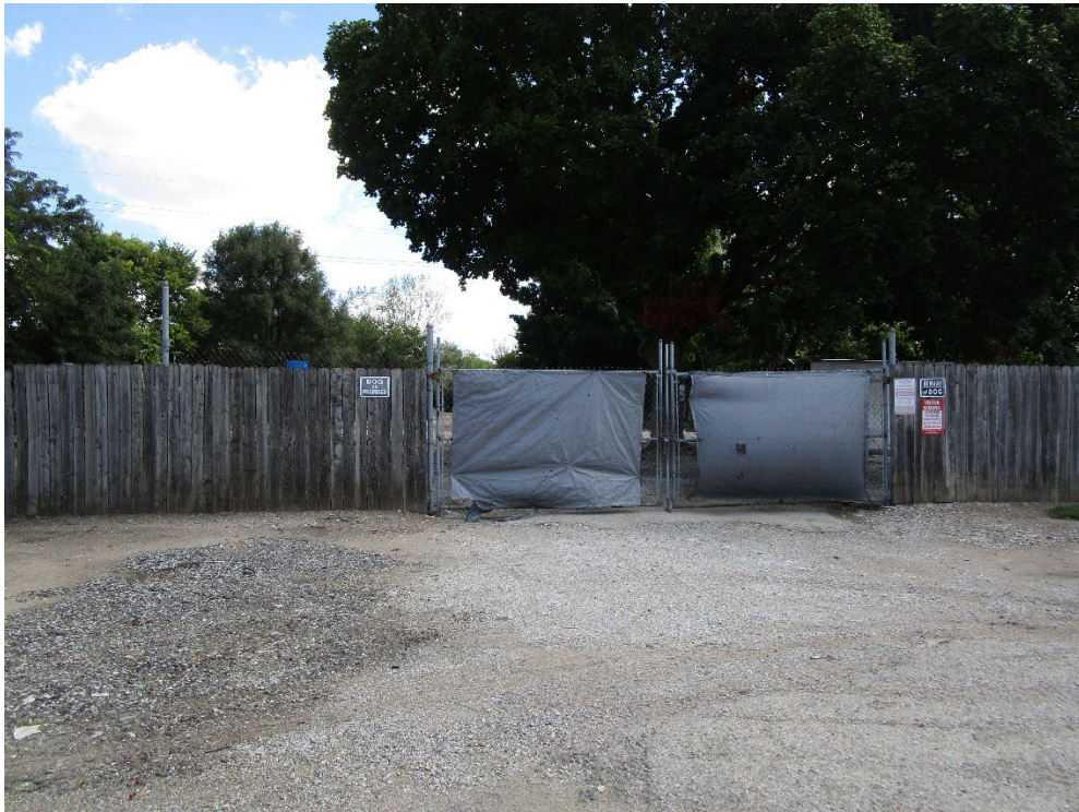
View of site looking west at entrance