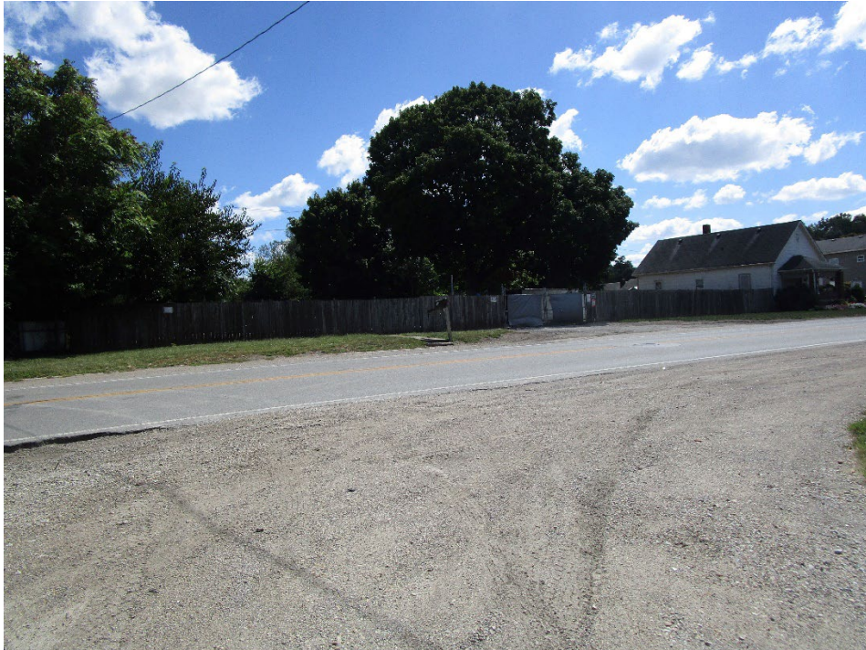
View of site looking southeast across South Tibbs Avenue