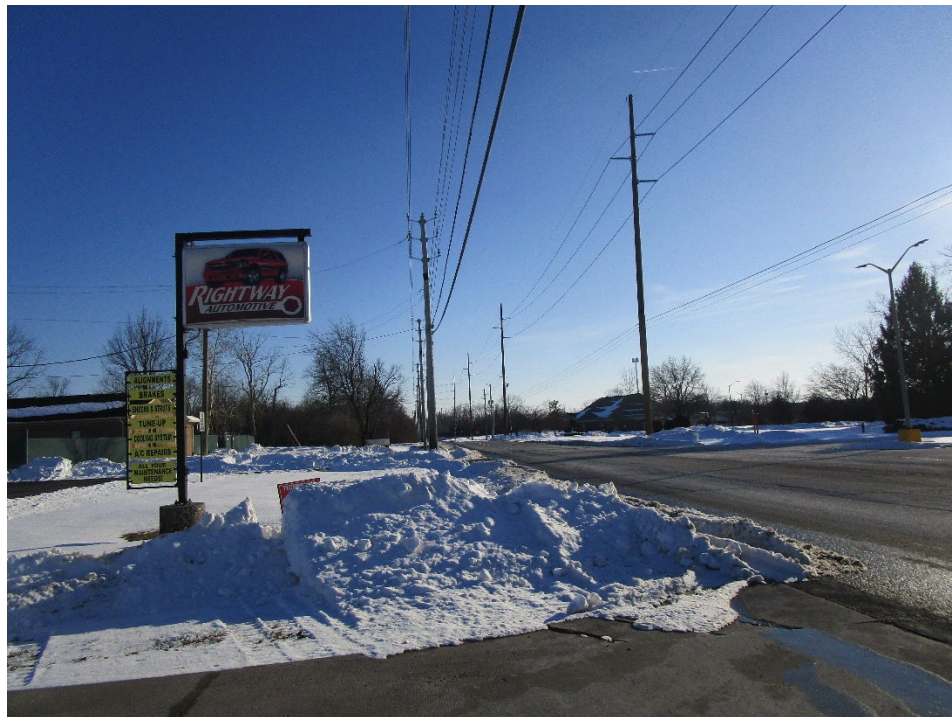
View of site looking south along South Shortridge Road