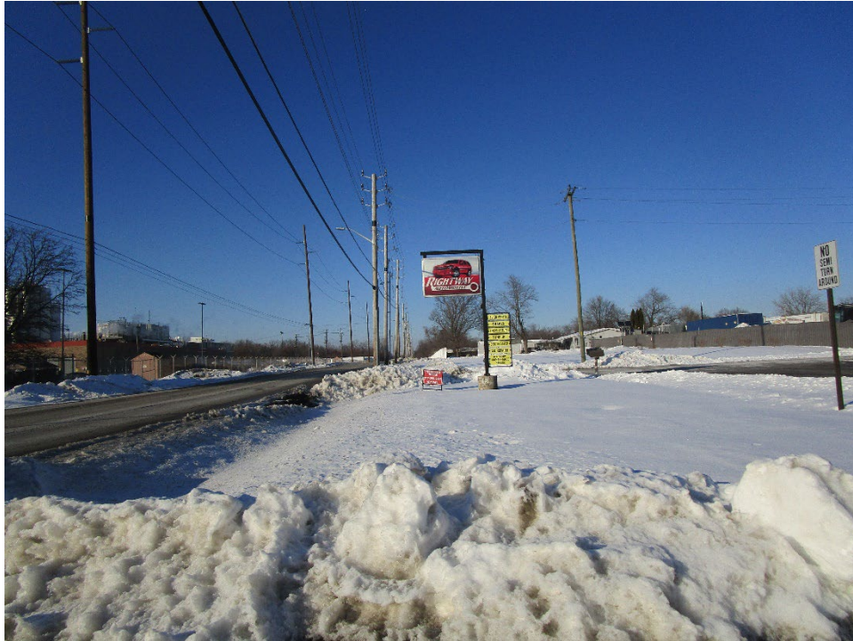
View of site looking north along South Shortridge Road