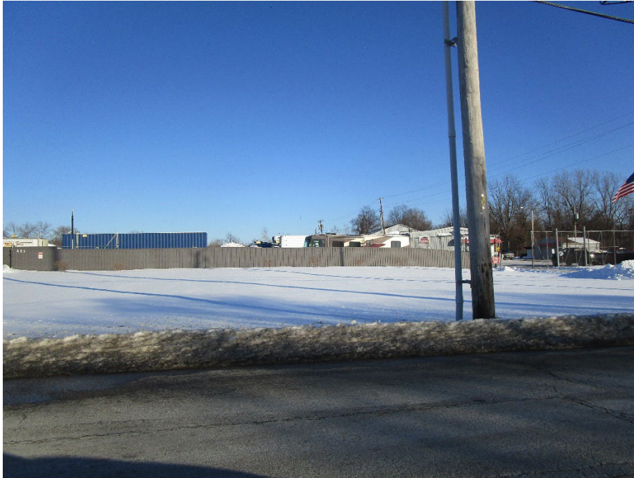
View of site looking east across South Shortridge Road