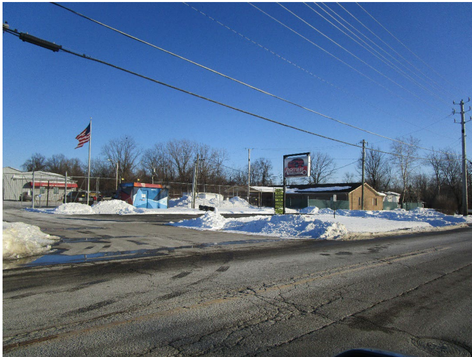
View of site looking southeast across South Shortridge Road