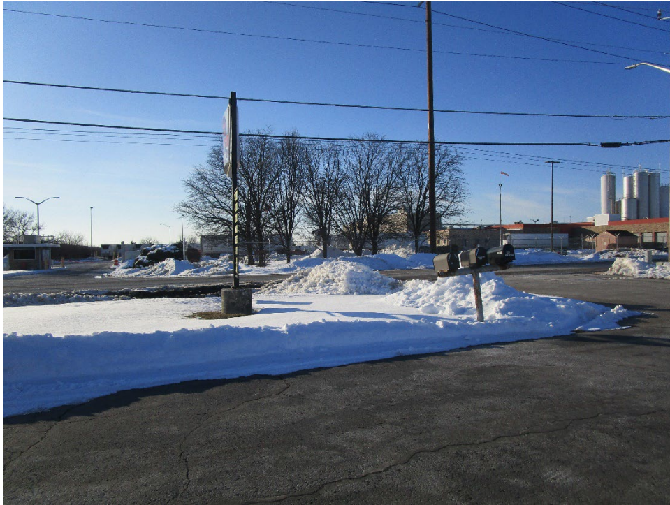
View from site looking west across South Shortridge Road