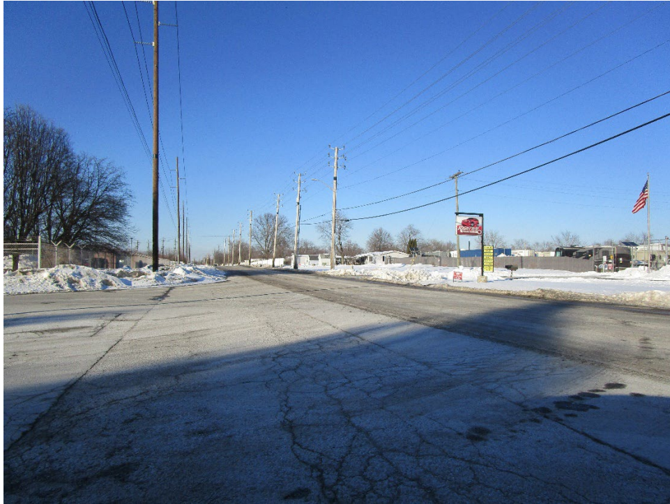
View looking north along South Shortridge Road