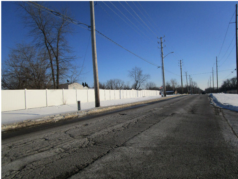
View looking south along South Shortridge Road