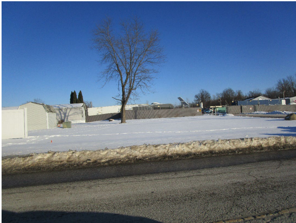
View of site looking east across South Shortridge Road