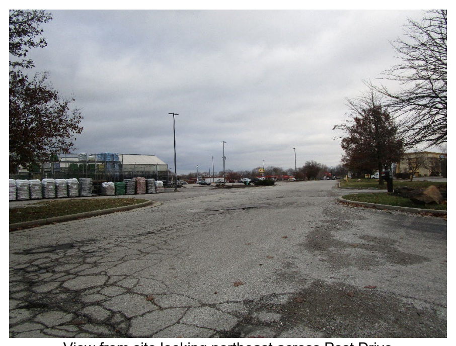
View from site looking northeast across Post Drive