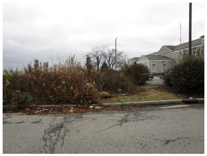
View of site looking south across Post Drive