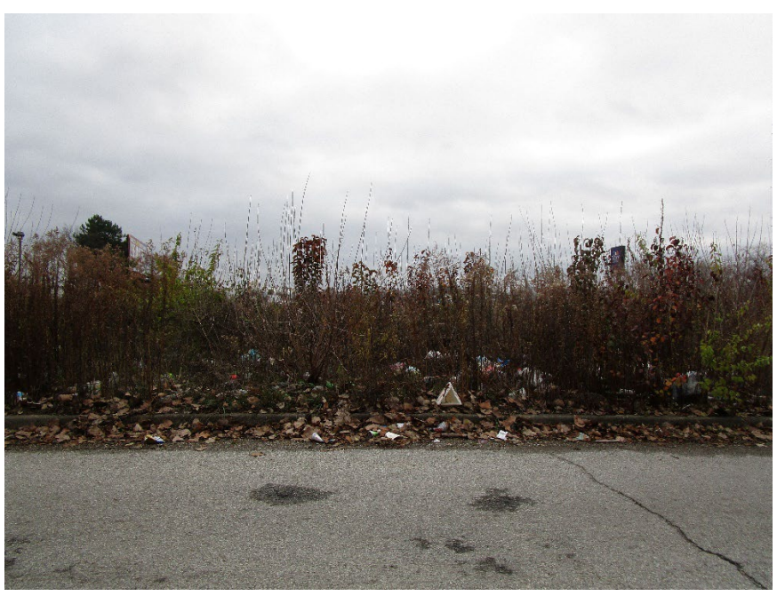
View of site looking south across Post Drive