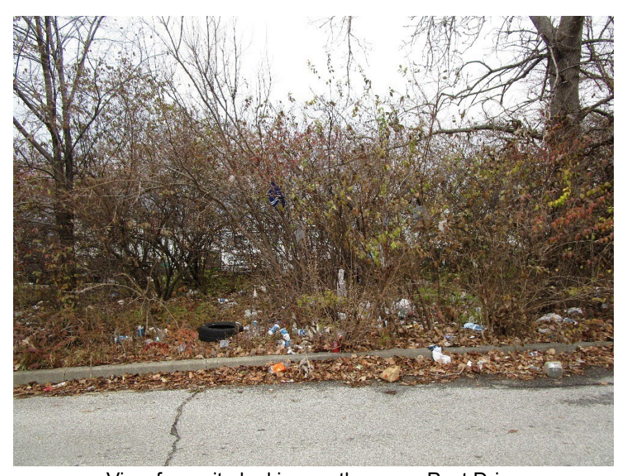
View from site looking north across Post Drive