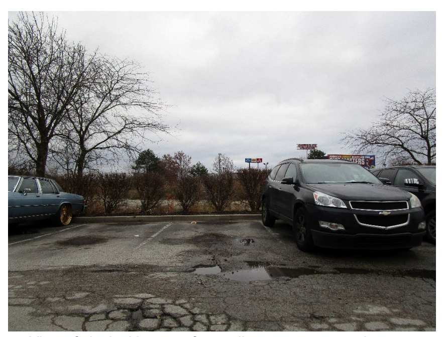
View of site looking east from adjacent property to the west