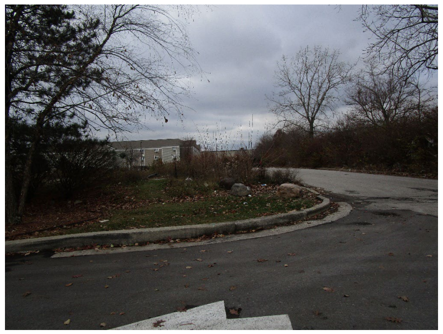
View looking west along Post Drive