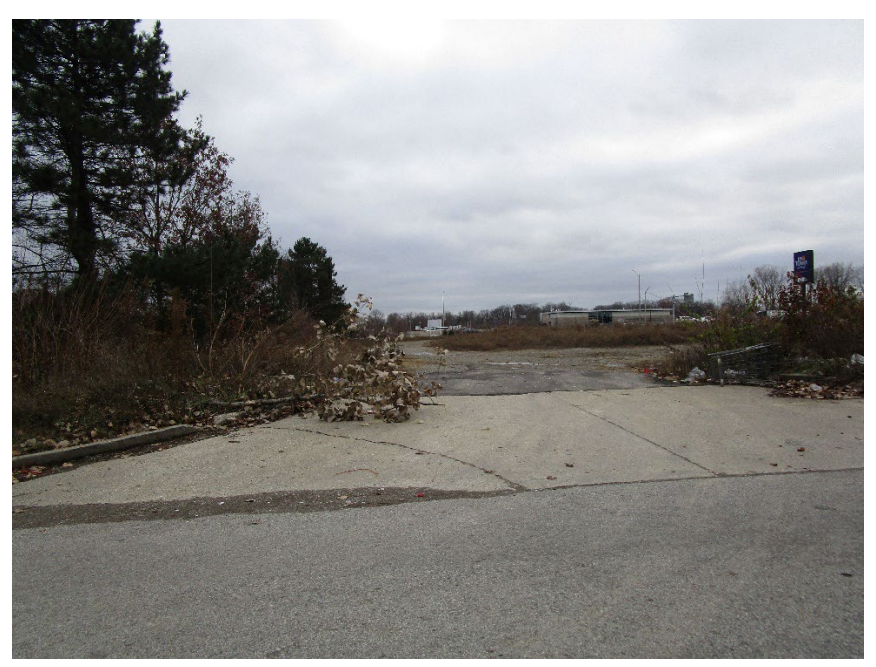
View of site looking south across Post Drive