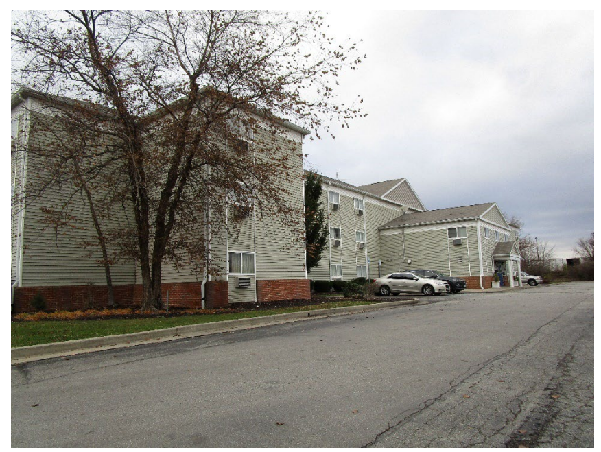
View from site looking northwest at adjacent use to the west