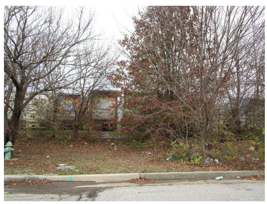
View from site looking north across Post Road