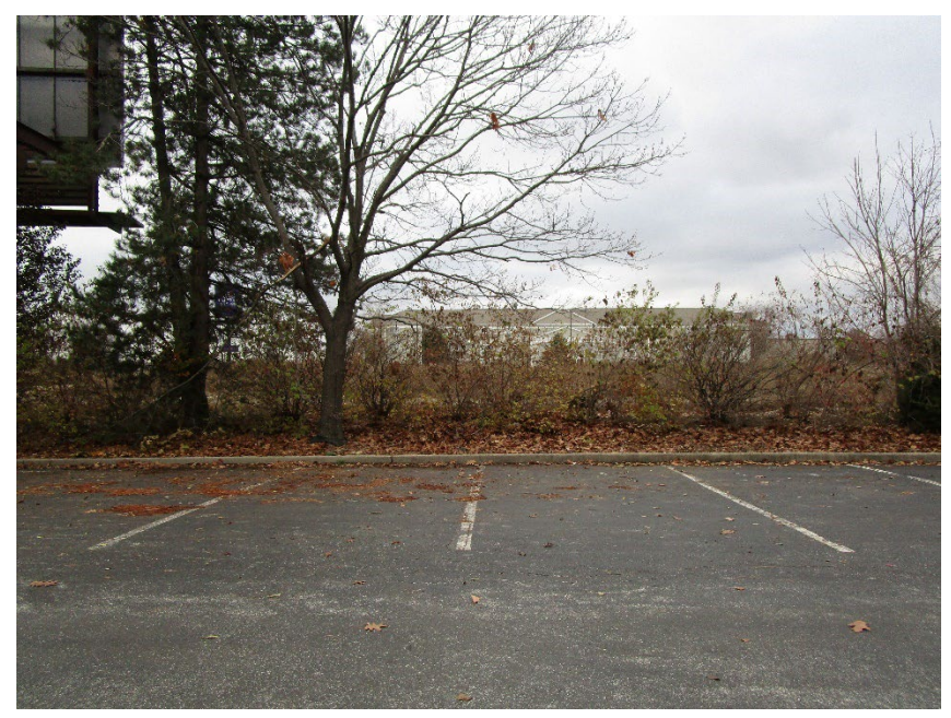
View from site looking west from adjacent property to the east