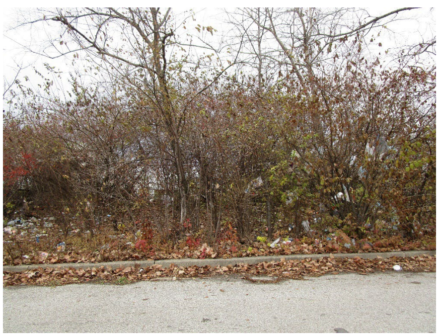
View from site looking north across Post Drive