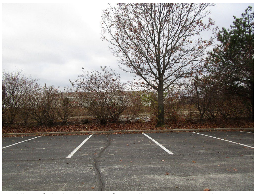
View of site looking west from adjacent property to the east