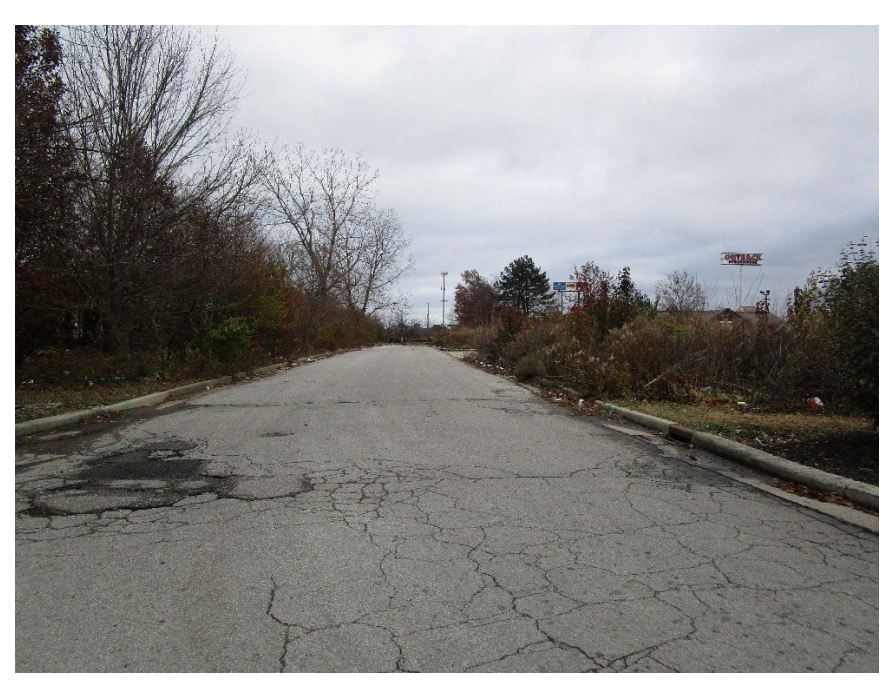
View looking east along Post Drive