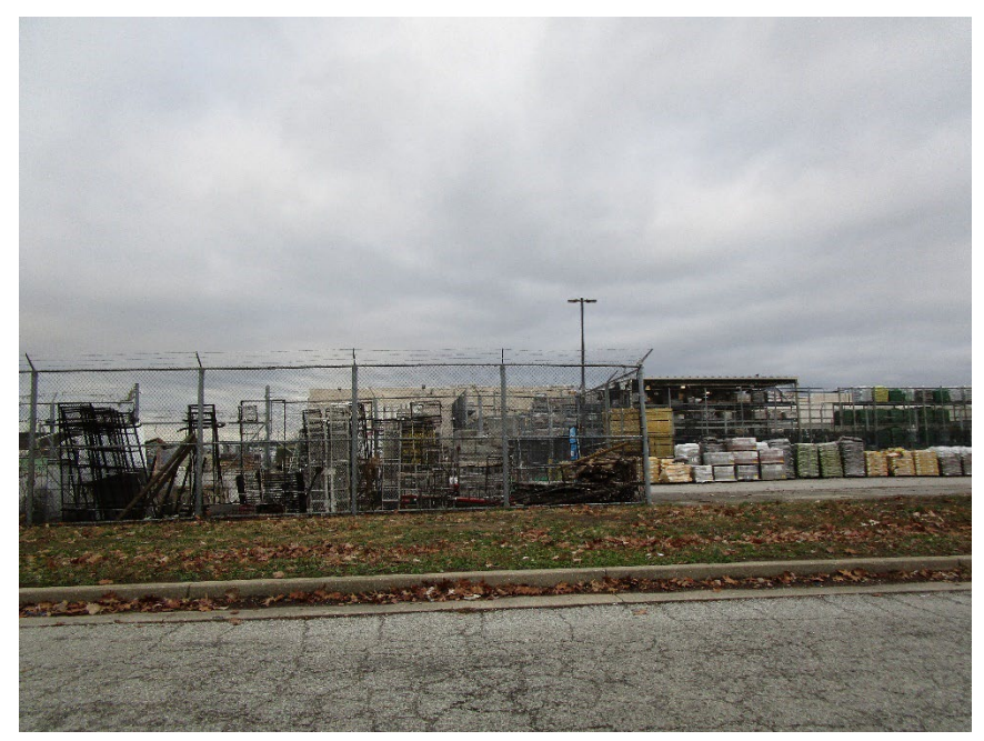
View from site looking north across Post Drive