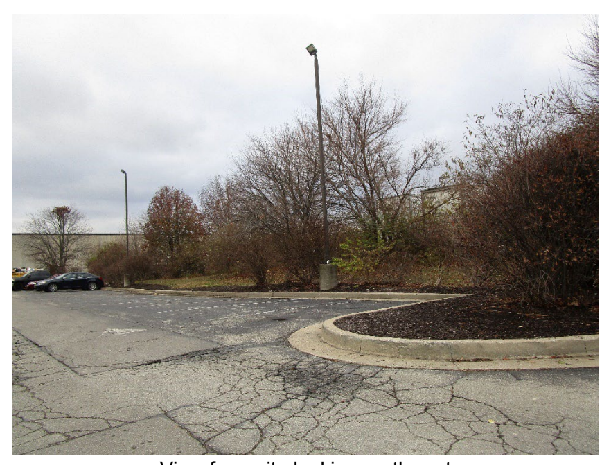
View from site looking northwest