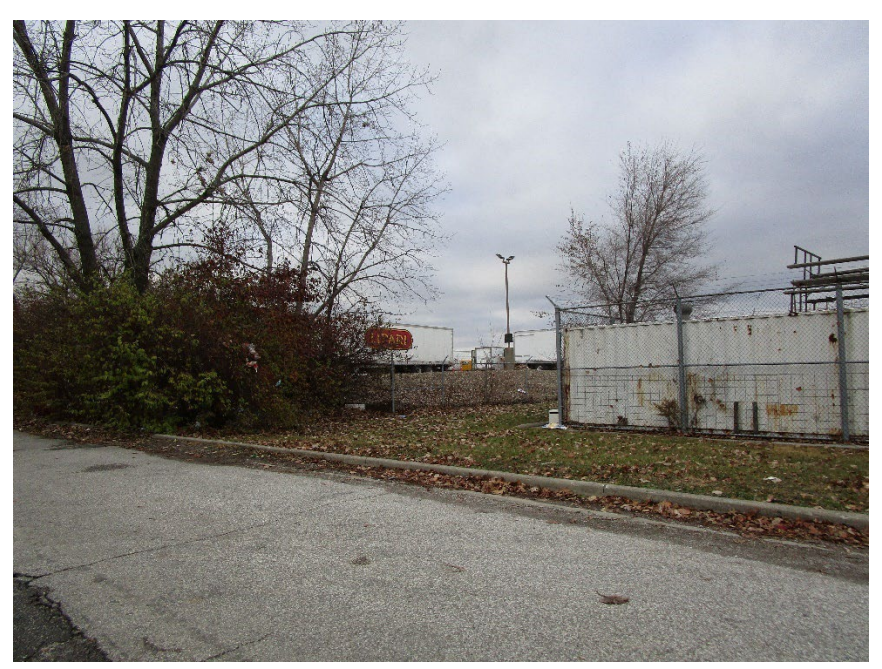
View from site looking northwest across Post Drive