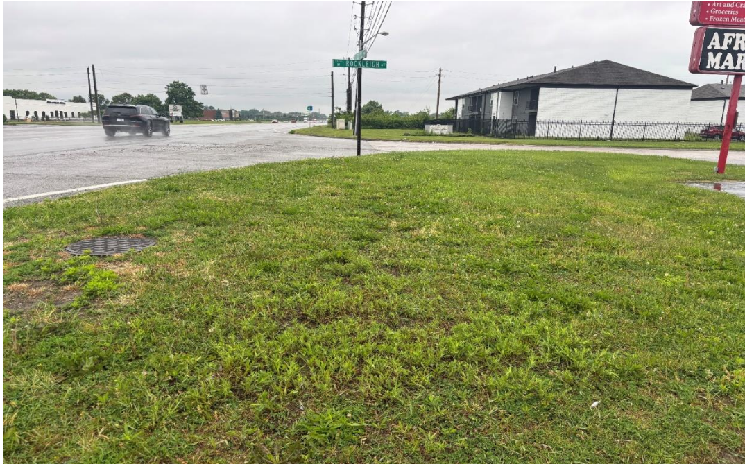
Looking at the intersection between Rockville Road and Rockleigh Avenue.