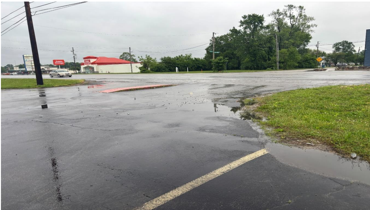
Looking at entrance Rockville Road from subject property