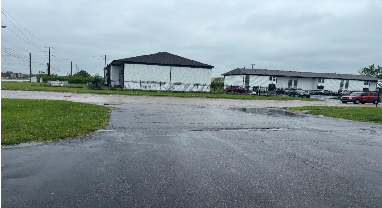
Looking at Rockleigh Avenue from subject property