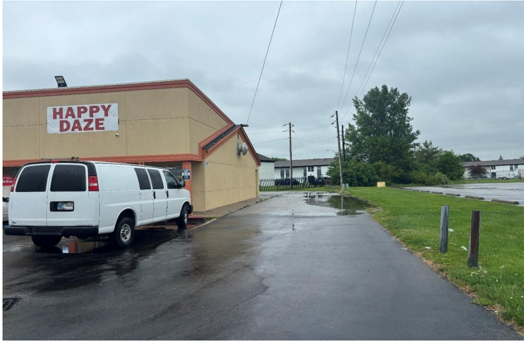
Looking the tenant building Sign