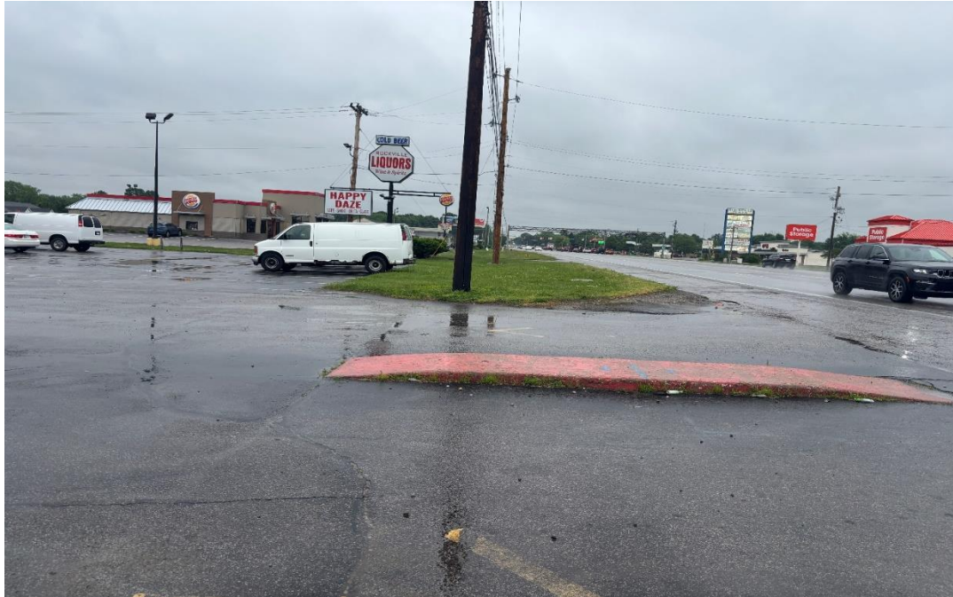
Looking west on Rockville Road from Subject site