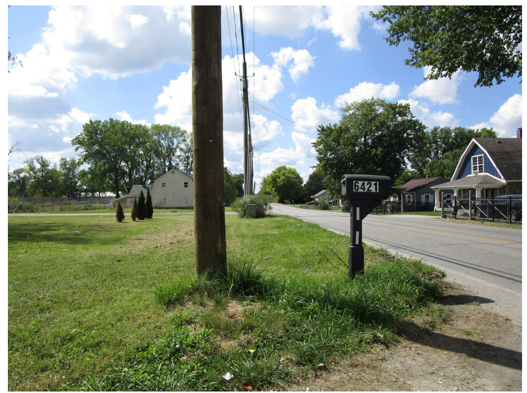
View looking west along East 34th Street