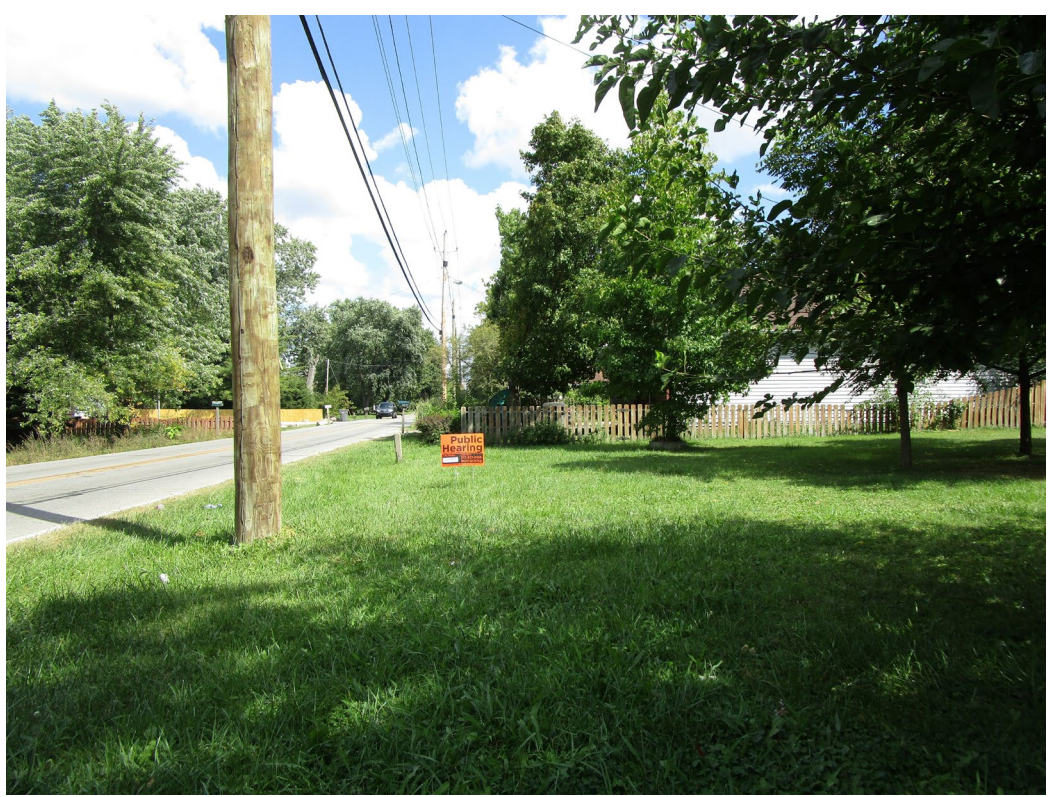
View looking east along East 34<sup>th</sup> Street