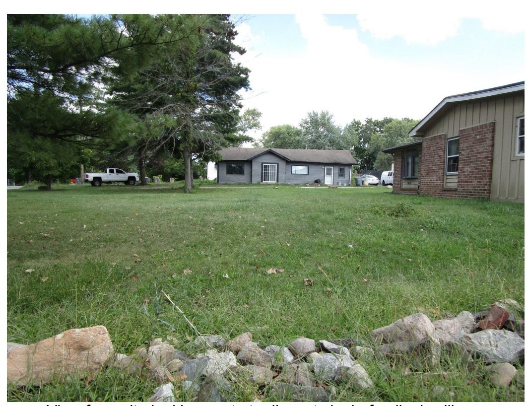
View from site looking east at adjacent single-family dwellings