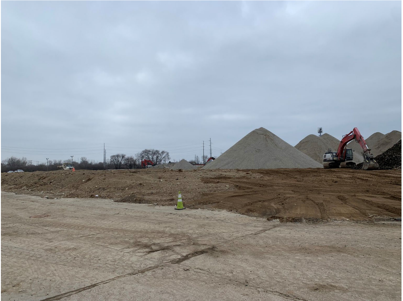
Photo of southeast portion of the subject site from Kentucky Avenue looking northwest