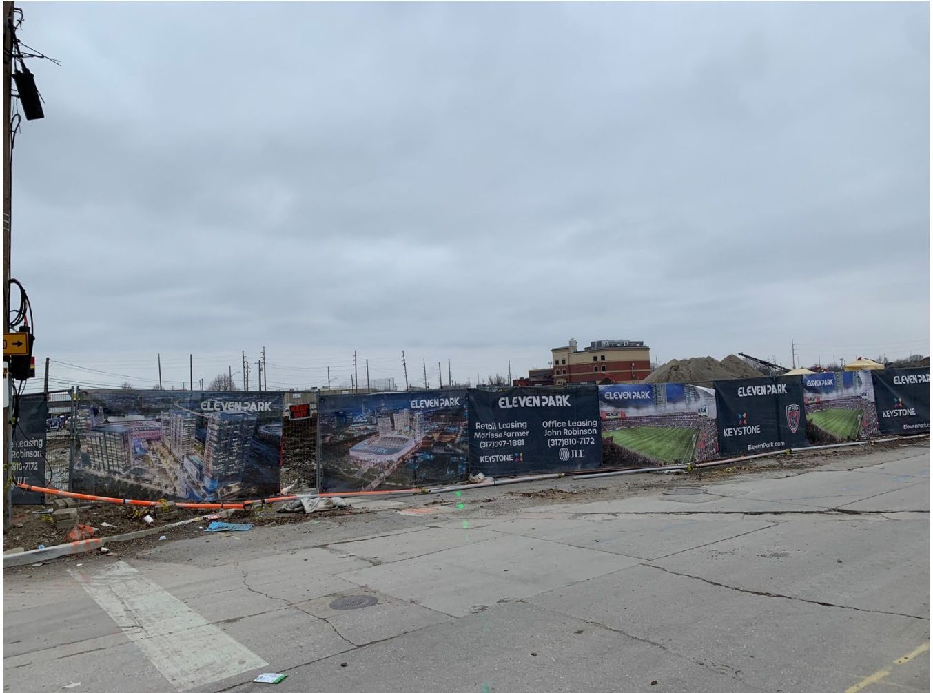
Photo of subject site from Gardner Lane looking southwest