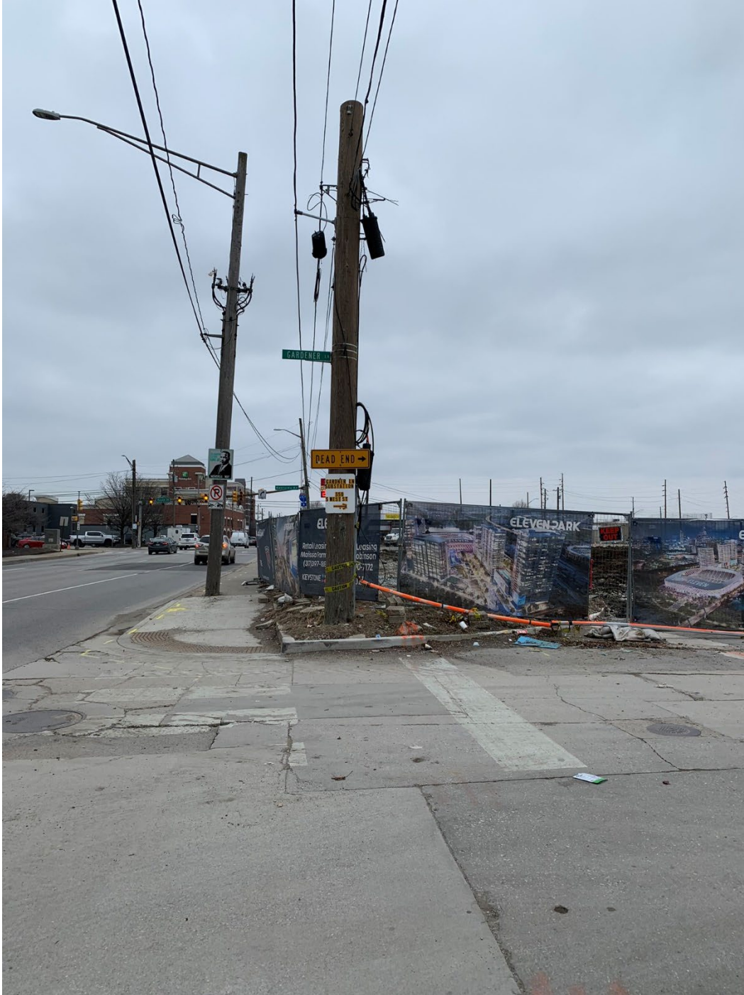
Photo of northeast corner of subject site, at intersection of Gardner Lane and West Street looking south