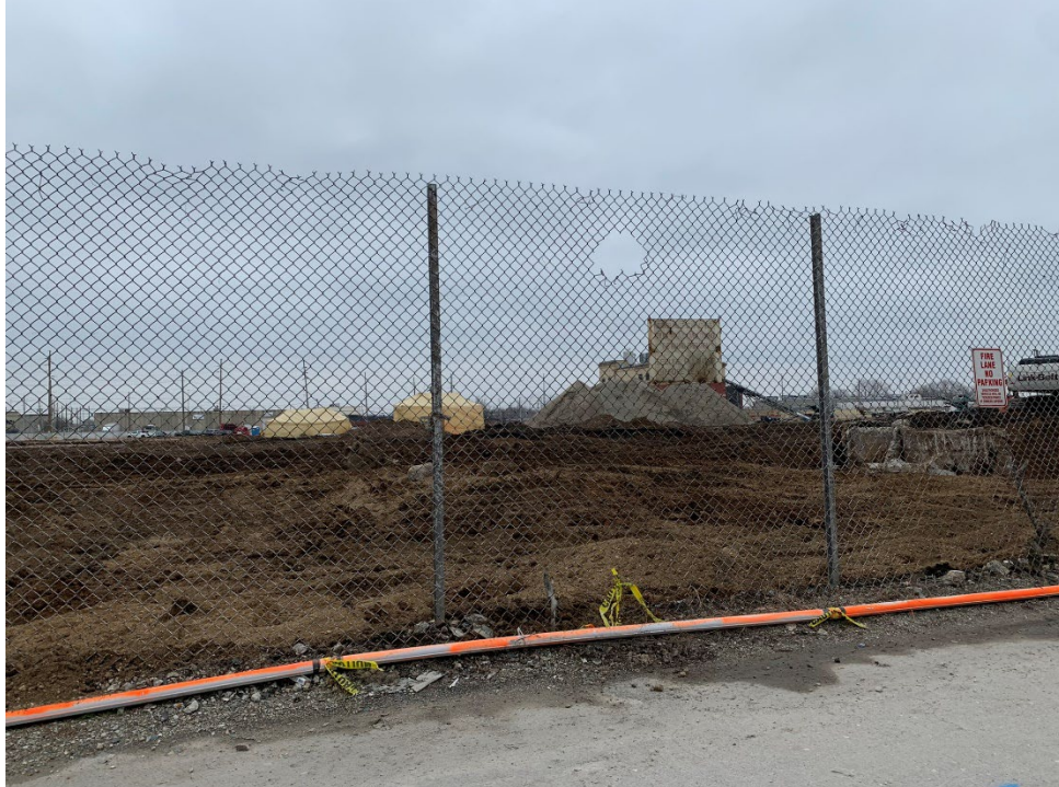
Photos of subject site from Gardner Lane looking south