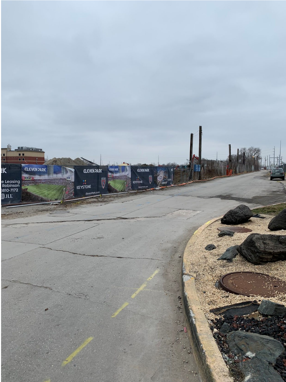
Photo of subject site along Gardner Lane looking west