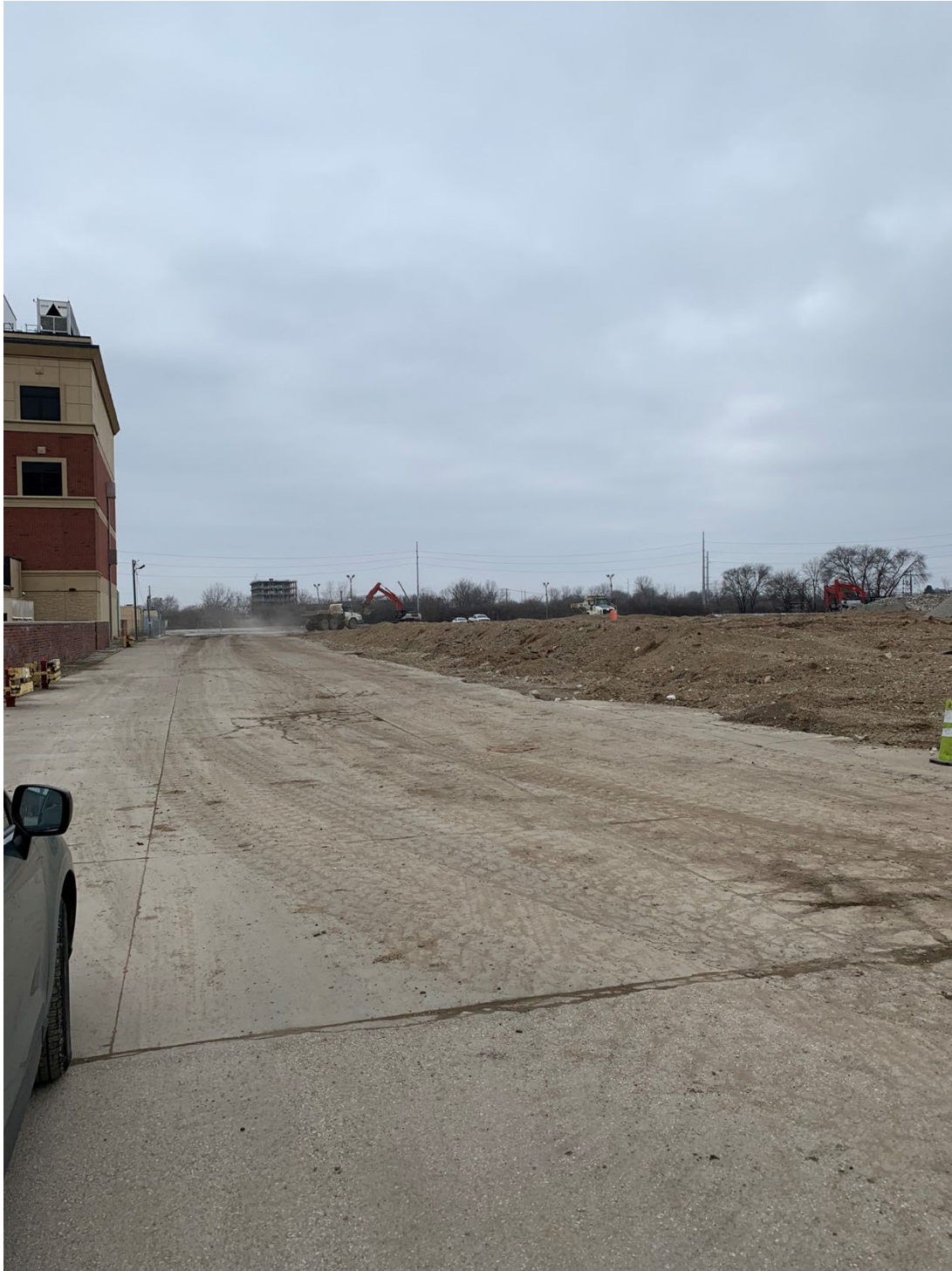
Photo of southern portion of the subject site along future Henry Street right-of-way from Kentucky Avenue looking west