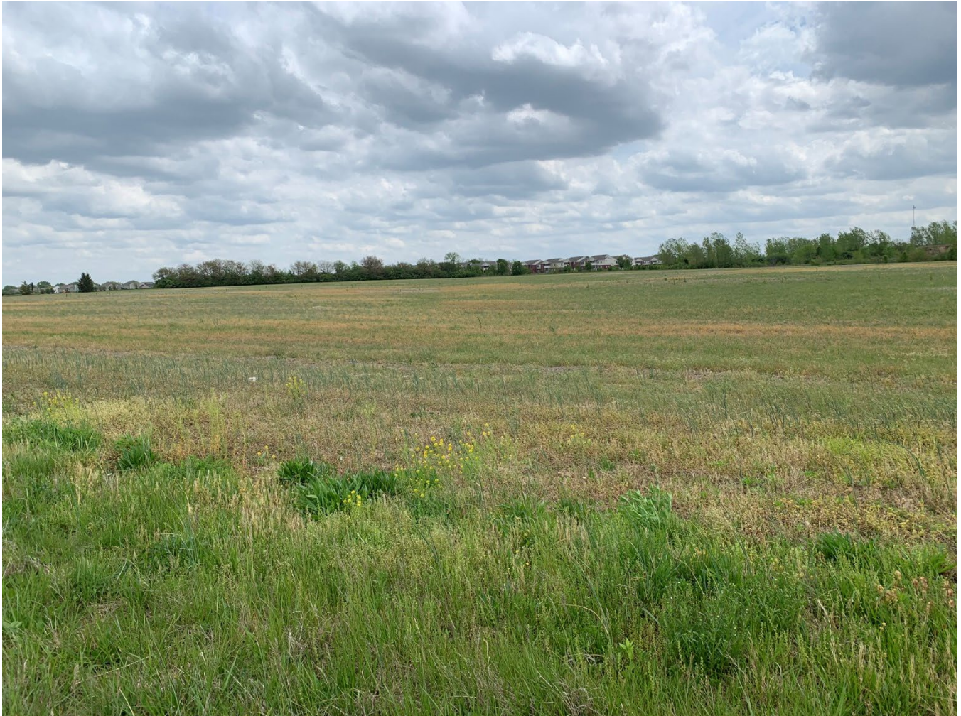
View from Kentucky Avenue looking east toward subject site