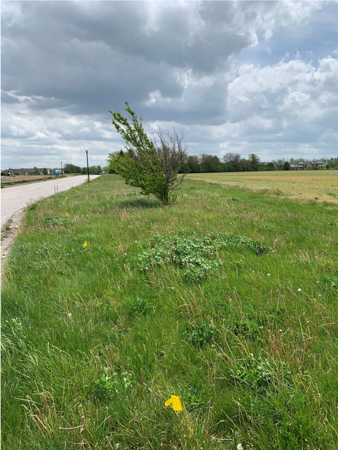
View of north end of subject site along Camby Village Boulevard looking east