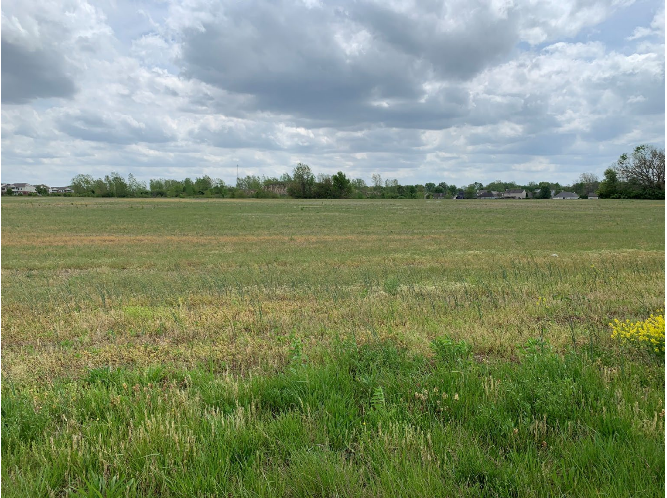
View from Kentucky Avenue looking east toward subject site