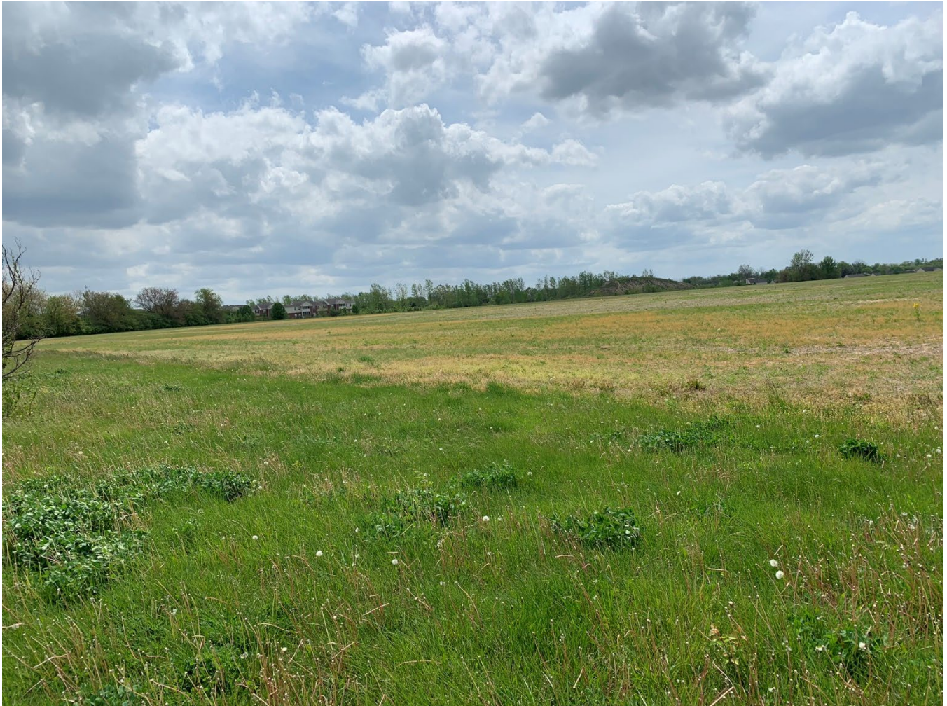
View from Camby Village Boulevard looking southeast toward subject site