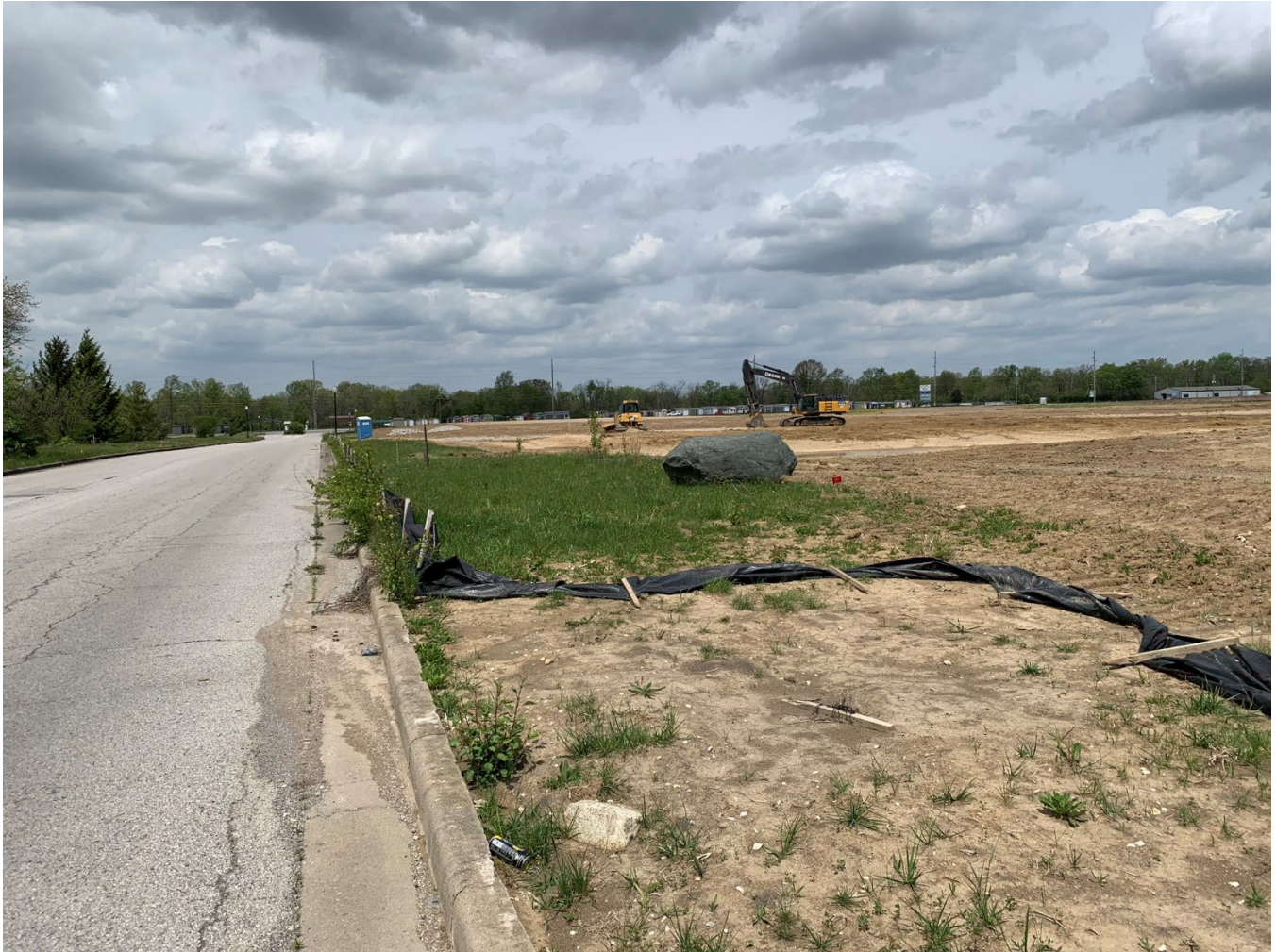
View of Camby Village Boulevard looking west toward Kentucky Avenue (subject site is to the right)