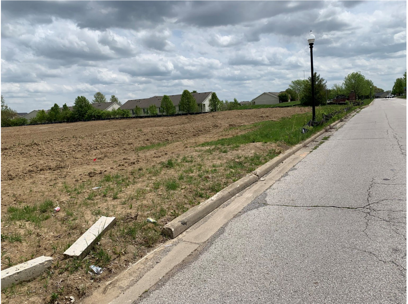
View looking east toward existing multi-family dwellings