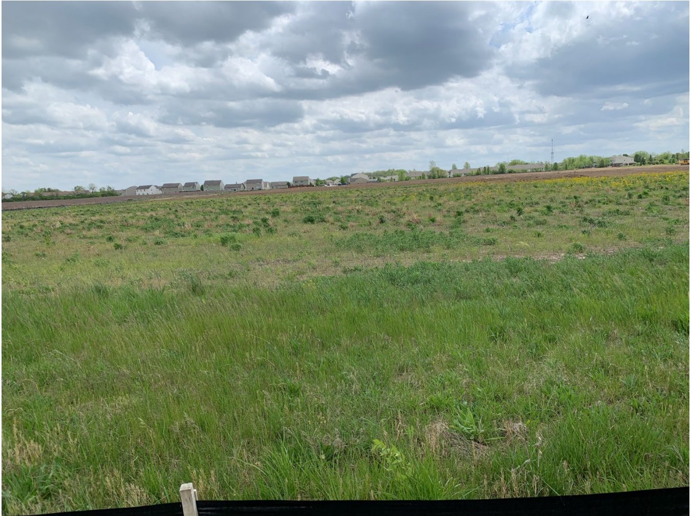
View from Kentucky Avenue looking east into subject site