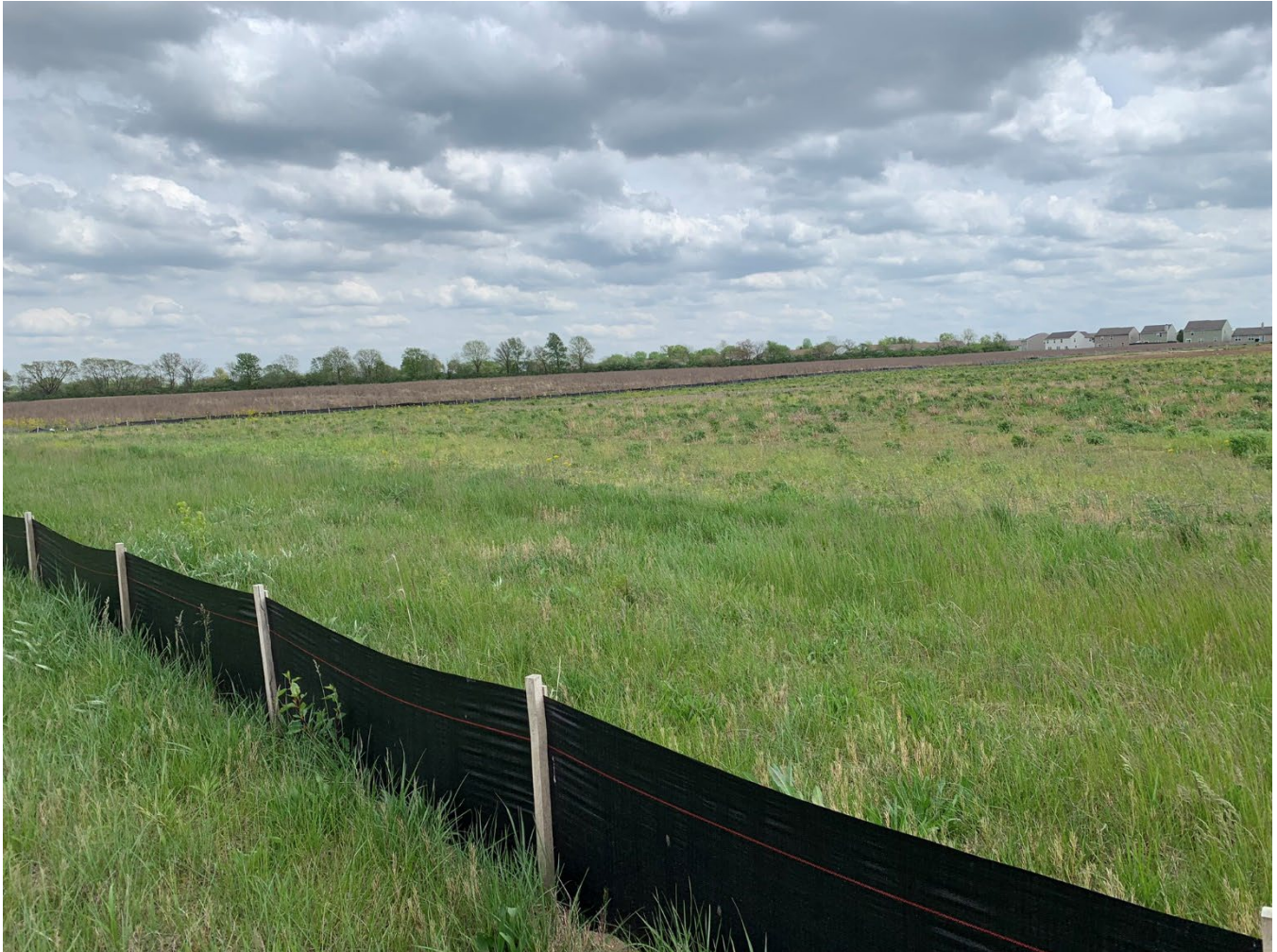
View from Kentucky Avenue looking northeast across subject site